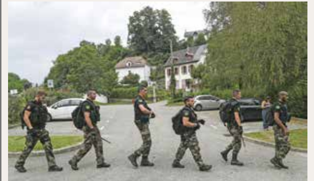
French gendarmes patrol in Pont-de-Beauvoisin after the disappearance of a 9-year-old girl.