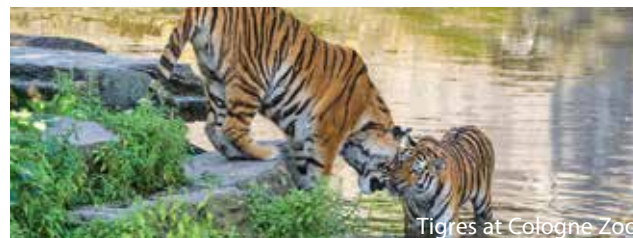
Tigers at Cologne Zoo