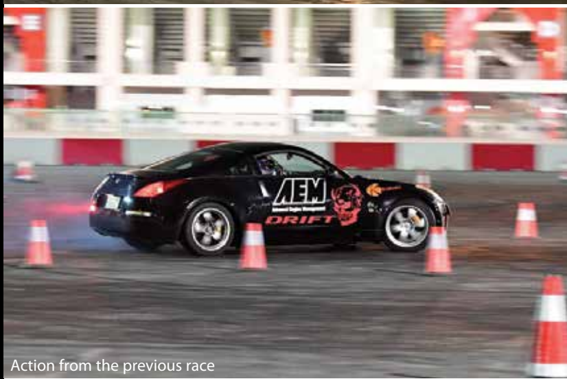
Action from the previous race