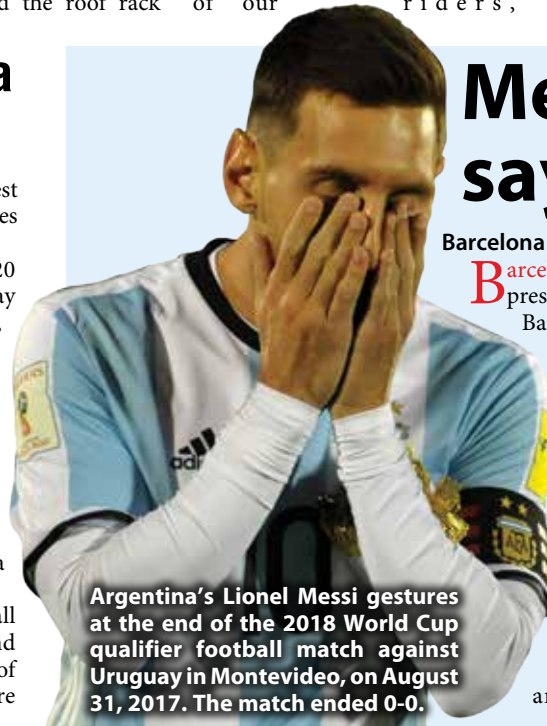
Argentina's Lionel Messi gestures at the end of the 2018 World Cup qualifier football match against Uruguay in Montevideo, on August 31, 2017. The match ended 0-0.

"Alongside these, England's white-ball contests against India, Australia and Scotland will give a fascinating guide to form ahead of the ICC Cricket World Cup, to be staged here in 2019."