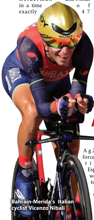
Bahrain-Merida's Italian cyclist Vincenzo Nibali