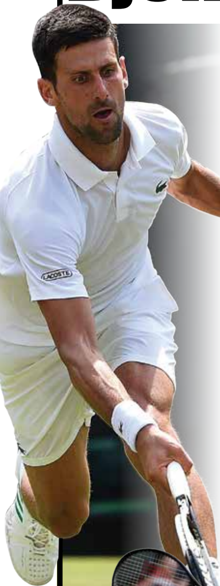
Serbia's Novak Djokovic