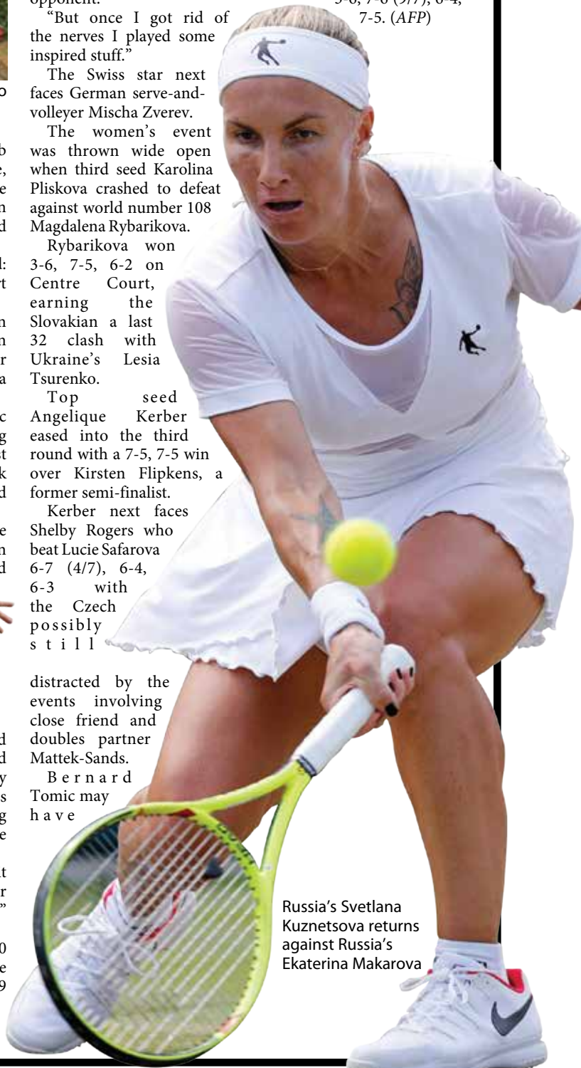
Russia's Svetlana Kuznetsova returns against Russia's Ekaterina Makarova