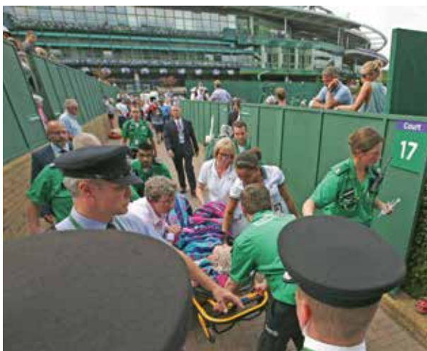
US player Bethanie Mattek-Sands is carried on a stretcher to an ambulance after suffering an injury

"She was in shock. Her knee was in a very weird position. I've never seen