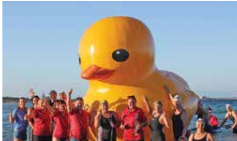
The enormous inflatable duck that broke its moorings in Australia (file photo)

Reports of sightings flooded in, including one from 440 kilometres (270 miles) away.