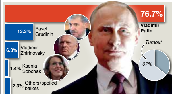
Source: Central Election Commission Pictures: Associated Press © GRAPHIC NEWS