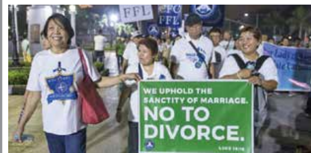
Philippine Catholics take part in a "Walk for Life" protest at a park in Manila