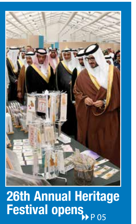
26th Annual Heritage Festival opens