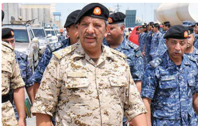
Field Marshal Shaikh Khalifa bin Ahmed Al Khalifa (file picture)

"The Military Court of Cassation turned down the objections raised by four convicts against the death penalty and 15 years jail