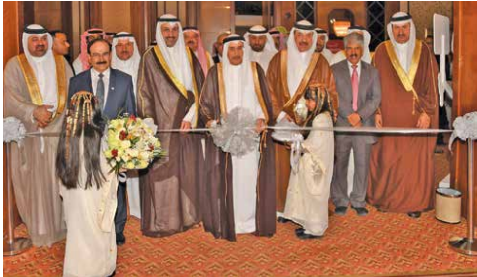
Deputy Prime Minister Shaikh Khalid bin Abdullah Al Khalifa during the inauguration of the 4th Occupational Safety Conference and Exhibition. The event consolidates kingdom's status as a major host of specialised conferences and exhibitions. The exhibition, organised by the Labour and Social Development Ministry, is being held at the Gulf Hotel's