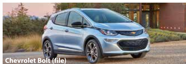
Chevrolet Bolt (file)

Tesla Motors is also ramping up a launch of its all-electric Model 3 aimed at the middle market. Tesla has made the first deliveries of its car and aims to hit a production level of 5,000 units a week starting this year. The Bolt's battery problem has turned up in less than one percent of the 10,000 vehicles sold.