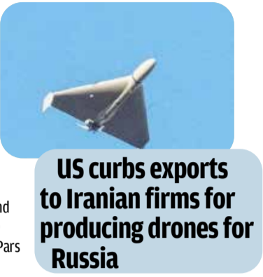
US curbs exports to Iranian firms for producing drones for Russia

yesterday added seven Iranian entities to its trade blacklist for producing drones that Russia has used to attack Ukraine, according to a posting by the US Department of Commerce. The Iranian entities added to the blacklist are Design and Manufacturing of Aircraft Engines, Islamic Revolutionary Guard Corps Aerospace Force, Islamic Revolutionary Guard Corps Research and Self-Sufficiency Jihad Organization, Oje Parvaz Mado Nafar Company, Paravar Pars Company, Qods Aviation Industry, and Shahed Aviation Industries. The Commerce Department posting said the Iranian unmanned aerial vehicles (UAVs) produced are being transferred to Russia for use in Ukraine, activity that is contrary to US national security and foreign policy interests.