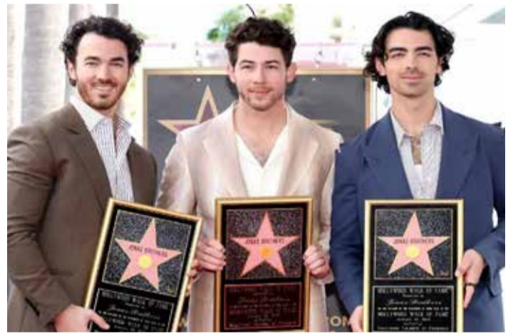
The Jonas Brothers attend the Hollywood Walk of Fame star ceremony

In a post, Britney wrote: "Since everyone thinks they know my story. Think again!! "A mere side of any given Sunday doesn't show worship placing someones story out there ... it's a day of welcom-