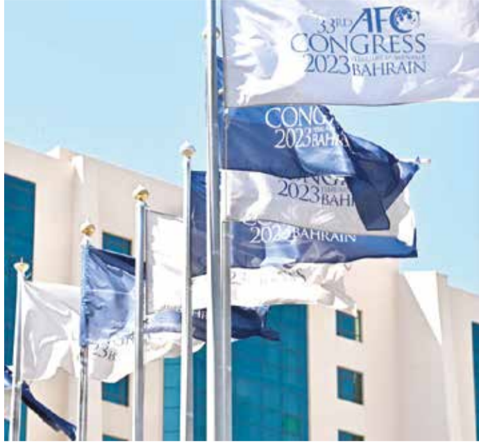
Flags in Bahrain set up to mark the 33rd AFC Congress

Also to be confirmed are the members of the AFC Executive Committee for the term 2023 to