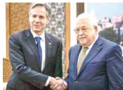
Palestinian President Abbas with US Secretary of State Blinken

following the incident last week when a Palestinian gunman killed seven people outside a synagogue in Jerusalem, and amid anger among Palestinians over the actions of Israeli forces and settlers in the occupied West Bank.