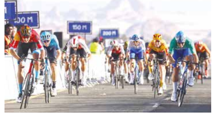
Jonathan Milan, far left, competes in the final sprint to the finish

In the last km, Milan and Groenewegen dueled, and with a few hundred metres to go, Milan launched his sprint early catching Groenewegen off guard, and managed to hold his effort to the line.