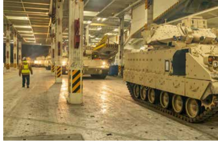
A convoy of Ukraine-bound Bradley Fighting Vehicles load onto the carrier ARC Integrity at the Transportation Core Dock in North Charleston, South Carolina

There was no immediate response from Kyiv to Moscow's claim about the village of Blahodatne, and Reuters was not immediately able to verify the