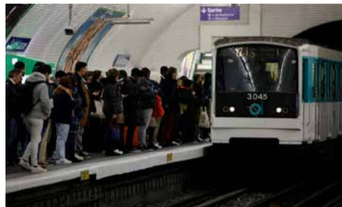
Passengers stand on a platform during a strike by Paris transport network (RATP) workers at Saint-Lazare metro station in Paris

reading "No to the reform" or "We won't give up," many said they would take to the streets as often as needed for the government to back down.