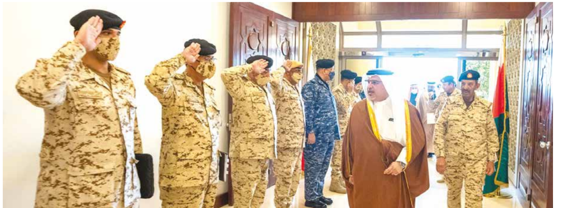
A warm welcome for His Royal Highness upon arrival at the BDF General Command