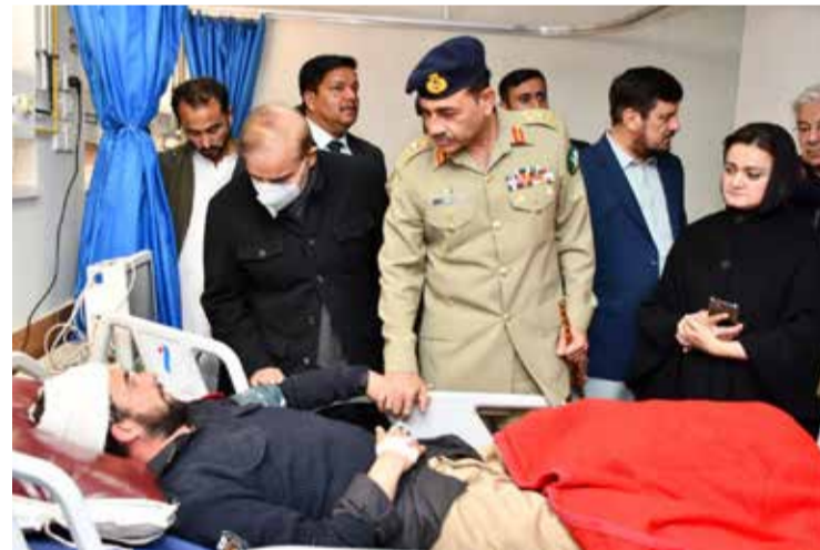
Chief of Army Staff (COAS) of Pakistan Asim Munir and Pakistan's Prime Minister Shehbaz Sharif visit an injured, after a suicide blast in a mosque, at a hospital in Peshawar, Pakistan

The attack, in the Police Lines district, was the deadliest in a decade to hit this restive, north-western city near the Afghan border and comes amid a surge in violence against the police.