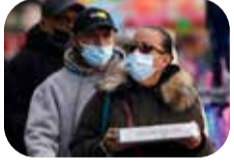
US to end COVID-19 emergency declarations on May 11

administration yesterday said it will end COVID-19 emergency declarations on May 11, nearly three years after the United States imposed sweeping pandemic measures to curb the spread of the illness. The COVID-19 national emergency and public health emergency (PHE) were put in place in 2020 by then-President Donald Trump. Biden has repeatedly extended the measures, which allow millions of Americans to receive free tests, vaccines and treatments. The White House's Office of Management and Budget (OMB) said in a statement the declarations, which were set to expire in the coming months, would be extended again until May 11 and then terminated.