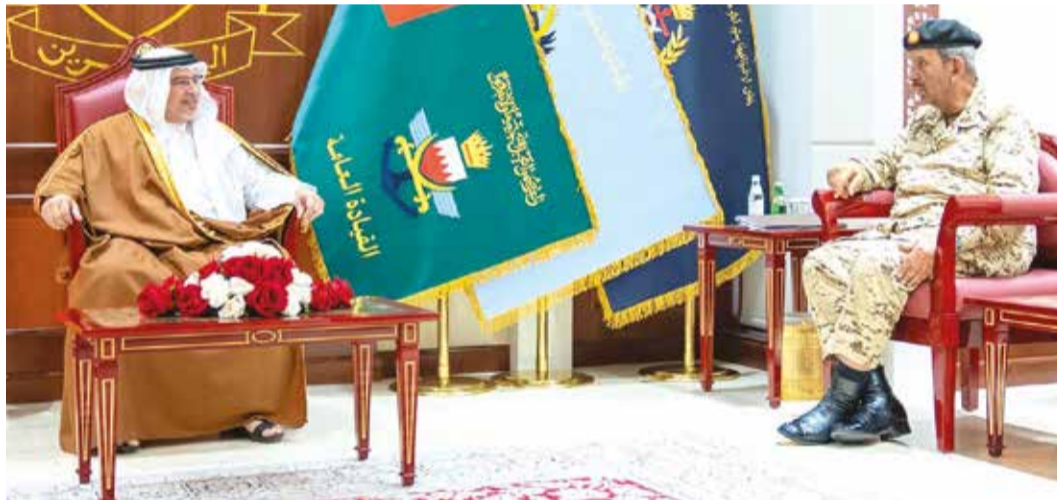
HRH Prince Salman holds talks with Field Marshal Shaikh Khalifa bin Ahmed

mander of the Armed Forces was speaking as he visited yesterday the BDF General Command.