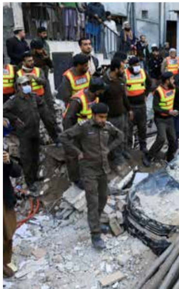
People and rescue workers gather amid the aftermath of the mosque blast

"My son, my child," cried an elderly woman walking alongside an ambulance carrying coffins, as rescue workers stretched wounded people to a hospital emergency unit.