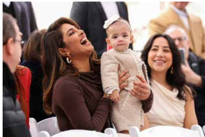
Priyanka Chopra and Malti Marie Chopra Jonas attend the event

Nick Jonas and Priyanka Chopra's daughter, Malti, made her adorable debut at the Jonas Brothers' Walk of Fame ceremony on Monday.