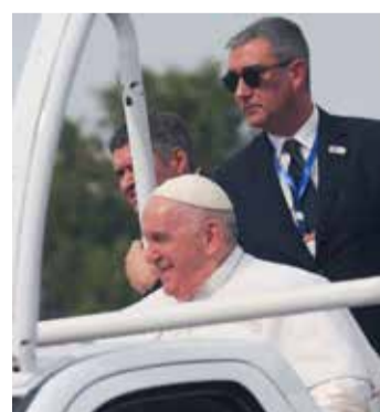
Pope Francis waves as he is welcomed by residents of Kinshasa

Tens of thousands of people lined the route from Kinshasa airport into town, with some breaking away to chase the pope's convoy while others