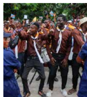
Residents of Kinshasa celebrate

At the airport earlier, the 86-year-old pope, who struggles to walk due to a chron-