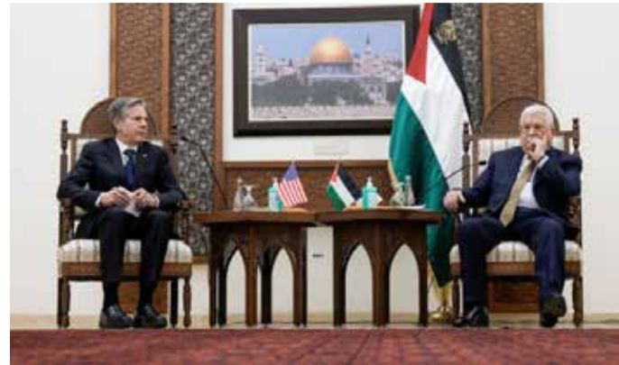
Blinken meets with Abbas in Ramallah

with the US administration and the international community to restore political dialogue in order to end the Israeli occu-