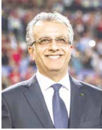
Shaikh Salman bin Ebrahim Al Khalifa

● Bahrain's Shaikh Salman bin Ebrahim Al Khalifa to run unopposed for third term as AFC president