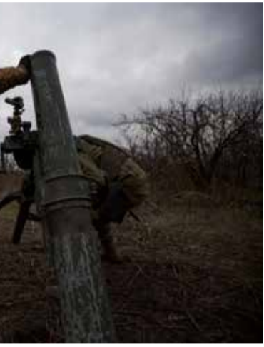
firing it towards positions of Russian in the outskirts of Bakhmut, Donetsk

gained a foothold there, while Kyiv says it has largely repelled that attack so far.