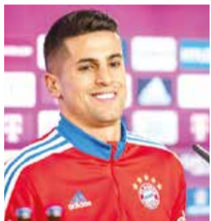
Joao Cancelo | Munich

Bayern Munich have signed Portugal wing-back Joao Cancelo on loan until the end of the season from Manchester City, the German club confirmed yesterday.