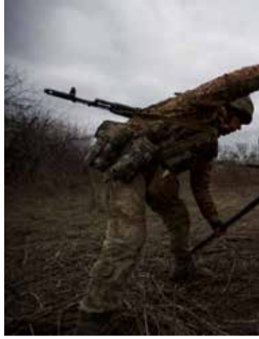
Ukrainian servicemen set up a mortar for troops, amid Russia's attack on Ukraine, in the region, Ukraine