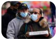
US to end COVID-19 emergency declarations on May 11

said it will end COVID-19 emergency declarations on May 11, nearly three years after the United States imposed sweeping pandemic measures to curb the spread of the illness. The COVID-19 national emergency and public health emergency (PHE) were put in place in 2020 by then-President Donald Trump. Biden has repeatedly extended the measures, which allow millions of Americans to receive free tests, vaccines and treatments. The White House's Office of Management and Budget (OMB) said in a statement the declarations, which were set to expire in the coming months, would be extended again until May 11 and then terminated.