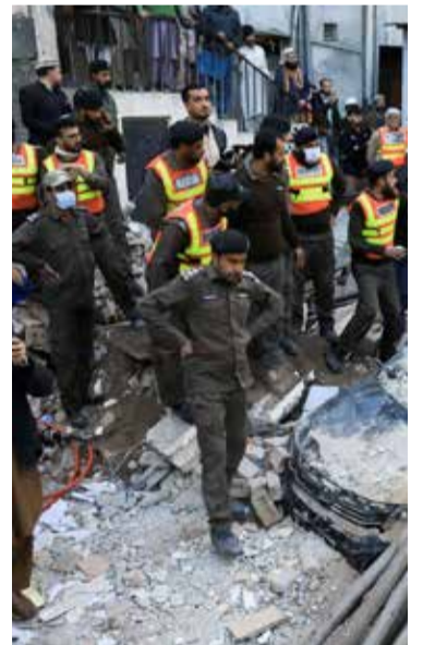
People and rescue workers gather amid the hall when he struck.

"My son, my child," cried an elderly woman walking alongside an ambulance carrying coffins, as rescue workers stretchered wounded people to a hospital emergency unit.