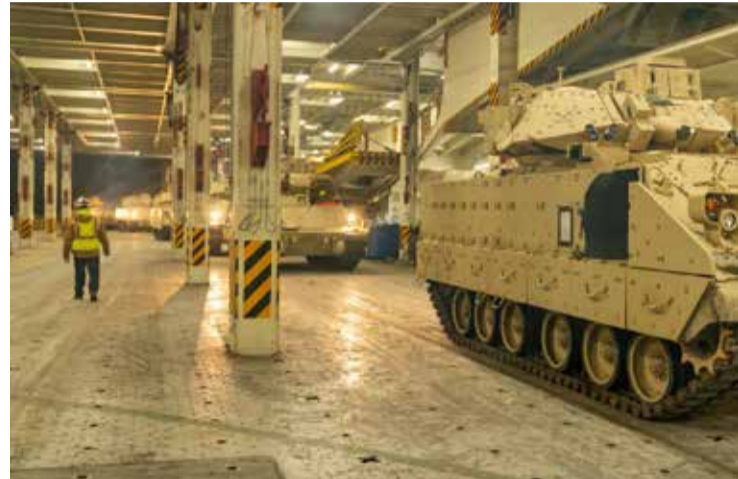
A convoy of Ukraine-bound Bradley Fighting Vehicles load onto the carrier ARC Integrity at the Transportation Core Dock in North Charleston, South Carolina

● Russia's gains this month biggest since mid-2022