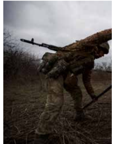
Ukrainian servicemen set up a mortar for troops, amid Russia's attack on Ukraine, in region, Ukraine