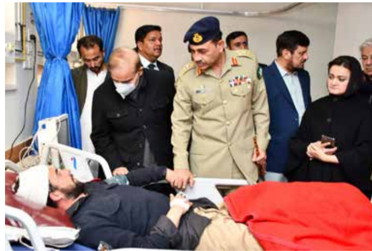
Chief of Army Staff (COAS) of Pakistan Asim Munir and Pakistan's Prime Minister Shehbaz Sharif visit an injured, after a suicide blast in a mosque, at a hospital in Peshawar, Pakistan