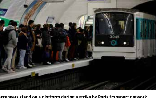
Passengers stand on a platform during a strike by Paris transport network (RATP) workers at Saint-Lazare metro station in Paris

Huge crowds marched aire on the Atlantic coast. through cities across France to cron's ability to push through work until 64, it's not possible." change now that he has lost his