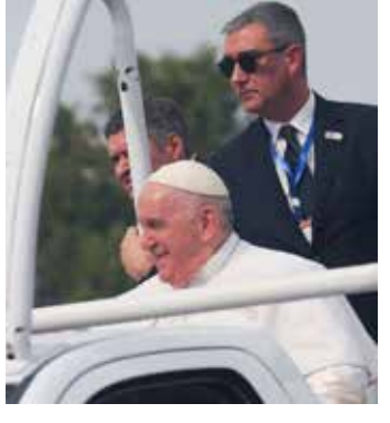
Pope Francis waves as he is welcomed by residents of Kinshasa

ple lined the route from Kin- foreign trips. shasa airport into town, with the pope's convoy while others gles to walk due to a chroninside.