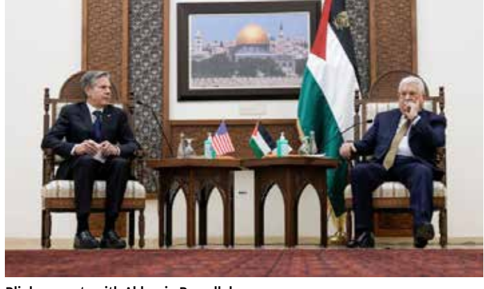
Blinken meets with Abbas in Ramallah

Calling for "the complete cessation of unilateral Israeli actions, which violate the signed agreements and international law", Abbas reiterated the Pal-