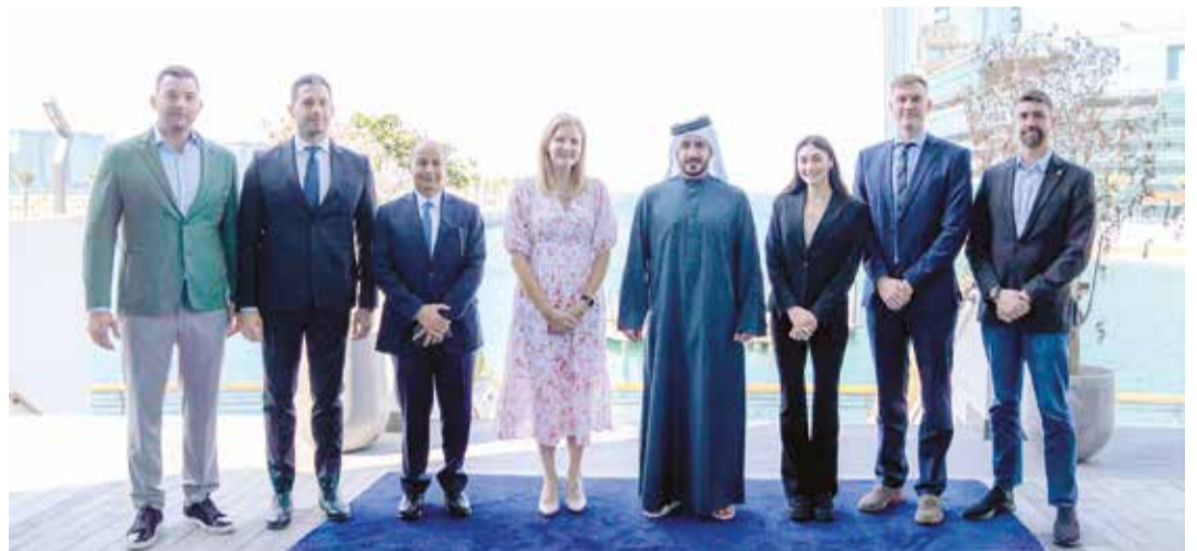
HH Shaikh Khalid bin Hamad Al Khalifa, fourth from right, with other officials at the event

"Bahrain is a nation of islands, united by the water that surrounds us," HH Shaikh Khalid said. "With an ever increasing diversity of partnerships, Bahrain continues to be one of the