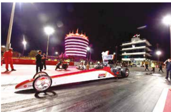
A car in action at BIC

The Bahrain Drag Racing Championship has attracted