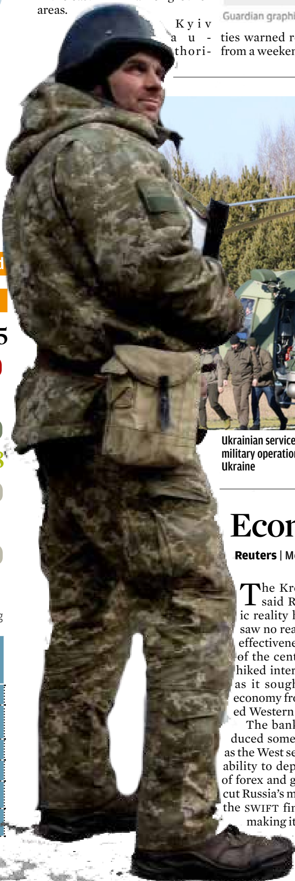
Ukrainian service members are seen after Russia launched a massive military operation against Ukraine, at a check point in the city of Zhytomyr, Ukraine

would see newly erected fortifications, tank traps and other defensive installations in the streets as the city girds for further battle.