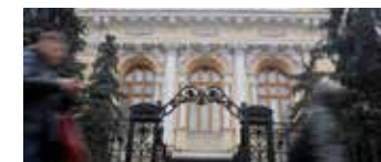
People walk past the Central Bank headquarters in Moscow

The bank has also introduced some capital controls as the West seeks to restrict its ability to deploy $640 billion of forex and gold reserves and cut Russia's major banks out of the SWIFT financial network, making it hard for lenders and companies