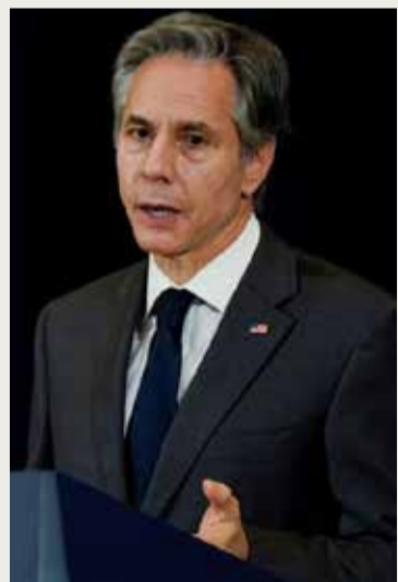
US Secretary of State Antony Blinken