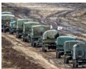
Military vehicles take part in drills held by Belarusian and Russian troops at a training ground near Brest earlier this month

revoking its non-nuclear status after a referendum, allowing Russian weapons to be placed in Belarus. The move provoked rare protests in the country.