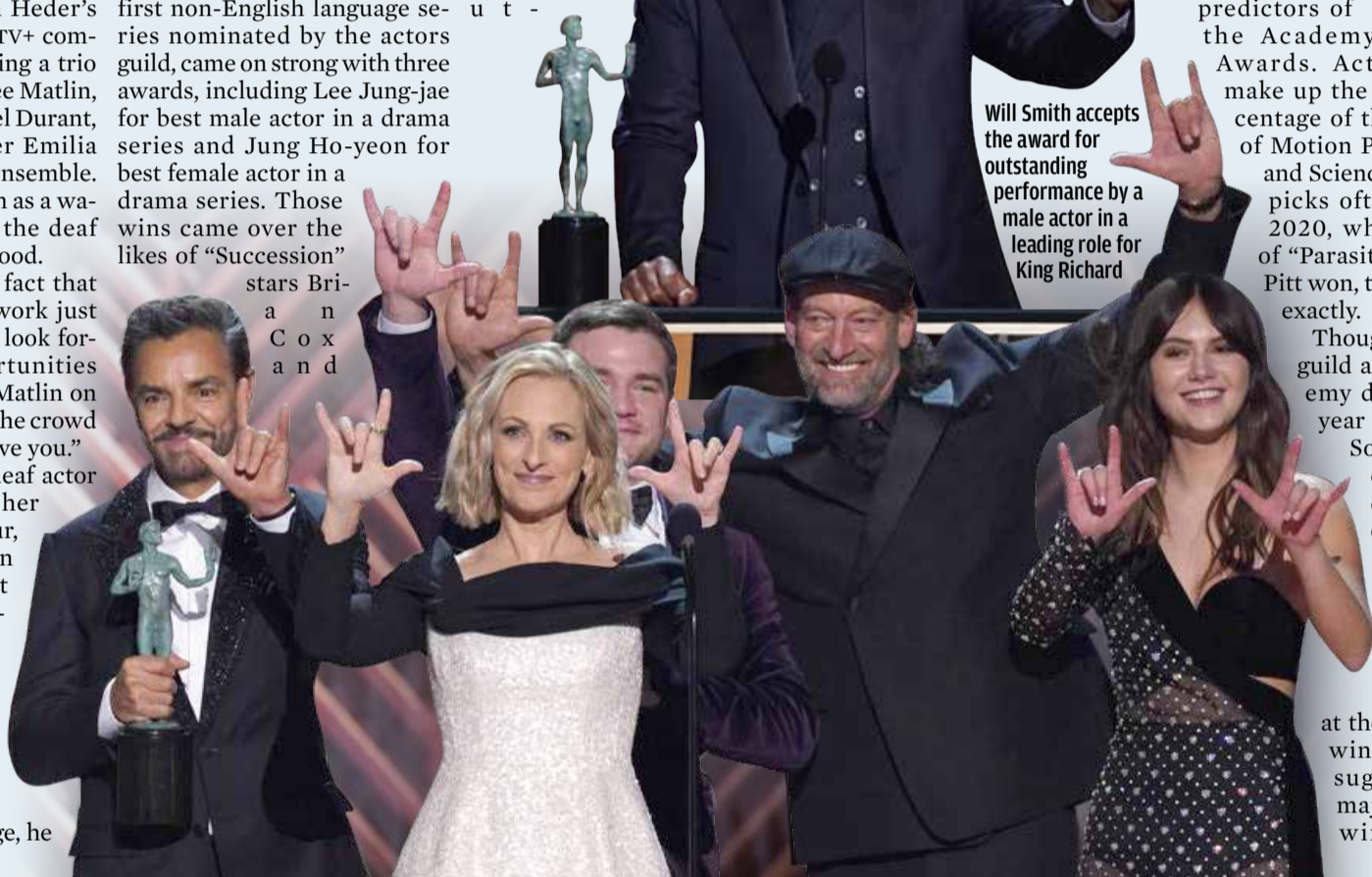
The cast of Coda accepts the award for outstanding performance by a cast in a motion picture