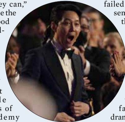
Will Smith accepts the award for outstanding performance by a male actor in a leading role for King Richard

The SAG Awards are considered one of the most reliable predictors of the Academy Awards. Actors Lee Jung-jae first Oscar. Smith took best actor, scoring his first SAG award. "That may have been one of the greatest moments of my career just now because my name was called for 'King Richard' sitting next to Venus Williams," beamed Smith.