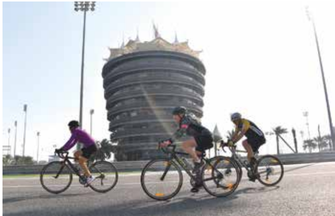
Participants in action at BIC