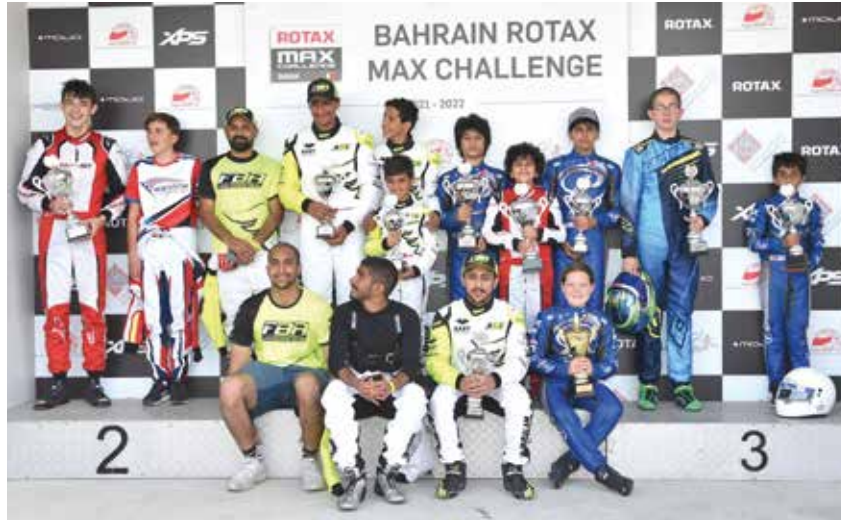
The round's winners at their podium ceremony at BIKC