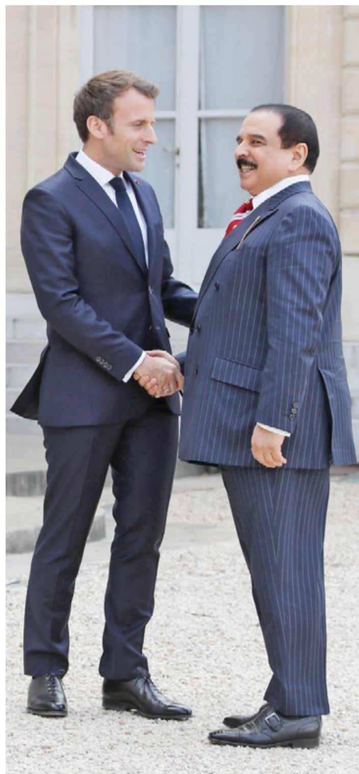
His Majesty being received by President Macron at Élysée Palace.

Discussions also showed an agreement on the importance of sustainable stability in the Arabian Gulf which requires the Gulf countries and their allies a firm action against terrorism and all forms of interference in countries' affairs. Both leaders also stressed the need to respect the countries' independence, sovereignty and territorial integrity in order to serve interna-