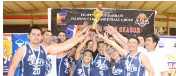
Master Jun's Angels celebrate with the trophy