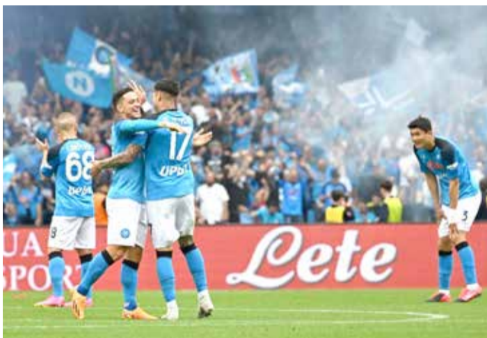
Napoli's Giacomo Raspadori (2ndL) congratulates Mathias Olivera (3rdL) after Olivera opened the scoring

ly disappointed at not having made our brilliant fans happy tonight. But you've seen for a while that these points are the hardest ones to get," coach Luciano Spalletti told DAZN.