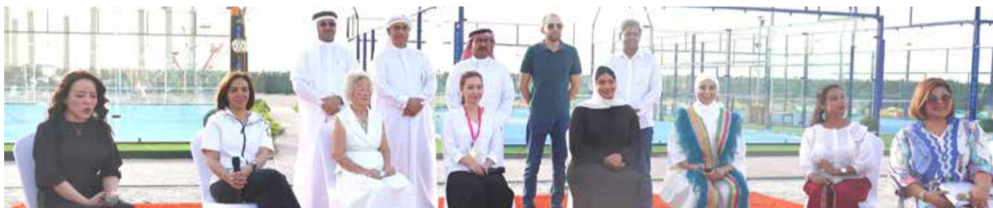
Panel discussion at the event

"We hope that through this event, we were able to provide a conscious space in taking care of