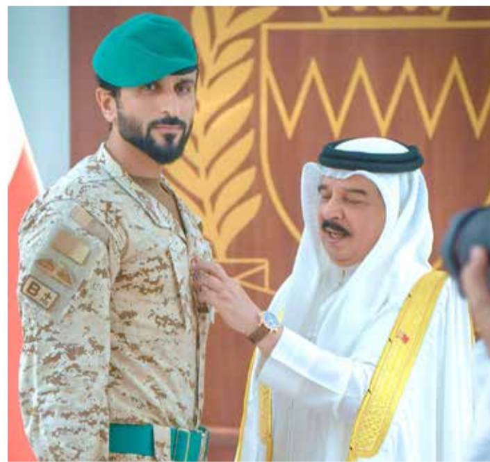
HM the King with HH Shaikh Nasser

ness Shaikh Abdulla bin Hamad Al Khalifa, and Royal Guard Spe-