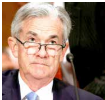
Fed Chair Jerome Powell

Analysts and traders expect the Fed to hike interest rates by 25 basis points and then hold them high in a bid to bring infla-