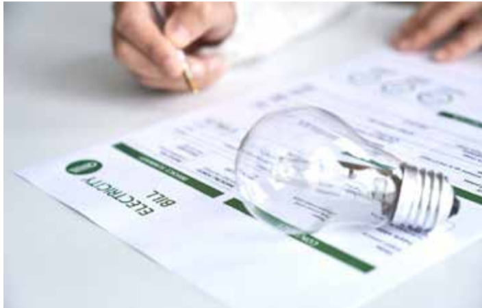
The cost of electricity and water is rising during summer months

ident, told The Daily Tribune that her area's power bills are