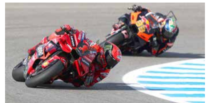
Ducati Italian rider Francesco Bagnaia (L) rides ahead of KTM South African rider Brad Binder