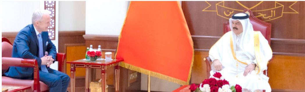
HM King receives the 77th UNGA President

HM King Hamad highlighted the meeting of the Council of Presidents of the United Nations General Assembly, hosted by the Kingdom last March, and its outcome in terms of consolidating the UN's principles to achieve global progress and