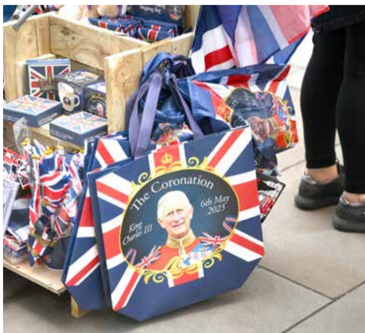
Royal souvenirs are seen for sale on a street in central London, on April 28, 2023 ahead of the coronation ceremony of Charles III and his wife, Camilla, as King and Queen of the United Kingdom and Commonwealth Realm nations

When his mother became queen in 1952, Charles also received an income from the Duchy of Cornwall, an estate established in the 14th century