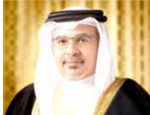
HRH Prince Salman TDT | Manama

His Royal Highness Prince Salman bin Hamad Al Khalifa, the Crown Prince, Deputy Supreme Commander of the Armed Forces and Prime Minister, yesterday sent a cable of congratulations to the National Security Advisor, Secretary-General of the Supreme Defence Council, and Commander of the Royal Guard, His Highness Lieutenant-General Shaikh Nasser bin Hamad Al Khalifa, on the promotion to the rank of Lieutenant-General, following a Royal Order by His Majesty King Hamad bin Isa Al Khalifa.