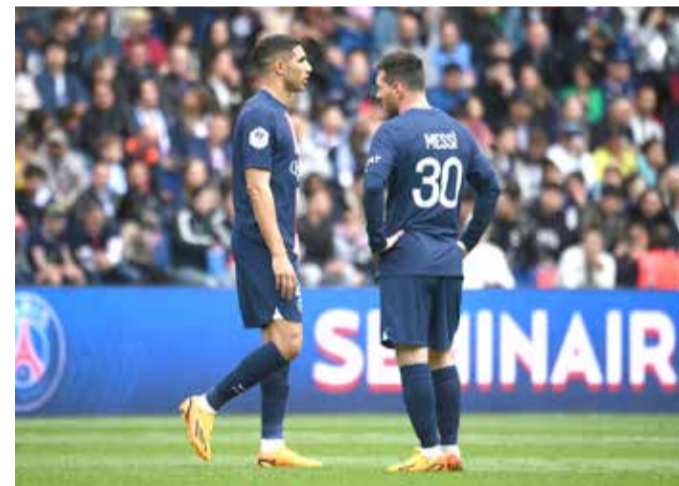
Achraf Hakimi trudges past Lionel Messi and off the pitch after being shown a red card