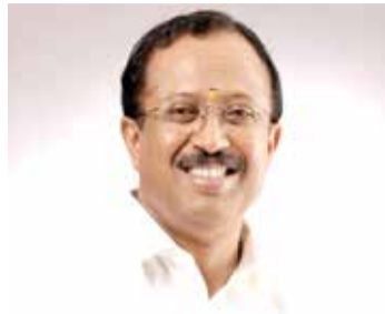
Shri V. Muraleedharan

Muraleedharan's visit to Bahrain will be his second visit to the country. He last visited Bahrain in August 2021. The Minister will hold discussions with various Bahraini dignitaries and meet Indian community organisations as well as Indians working in different sectors.