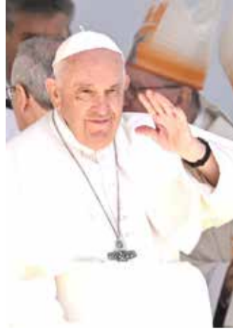
Pope Francis waves as he celebrates a holy mass at Kossuth Lajos' Square during his visit in Budapest

Throughout his visit to Budapest -- his second since a brief 2021 stopover -- Francis