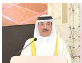
Labour Minister speaks at the event

He conveyed the greetings and best wishes of HM the King and His Royal Highness Prince Salman bin Hamad Al Khalifa,