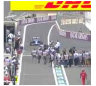
Esteban Ocon drives into the pitlane