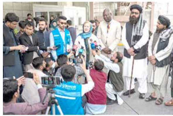
The United Nations assistant secretary-general and assistant high commissioner for protection (UNHCR) Gillian Triggs (C) speaks to the media upon her arrival at the airport in Kabul

Considered the world's biggest humanitarian crisis by the United Nations, Guterres's quandary has been deepened by the Taliban administration's move to stop girls going