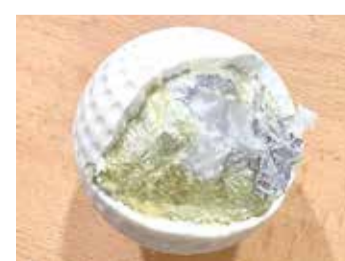
The seized drug

33kg of Hashish and another type of narcotics locally known as 'Shabu' worth BD700,000.