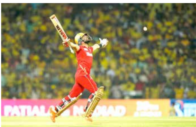
Sikandar Raza of Punjab Kings celebrates after the win