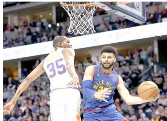
Jamal Murray #27 of the Denver Nuggets outlets the ball while being guarded by Kevin Durant #35 of the Phoenix Suns

Jokic had gone so far as to say the Suns could be consid-