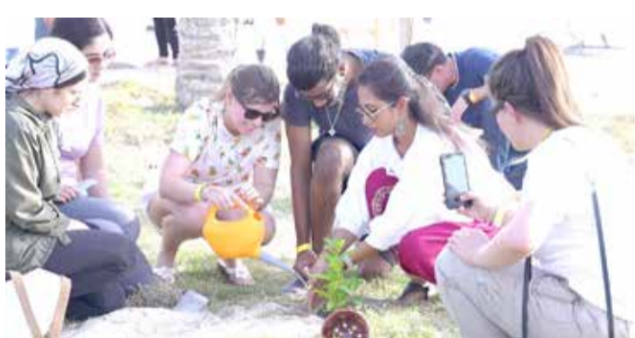
Volunteers planting trees at the event