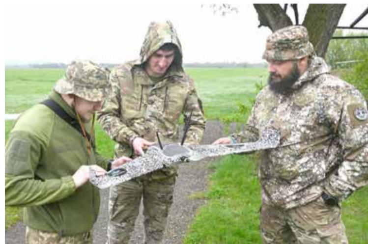
Ukrainian soldiers inspect a new Sirko reconnaissance drone outside Kharkiv

The strike on the village of Suzemka, which lies a dozen kilometres (seven miles) from the Ukrainian border, came the night after a suspected drone hit a fuel depot in Moscow-annexed Crimea.