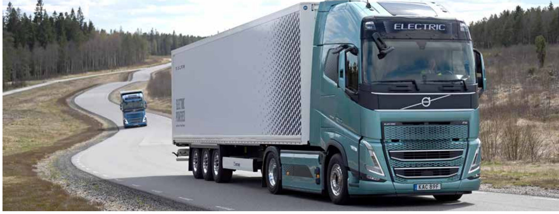
A Volvo electric truck (front) and a Volvo fuel cell electric truck (back) driving at the company's proving ground in Hällered near Boras, east of Gothenburg, Sweden.

"Just four or five years ago, people would have said 'You're Diesel is king, it can't be beaten'," he said.