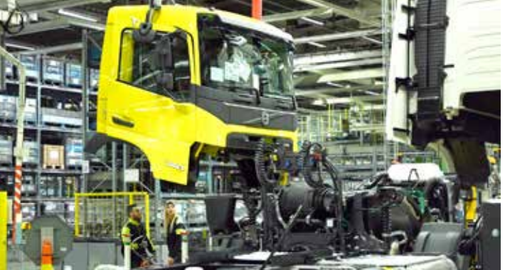
Employees working on the assembly line at the Volvo plant in Gothenburg, Sweden.

The electric trucks are also Race to launch crazy, that's not going to happen. more expensive, currently costing between two to three times more than a traditional diesel