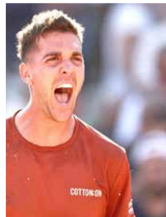
Australia's Thanasi Kokkinakis

"I've had a pretty crazy story. I came on the scene when I was