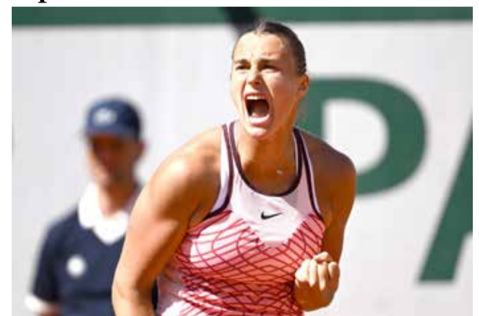
Belarus' Aryna Sabalenka