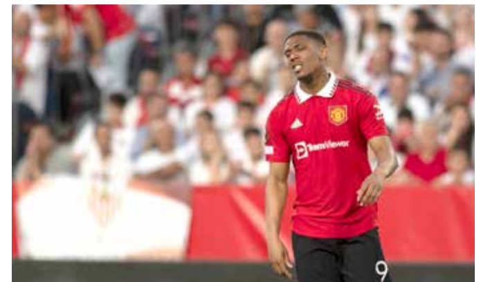
Manchester United's French striker Anthony Martial