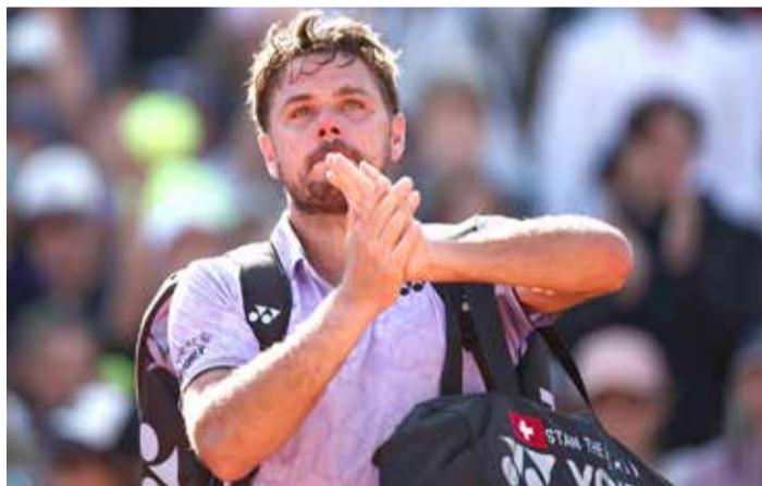
Switzerland's Stan Wawrinka