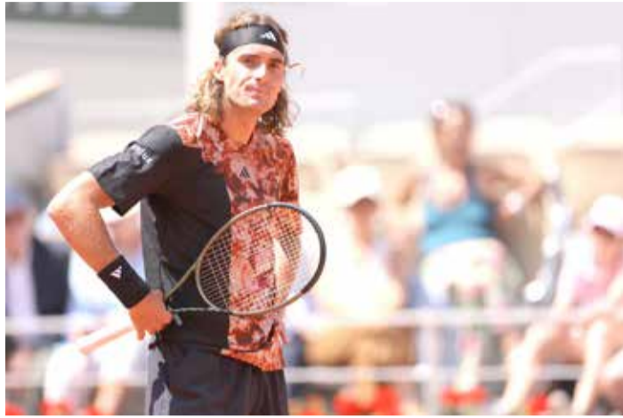
Greece's Stefanos Tsitsipas

As well as making two Grand Slam finals, the 24-year-old has fallen at the semi-finals on four occasions -- twice to bitter rival Daniil Medvedev (2020 and