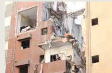
The aftermath of an Israeli military strike on a building in Beirut's southern suburbs

the building targeted by "the Zionist enemy". Rescue teams "have been working since the incident happened... to remove the rubble... and we are still waiting for the results of this operation regarding the fate of the