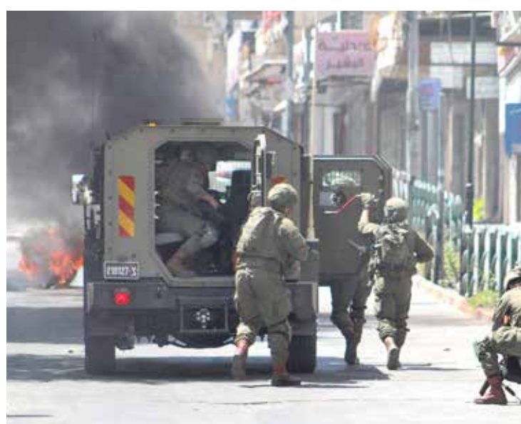
Smoke billows from burning tyres as Israeli soldiers deploy in the occupied West Bank city of Hebron