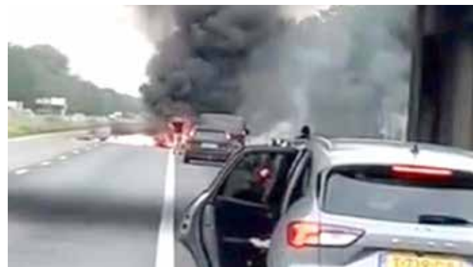
The accident happened at around 12:45 pm (1045 GMT) near the southern city of Breda, about 60 kilometres (38 miles) south of Rotterdam.