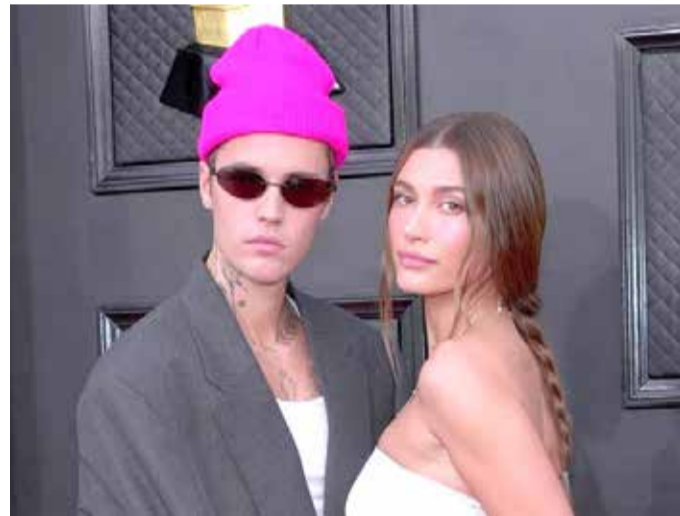
Justin and Hailey Bieber