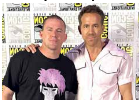
Channing Tatum and Ryan Reynolds

Channing wrote on Instagram: "I sat in the audience when Ryan showed his first peek of Deadpool 1 to the world and I think I ran back stage right after and found him and I think I just hugged him and was like holy s*** you did it man. It's perfect. I didn't know him really at all back then. But since