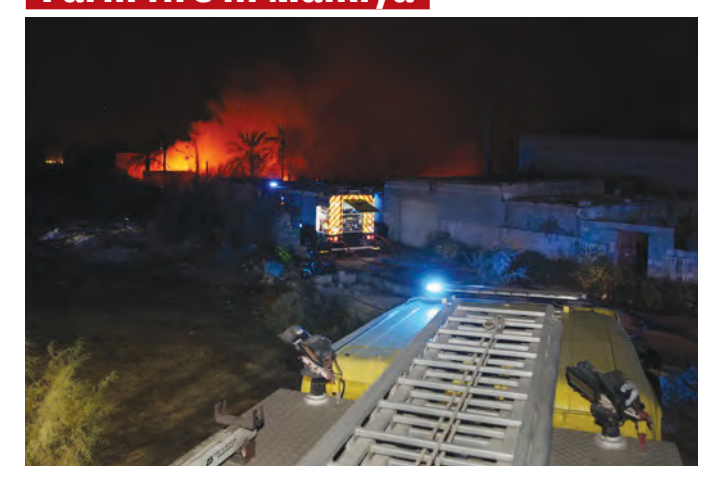
The General Directorate of Civil Defence rescued four individuals and extinguished a fire at a farm in Malkiya. Fifteen vehicles and 48 personnel were deployed to control the fire, with cooling operations immediately initiated to prevent any reignition. The rescued individuals are reported to be in stable condition. The Director-General noted that Civil Defence teams responded swiftly to the 1:48 a.m. report, containing the blaze and preventing its spread. Investigations are ongoing to determine the cause.