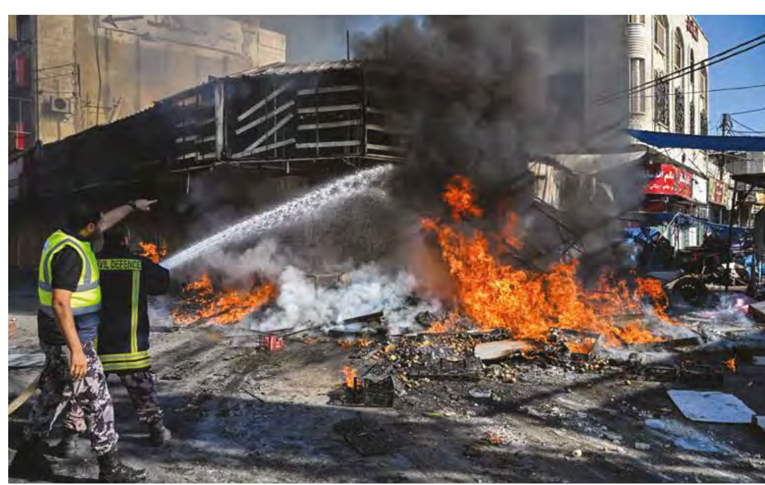
Palestinian Civil Defence firefighters douse the flames during a fire in a fruit market in the occupied West Bank city of Jenin amid ongoing Israeli raids