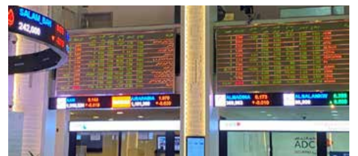
Electronic boards showing stock information are pictured at the stock market, in Dubai, United Arab Emirates

The company intends to sell around 550.7 million shares, or 11%, of issued share capital including 200 million new shares to be issued by Burjeel. The Abu Dhabi index posted a monthly decline of 1.3%, according to Refinitiv data.