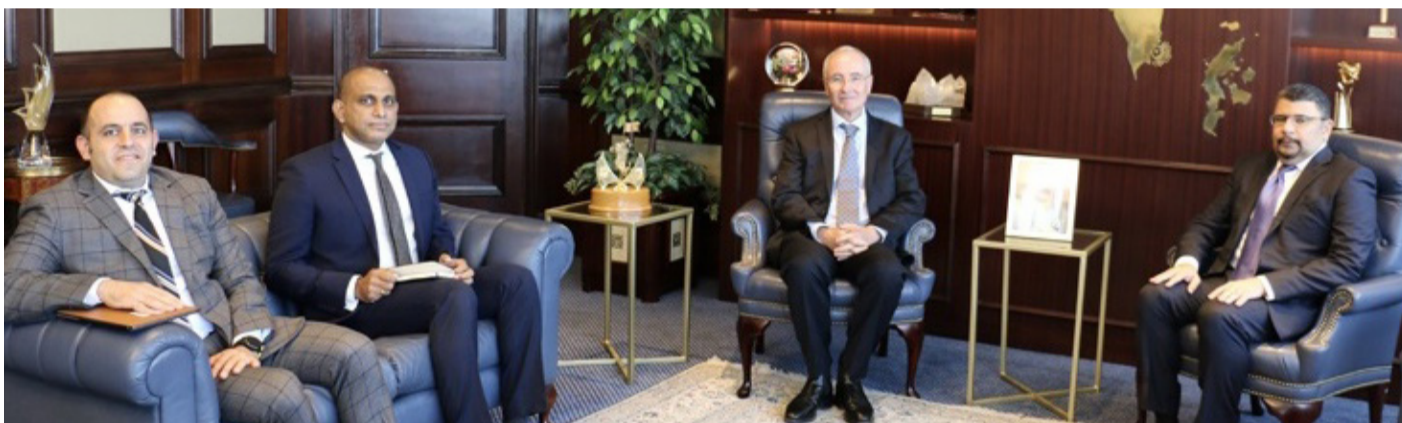
Electricity and Water Affairs Minister Yasser bin Ibrahim Humaidan received an HSBC high-level delegation led by Chief Executive Officer Christopher Russel, who outlined the bank's initiatives and projects to promote sustainability in its short and long-term strategic plans. The minister noted the pivotal role of the banking sector in supporting the Government's projects to develop electricity and water services and diversify their sources. The delegation commended the level of services provided by the Ministry of Electricity and Water Affairs, noting steps being taken to integrate renewable energy sources into the overall energy mix and encouraging the use of energy efficiency solutions.