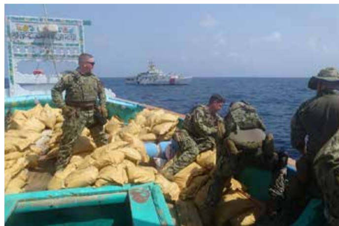
US Coast Guard personnel seize bags of illegal drugs from a fishing vessel

Homeported at Naval Station Mayport in Florida, the ship deployed in August as part of the USS George H.W. Bush Carrier Strike Group, which is operating in the Mediterranean