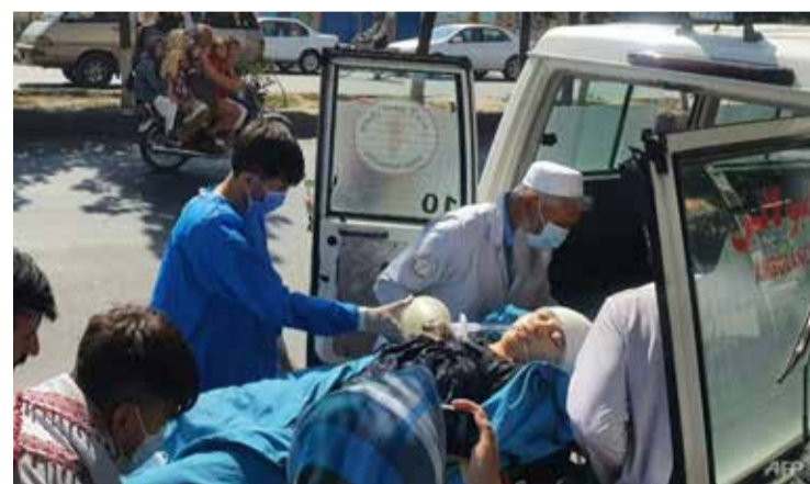
Relatives and medical staff shift a wounded girl from an ambulance outside a hospital in Kabul