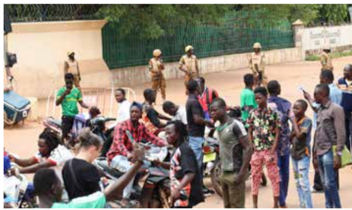
Soldiers block the road to stop the advance of protesters against junta leader Paul-Henri Damiba

More gunshots rang out near Burkina Faso's presidential palace yesterday afternoon, shortly after its military leader sought to quell fears of a second coup in eight months. Residents of the capital Ouagadougou woke to the sound of gunfire at dawn yesterday. Soon after, soldiers and military vehicles took to the deserted streets, cutting off access to administrative buildings. By mid-morning, the city, usually buzzing with motorbikes and cars, was quiet. Schools, businesses and banks were shut. State television stopped broadcasting.