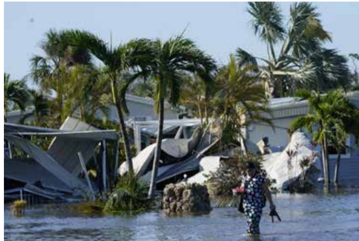
Holly Nugyn walks out of her flooded neighbourhood after Hurricane Ian passed by the area

Charleston, could also experience up to eight inches of rain.