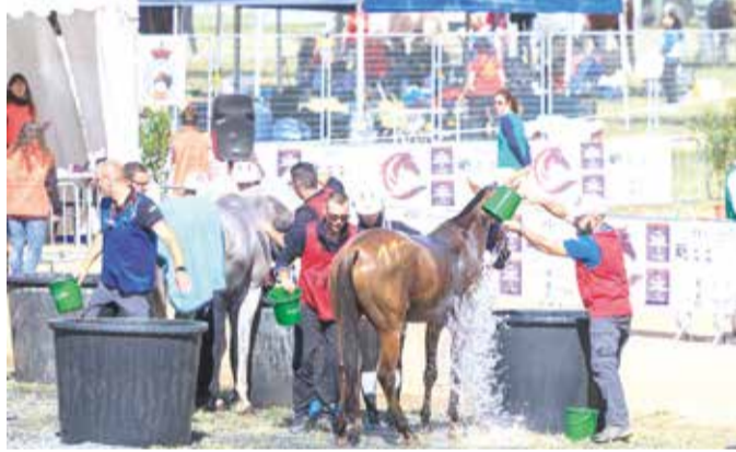
Horses are bather after training

has decided a set of objectives for taking part in this event. His Highness' vision focuses on supporting young riders through allowing them to participate in top races in order to be ready to carry Bahrain's flag in the endurance races in the future."