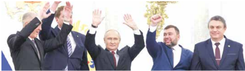
Russian President Vladimir Putin and Denis Pushilin, Leonid Pasechnik, Vladimir Saldo, Yevgeny Balitsky, who are the Russian-installed leaders in Ukraine's Donetsk, Luhansk, Kherson and Zaporizhzhia regions, attend a ceremony to declare the annexation of the Russian-controlled territories of four Ukraine's Donetsk, Luhansk, Kherson and Zaporizhzhia regions

It comes as Russian forces in one of the four regions being annexed face being encircled by Ukrainian troops after Putin ordered a massive mobilisation drive to get hundreds of thousands of Russian men to the front.