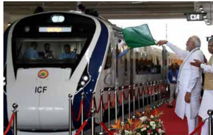
Narendra Modi flags off new Vande Bharat Express

Prime Minister Narendra Modi yesterday launched a third Indian-made high speed train in his home state of Gujarat, as a part of plans to modernise the country's rail network. New Delhi plans to launch 75 of the Vande Bharat Express trains by August 2023 to connect all major industrial and business cities. The trains have a top speed of 160 kilometres per hour (99 miles per hour).