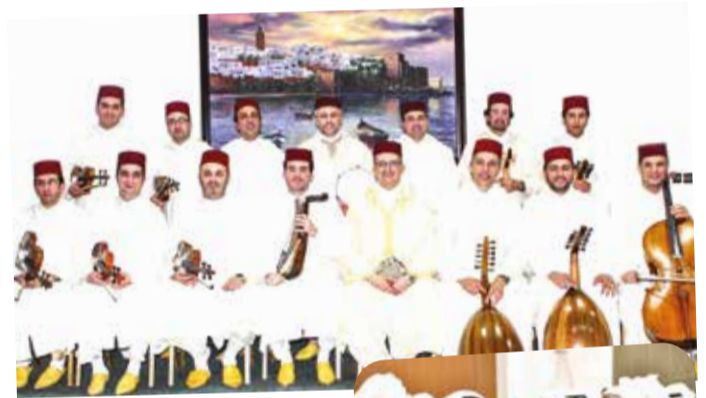
Rabat Troupe for Instrumental Music