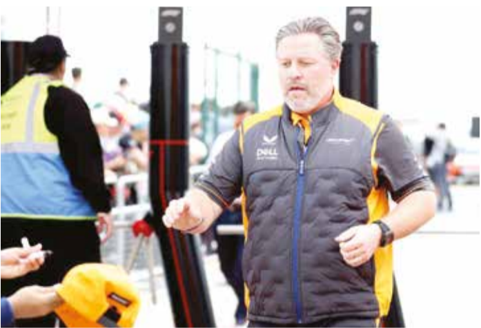
McLaren CEO Zak Brown before a race (file photo)

The sport, which will have three US races next year, including a new night-time grand prix