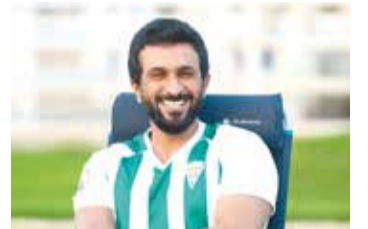
HH Shaikh Nasser bin Hamad Al Khalifa