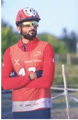
HH Shaikh Nasser bin Hamad Al Khalifa