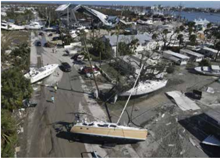
Boats lie scattered amidst mobile homes after the passage of Hurricane Ian, on San Carlos Island, in Fort Myers Beach

Death toll rises to 21 as South Carolina prepares for landfall