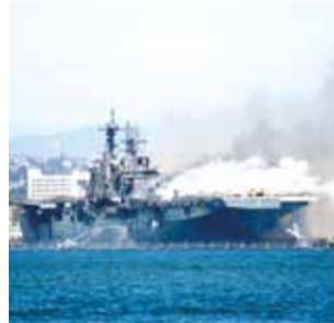
Port of San Diego Harbor Police Department boats combat a fire on board the U.S. Navy amphibious assault ship USS Bonhomme Richard at Naval Base San Diego, California