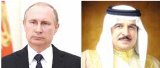
talks over the telephone

His Majesty King Hamad bin Isa Al Khalifa urged Russian President Vladimir Putin to activate channels of dialogue, negotiations and peaceful solutions to reach peace and development for all during