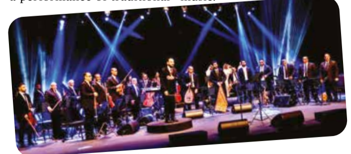
Bahrain Music Band

On Thursday, Taiko Ensemble "Wagaku*Miyabi" will give a performance of traditional Japanese drum performance.