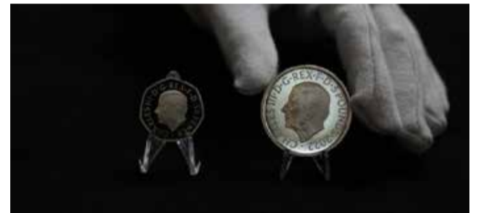
Two new coins bearing official coinage portrait of King Charles III, on the left is the new 50 pence coin, and right is the new 5 pound commemorative coin, which will be among the first coins to bear the new king's head