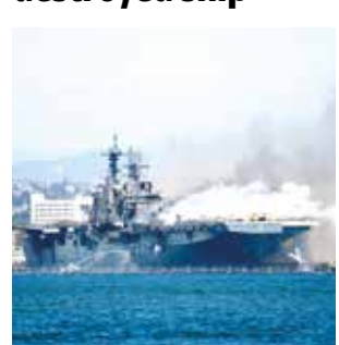
Port of San Diego Harbor Police Department boats combat a fire on board the U.S. Navy amphibious assault ship USS Bonhomme Richard at Naval Base San Diego, California