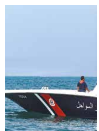
TDT | Manama

Toast Guard patrols yesterday managed to bring back safely a boat that went out of control after its Captain fell overboard, losing control, in rough seas.