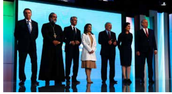
Presidential candidates Luiz Felipe D'Avila of the New Party (Novo), Luiz Inacio Lula da Silva of the Workers Party (PT), Simone Tebet of the Brazilian Democratic Movement (MDB), President Jair Bolsonaro of the Liberal Party (PL), Soraya Thronicke of Brazil Union (Uniao Brasil), Ciro Gomes of the Democratic Labor Party (PDT) and Padre Kelson (PTB) attend a Presidential Debate ahead of the national election, in Rio de Janeiro, Brazil

Brazil's main presidential candidates traded accusations of corruption in their last debate before Sunday's election, with little discussion of proposals to govern the South American country. Incumbent far-right President Jair Bolsonaro called his leftist rival, former president Luiz Inacio Lula da Silva, the boss of a criminal gang that ran a "kleptocracy" during his two-term presidency from 2003 to 2010. Lula, who has a comfortable double-digit lead going into the first round of voting, called Bolsonaro a "shameless" liar whose government had covered up graft in the purchase of vaccines during the COVID-19 pandemic that killed more than 680,000 Brazilians. Centrist candidate Simone Tebet, of the Brazilian Democratic Movement party (MDB) scolded both men for exchanging personal attacks instead of focusing on proposals to solve