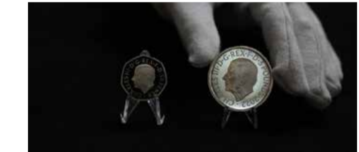
Two new coins bearing official coinage portrait of King Charles III, on the left is the new 50 pence coin, and right is the new 5 pound commemorative coin, which will be among the first coins to bear the new king's head