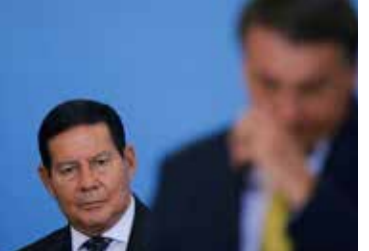
Brazil's Vice President Hamilton Mourao looks on next to Brazil's President Jair Bolsonaro

ident, Satur- -right allow- ent to year's a New