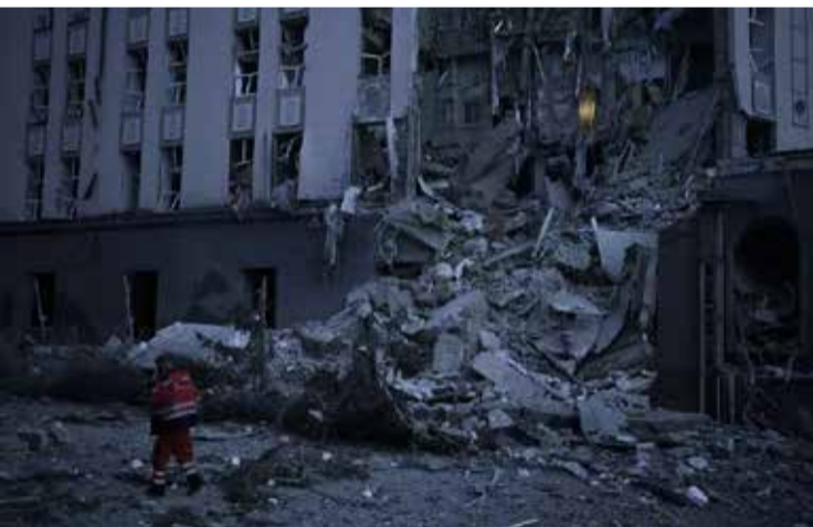
An emergency worker walks in front of a damaged hotel following a Russian attack

of the ook a owned words ian. eed to e and eputy ymyr e peo- thern more, jured