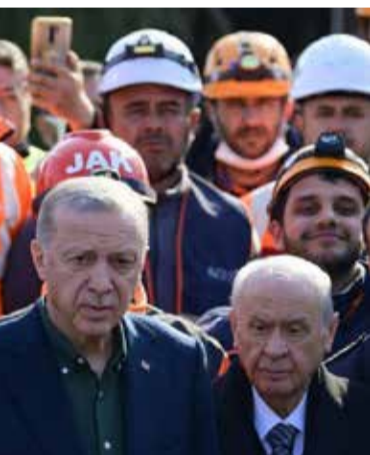
Rescue workers with rescue workers as he visits the site (file photo)

There were shortcomings, disruptions and delays but we... rushed to help earthquake survivors with all our might. We are not hiding behind excuses