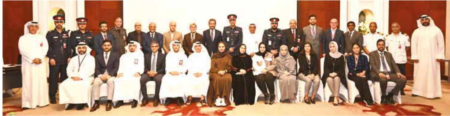
The BAC Airport Facilitation Committee officers and members

They discussed a range of topics, including BIA's performance figures for the year, which saw aircraft traffic movements surge from 51,000, in 2021 to 82,000, just 15% short of 2019, and cargo tonnage increase from 324,000