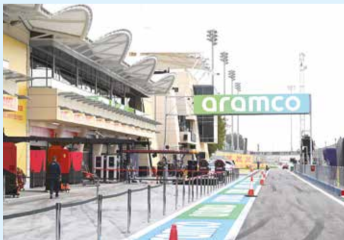
The F1 pit lane at BIC

The pit lane walk is one of the most popular activities of the race weekend each year,