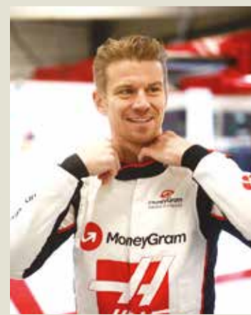
Nico Hulkenberg in the Haas garage at the Bahrain tests ahead of the new championship

"I know it will take a bit of time to get totally comfortable with the team and the car, but right now, I'm definitely confident that we can have a strong race here in Bahrain and the target is to come away with