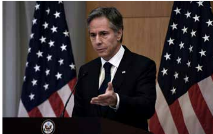
US Secretary of State Antony Blinken speaks during a press conference

Lavrov arrived late Tuesday in India -- which has not condemned the war -- and will use