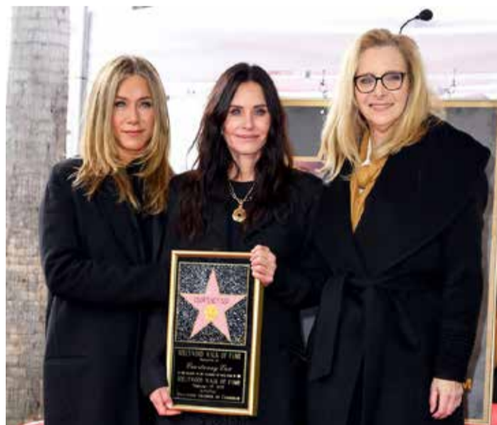
Jennifer Aniston, Courteney Cox, and Lisa Kudrow pose for a photo with Cox's newly unveiled Hollywood Walk of Fame star

She added: "To be friends with Courteney is to be family