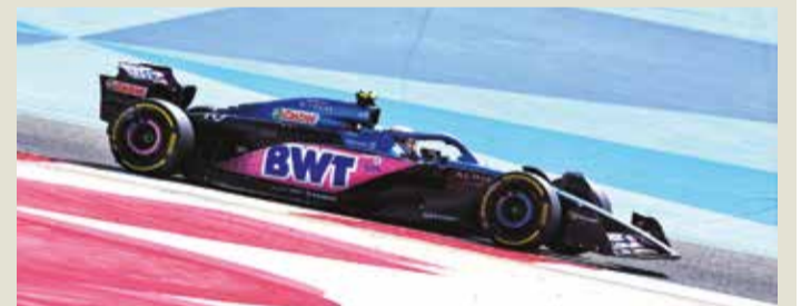
Pierre Gasly in his Alpine contender during F1 pre-season testing at BIC last week

I'm definitely confident that we can have a strong race here in Bahrain and the target is to come away with some points in the bag and begin the season in the best way possible