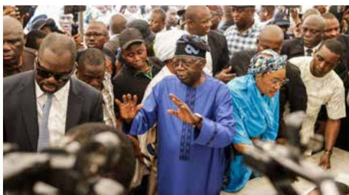
All Progressives Congress presidential candidate Bola Tinubu (C-L) and his wife Oluremi Tinubu (C-R) arrive to vote at a polling station in Lagos (file photo)

gressives Congress (APC) party, won 8.8 million votes against 6.9 million for opposition Peoples