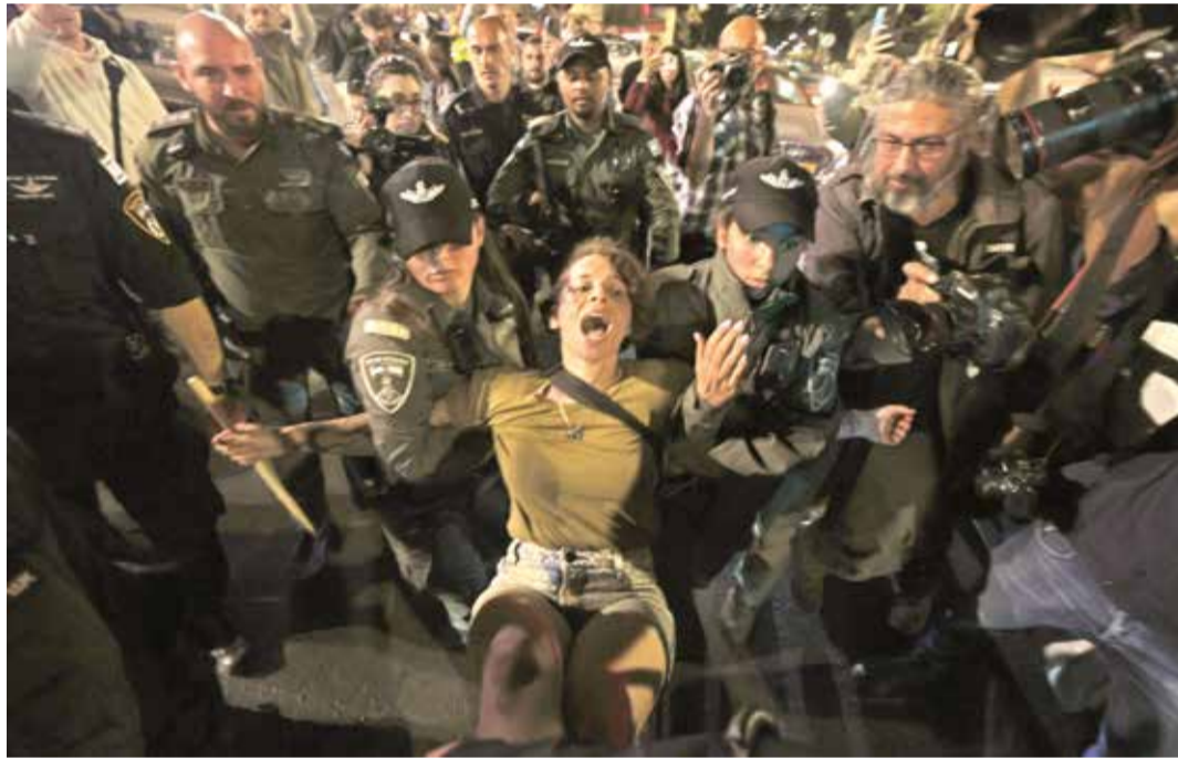
Israeli security forces detain a protester during a demonstration yesterday.

"A sovereign country cannot tolerate anarchy," added Netanyahu, who returned to power late last year at the head of a