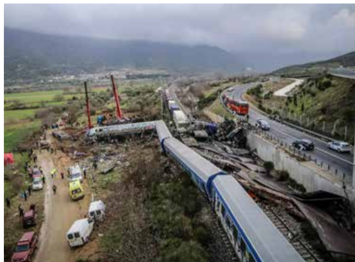
Police and emergency crews search the debris of a crushed wagon after a train accident in the Tempi Valley near Larissa, Greece

Transport minister resigns after train crash kills at least 36 near central city of Larissa