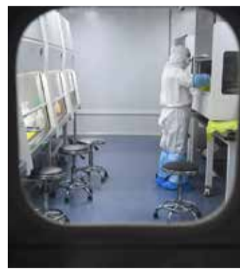
A laboratory technician processes samples from people to be tested for coronavirus in Wuhan, China (file photo)

Wray's comments come after a report earlier this week said the US Department of Energy had determined that a leak from a Chinese lab was the most likely cause of the Covid-19 outbreak.