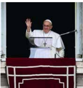
Pope Francis waves from the window of the apostolic palace

The decision was taken "to meet the growing commitments" of the Catholic Church "in an economic context of particular gravity, such as the current one", according to a papal note cited by the Vatican's official news outlet.