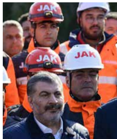
Turkish President Recep Tayyip Erdogan stands with other officials in the hard-hit southeastern province of Hatay (file photo)

President Recep Tayyip Erdogan yesterday ruled out any delay in elections after the devastating quake that killed tens of thousands in Turkey, saying the vote would push ahead on May 14 as planned.