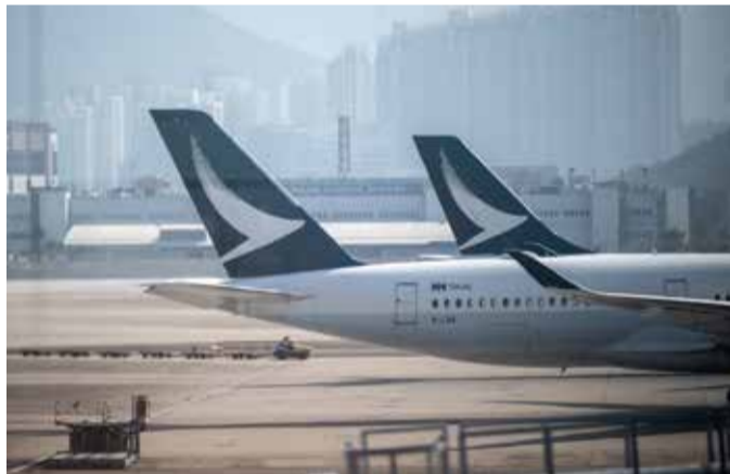
Cathay Pacific airplanes are pictured at the Hong Kong International Airport AFP | Hong Kong

People hoping to take advantage of a Hong Kong scheme to give away half a million free airline tickets faced hours-long online queues yesterday, as the Asian financial hub bids to woo tourists back.