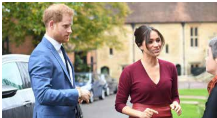
Britain's Prince Harry, Duke of Sussex and Meghan, Duchess of Sussex arrive to attend a roundtable discussion at Windsor Castle (file photo)

Harry and Meghan, also known as the Duke and Duchess of Sussex, were reportedly told to vacate the property in January just days after the pub-