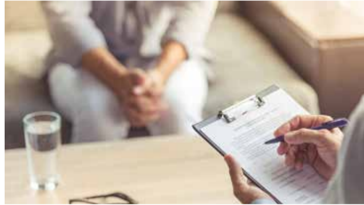
The employees beg their employers for their hard-earned money, but they have not received it yet until now (Image used for illustrative purposes only)

Luckily, the first victim in this story said that he had already left the country, as he was worried of what was to come, signing a final settlement slip by the CEO, assuring him he will be paid the sum of money he is owed by the company. However,