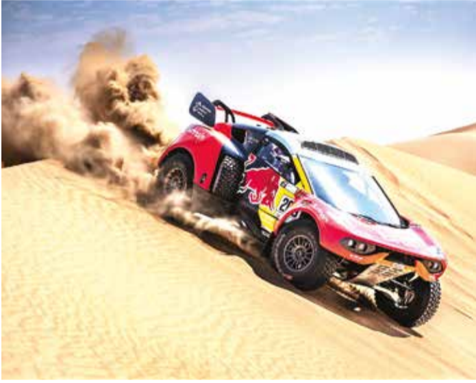
Sebastien Loeb and Fabian Lurquin in their Bahrain Raid Xtreme Prodrive Hunter

Loeb and co-driver Fabian Lurquin in the Bahrain Raid Xtreme Prodrive Hunter were second fastest on the day to Al Attiyah, who finished the 266 km third stage with the rear bodywork, roof and windscreen