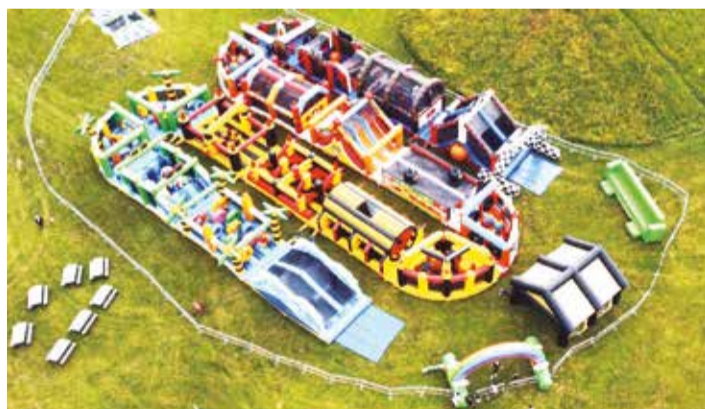
The Beast is for all ages

House will be putting in a scare to anyone brave enough to step in. They will be met by all kinds