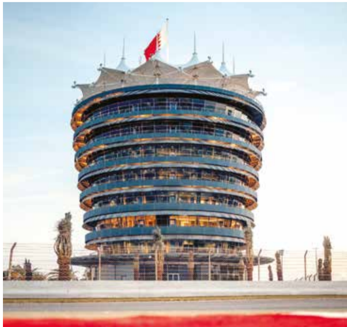
The BIC stage is set for this weekend's events

F1 boasts 20 of the world's biggest motor racing superstars, while there will be 22 competing in the FIA Formula 2 Championship, 29 in the FIA Formula 3