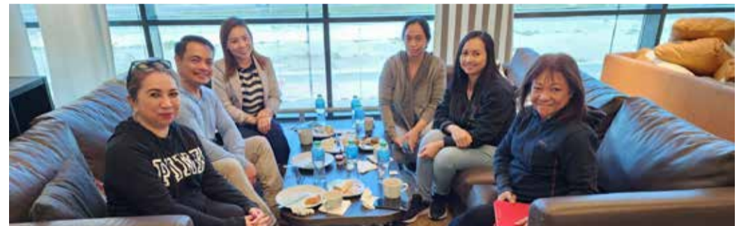
Filipino artists and writers TDT | Manama

The Filipino Creatives Bahrain art group teams up with the Filipino Writers Circle for this year's art and cultural exhibition.