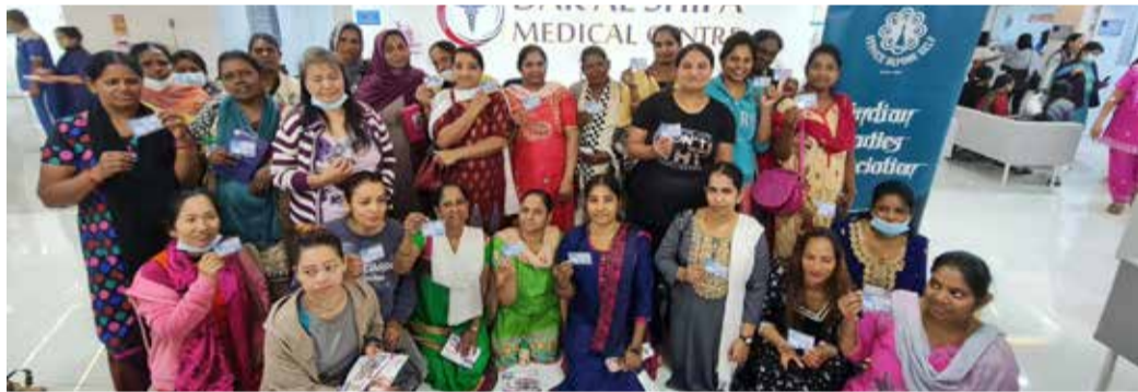
Event organisers and supporters with women workers at the event