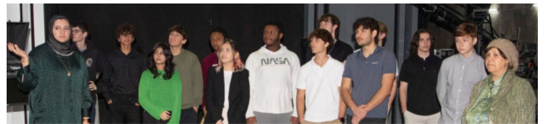
The students being briefed about live-broadcasting