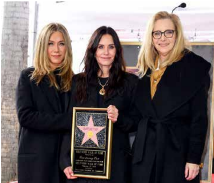
Jennifer Aniston, Courteney Cox, and Lisa Kudrow pose for a photo with Cox's newly unveiled Hollywood Walk of Fame star

She added: "To be friends with Courteney is to be family