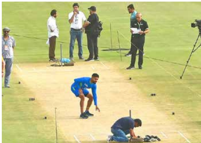
Pakistan's captain Babar Azam (C) inspects the pitch during a training session on the eve of their Asia Cup cricket match against Nepal at the Multan Cricket Stadium in Multan (file photo)