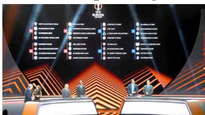
A screen displays the fixtures for the group stages of the UEFA Europa League after the draw

The Anfield club are appearing in the Europa League for the first time since 2015/16, when