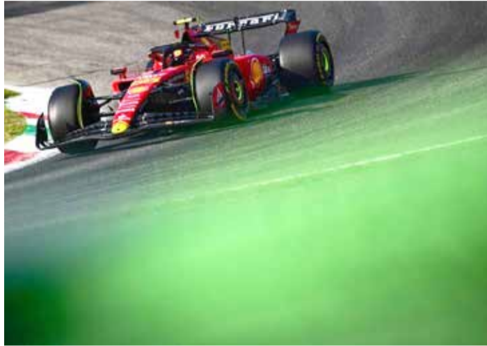
Ferrari's Spanish driver Carlos Sainz Jr drives during the second practice session

Sainz finished just 0.19sec ahead of Aston Martin driver Lance Stroll to give the Scuderia hope of a good weekend on home turf after another troubled season which has left them miles behind dominant Red Bull. Sainz trails reigning cham-