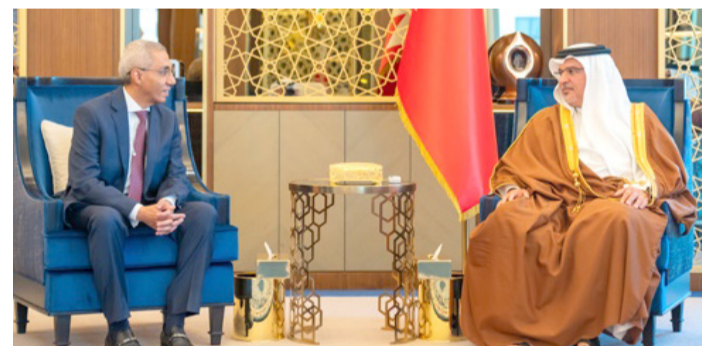
HRH Prince Salman with the outgoing Egyptian ambassador

His Highness Shaikh Mohammed bin Salman bin Hamad Al Khalifa, and the Minister of