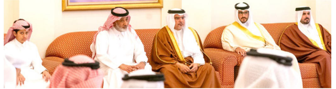
HRH Prince Salman with the family of First Lieutenant Al Kubaisi, in the presence of senior government officials