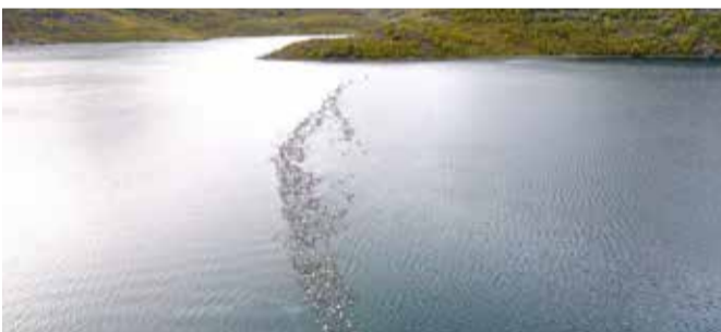
Several hundred reindeer swim across Jokelfjord, on route to their winter pastures in Northern Norway