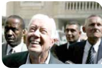
Former US president Jimmy Carter turns 99

◆ Jimmy Carter, the longest-living US president, turned 99 yesterday, defying the odds seven months after entering hospice care to notch another birthday. World leaders, celebrities and everyday people sent wishes to the almost-centenarian, while the White House displayed a giant wooden cake on its lawn with 39 candles for the 39th president. "I admire you because you have such incredible integrity, character and determination," US President Joe Biden said in a video message posted on X, formerly Twitter. "God love you, happy birthday pal."