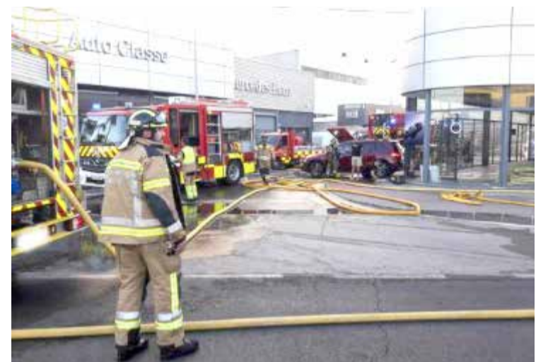
Firefighters getting ready near the Teatre nightclub