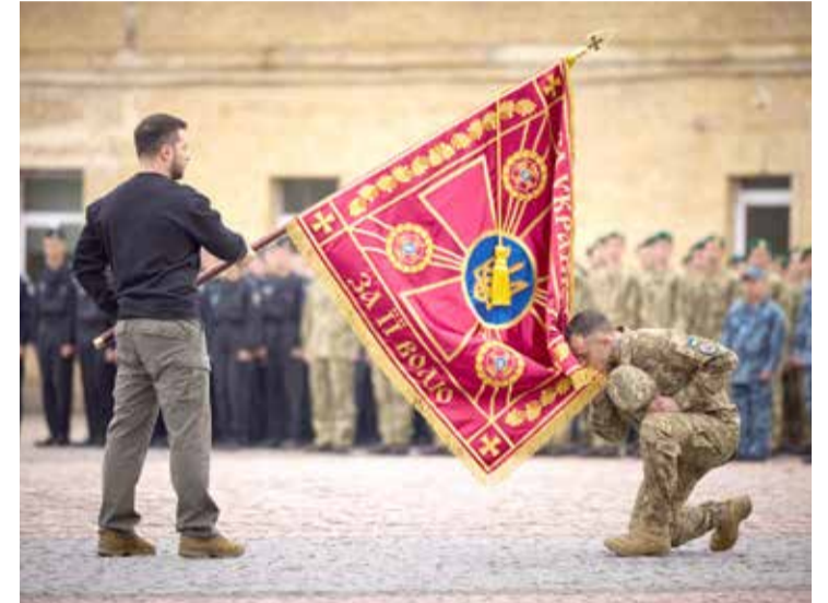
Ukrainian President Volodymyr Zelensky (L) holds a flag of the Ukrainian armed forces as a Ukrainian serviceman pays his respects for Ukraine during a ceremony marking Defenders Day of Ukraine in Kyiv.

"The Ukrainian government is now actively working with its American partners to ensure that the new US budget decision, which will be developed over the next 45 days, includes new funds