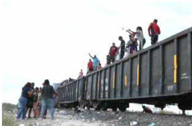
Migrant people, mostly from Venezuela, remain stranded after the goods train they were travelling on to Ciudad Juarez stopped in the desert in the municipality of Ahumada, Chihuahua state