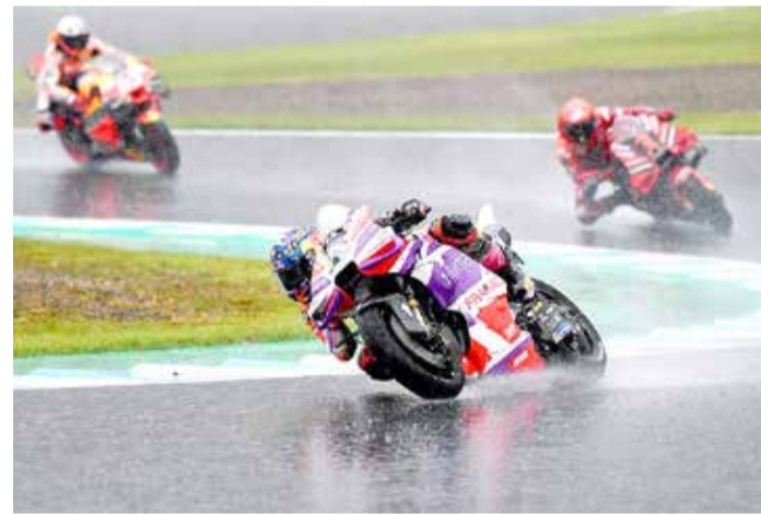
Prima Pramac Racing rider Jorge Martin of Spain (C) leads Ducati Lenovo Team rider Francesco Bagnaia of Italy (R) and Repsol Honda Team rider Marc Marquez of Spain (L) during rain fallen MotoGP Japanese Grand Prix

but the red flags quickly came out again and the riders were awarded full points according to their positions at the stoppage.