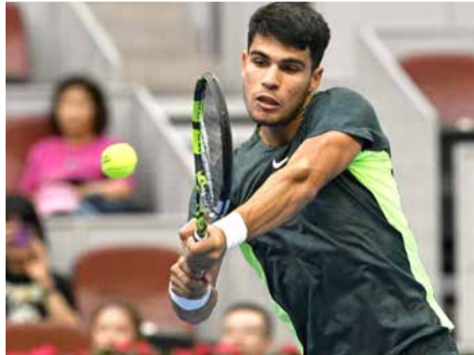
Spain's Carlos Alcaraz hits a return against Italy's Lorenzo Musetti