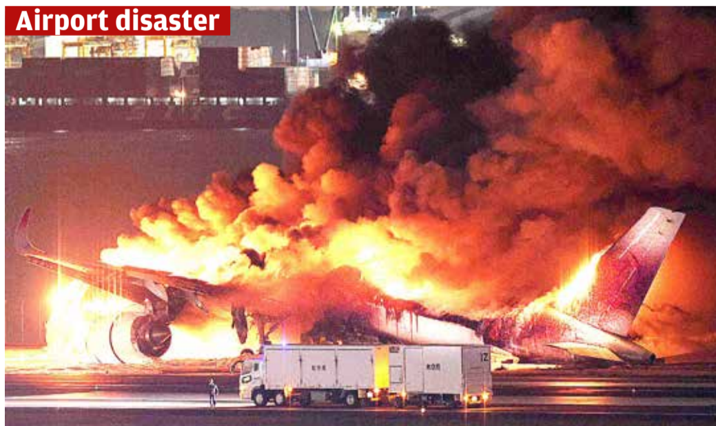
A Japan Airlines plane in flames on the runway of Tokyo's Haneda Airport yesterday, after colliding with a coast guard aircraft, killing five.