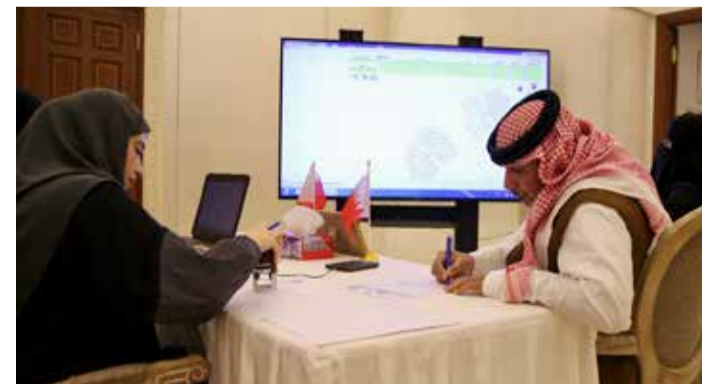
Ministry officials assist a citizen in the housing distribution process

Citizens have commended the seamless flow of procedures. They were given detailed explanations by specialised staff about the housing units, re-