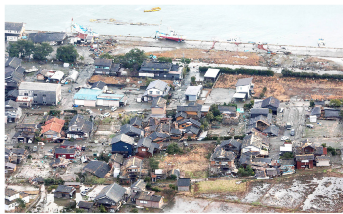
damage in the city of Suzu, Ishikawa prefecture

be etched into my memory forever", she told AFP after what she called the long and violent earthquake on Monday.