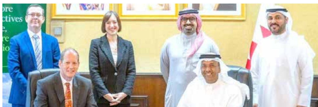
Officials at the signing

The LMRA renewed its call on all members of society to support the efforts of government agencies in addressing illegal labour practices, by reporting violations via the electronic form on the authority's website lmra.gov.bh , or by calling the LMRA call centre on 17506055 or via the government's Suggestions and Complaints System (Tawasul).