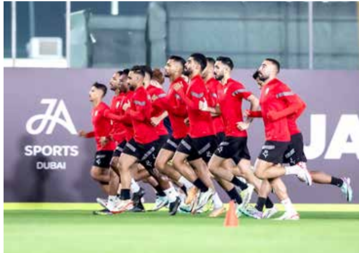
Bahrain's players participate in warm-up drills

Bahrain head coach Juan Antonio Pizzi is making his second appearance in the AFC Asian Cup. Pizzi previously managed Saudi Arabia in the tournament's 2019 edition, when they were eliminated by Japan in the Round of 16