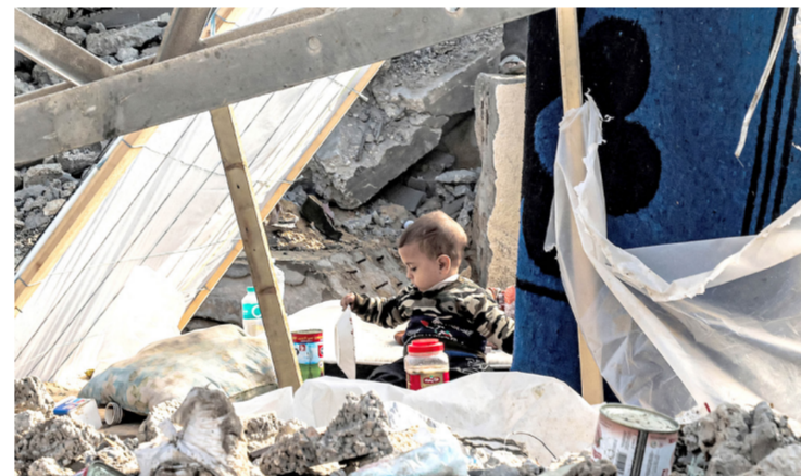
A child holds a plate while sitting between rubble in Rafah in the southern Gaza Strip

Expelling civilians during a conflict or creating unlivable conditions which force them to leave