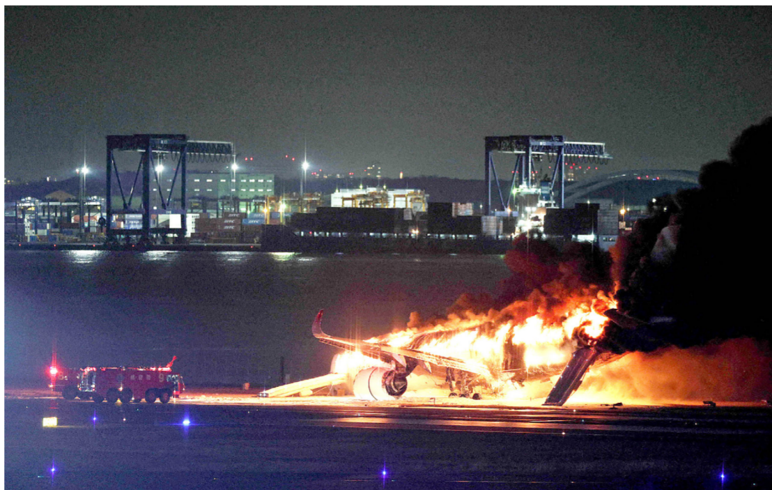
A Japan Airlines plane on fire on a runway of Tokyo's Haneda Airport

Television and unverified footage shared on social media showed the Japan Airlines (JAL)