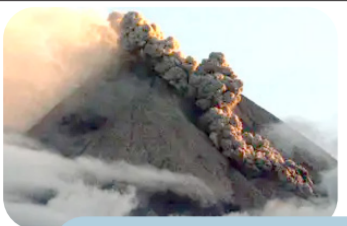
Thousands evacuated following Indonesia volcano eruption

◆ More than 2,000 residents have been evacuated to temporary shelters amid heightened volcanic activities in a volcano in eastern Indonesia, a local official said yesterday. Mount Lewotobi Laki-Laki in East Nusa Tenggara province has erupted several times in recent weeks, including an eruption on Monday that spewed volcanic ash 1.5 kilometres (4,800 feet) above its peak, according to the Center for Volcanology and Geological Hazard Mitigation (PVMBG). The agency recorded another eruption from Lewotobi Laki-Laki on Tuesday but ash clouds from the volcano were not observed, it said in a statement. Volcanic ashes from recent eruptions have affected two sub-districts near Lewotobi Laki-Laki mountain, prompting more than 2,200 residents to evacuate to temporary shelters set up by local governments. Benediktus Bolibapa Herin, an official for East Flores district, told AFP on Tuesday.