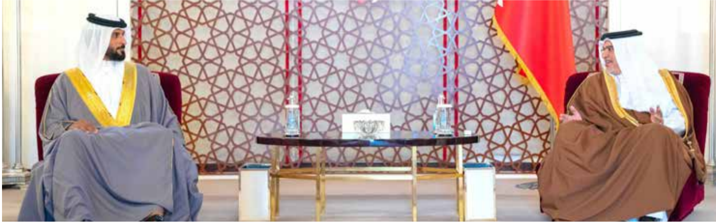
HRH the Crown Prince and Prime Minister with HH Shaikh Nasser bin Hamad Al Khalifa during yesterday's meeting

The Kingdom of Bahrain is witnessing unprecedented development across numerous sectors, thanks to the effort and determination of Team Bahrain. This was highlighted yesterday by His Royal Highness Prince Salman bin Hamad Al Khalifa, the Crown Prince and Prime Minister, as he met with sponsors of the Celebrate Bah-