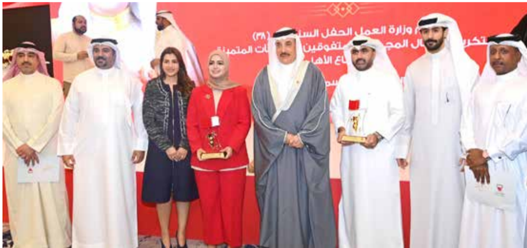
The award ceremony

to their unwavering commitment to excellence, recognises their outstanding contribution to the banking industry, and their leadership qualities and exemplary commitment to fostering a positive collaborative work environment for over 20 years.