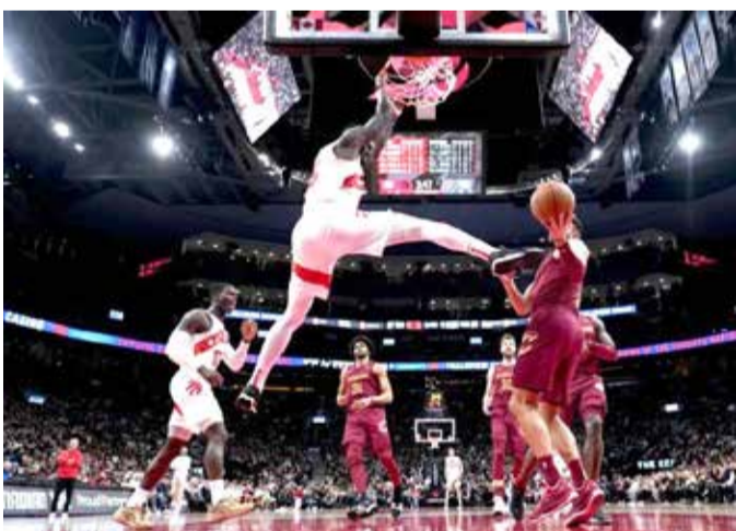
Cameroonian playmaker Pascal Siakam of the Toronto Raptors dunks against the Cleveland Cavaliers