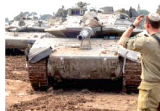
An Israeli soldier gestures for a battle tank to approach

The push for a probe followed the announcement by