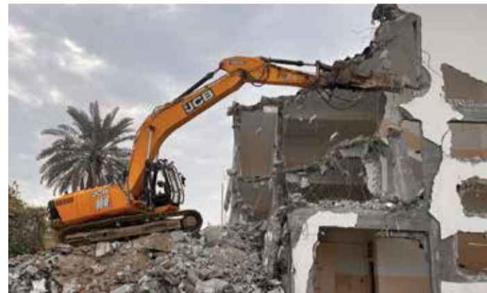
A building being bulldozed

of Works, Municipalities, the Ministry of Housing and Urban Planning, the Survey and Land Registration Bureau, and other related bodies.