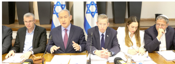
Israeli Prime Minister Benjamin Netanyahu (2ndL) chairs a Cabinet meeting, attended by National Security Minister Itamar Ben Gvir (2ndR), at the Kirya, which houses the Israeli Ministry of Defence, in Tel Aviv

Turkey announced yesterday it had detained 33 people suspected of planning abductions and spying on behalf of Israel's Mossad intelligence service. Interior Minister Ali Yerlikaya