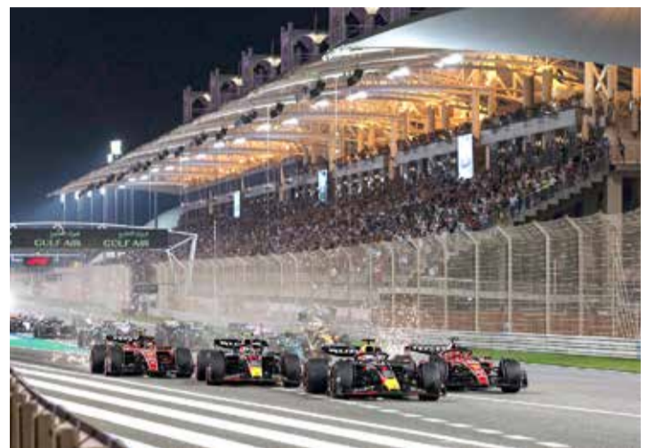
Action at the start of last year's Bahrain Grand Prix at BIC (File photo)

The ultimate winner, meanwhile, will receive a money-