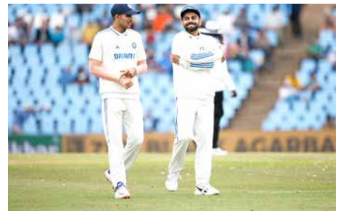
India's Virat Kohli (R) speaks to India's Shubman Gill (L)