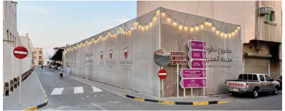
A location that is part of the development project