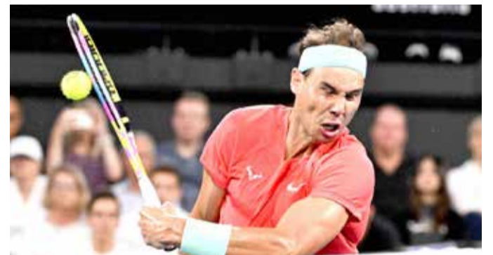
Spain's Rafael Nadal reacts after he got hit in the head by the ball