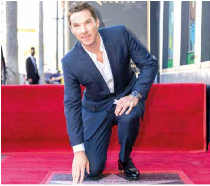
Benedict Cumberbatch during the Hollywood Walk of Fame ceremony