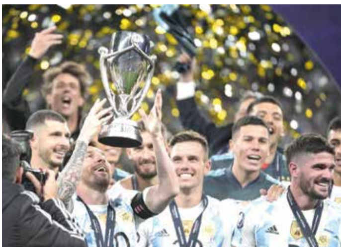
Argentina's Lionel Messi tosses a trophy as he celebrates with his teammates

Argentina were already established as one of the leading contenders to win the World