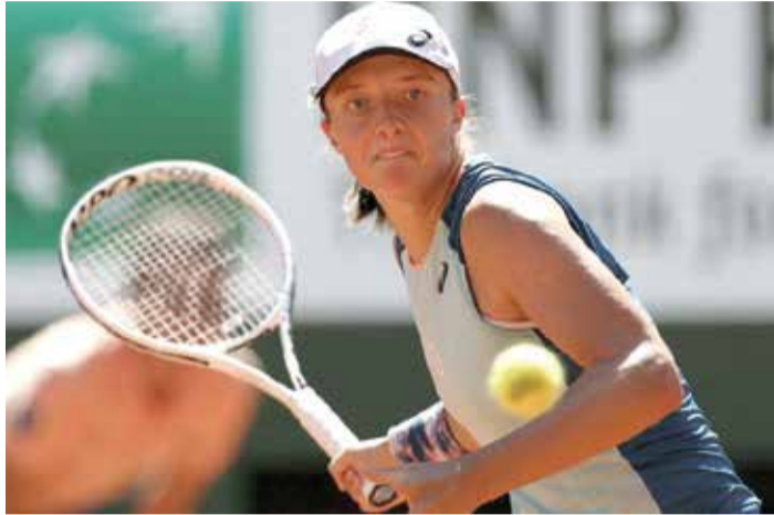
Poland's Iga Swiatek plays a shot against Russia's Daria Kasatkina

"I'm so grateful. It's easier to play matches with this kind of support," Swiatek, who won 10 of the last 11 games, said in her on-court interview.