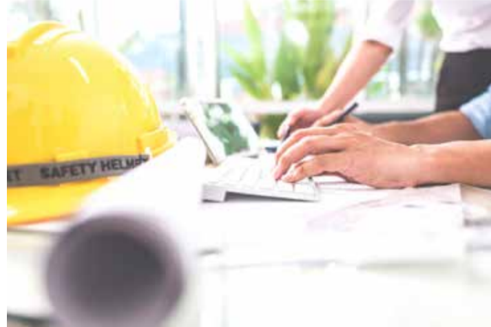
The new upgraded online system elevates the construction standards

- H.E. ENG. WAEL BIN NASSER AL MUBARAK, THE MINISTER OF MUNICIPALITIES AFFAIRS AND AGRICULTURE