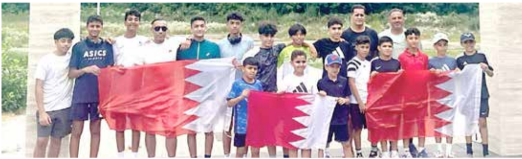
Bahraini's tennis players after the event

This participation marked a significant milestone with 16 Bahraini players competing in