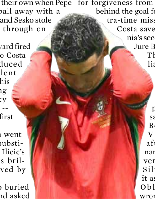
Cristiano Ronaldo reacts after failing to score a penalty

for forgiveness from the fans behind the goal for his extra-time miss, before Costa saved Slovenia's second from Jure Balkovec. The brilliant Costa made a third consecutive penalty save from Benjamin Verbic after Fernandes converted and Silva won it as he sent Oblak the wrong way.