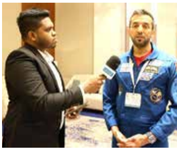
Dr. Sultan Al Neyadi in an interview with The Daily Tribune

His enthusiasm was contagious, even hinting at the IAF's interest in bringing the prestigious International Astronaut-