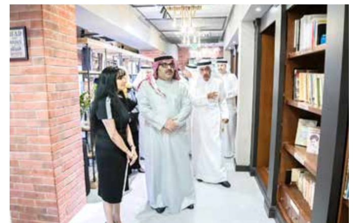
H.E. Dr. Mohammed bin Mubarak Juma tours the library