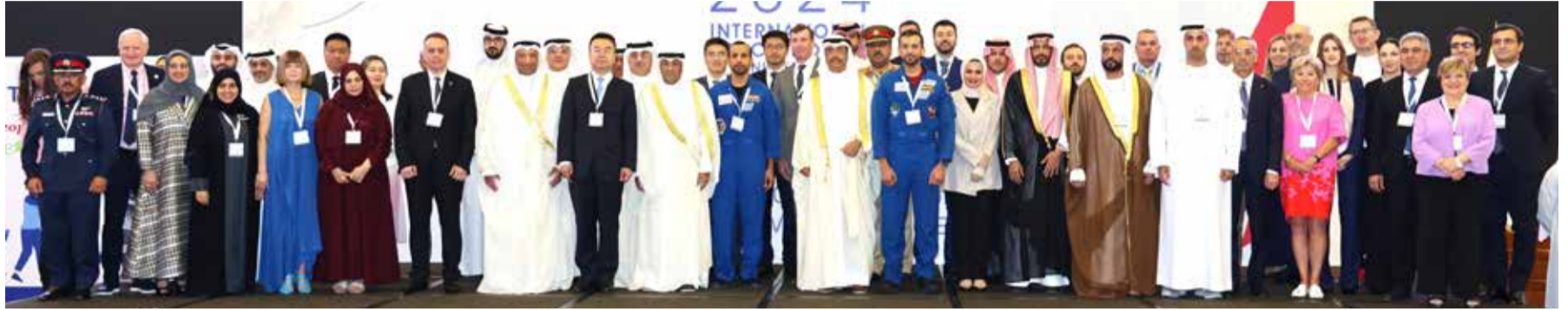
Participants at the 6th International Space Forum

scored the importance of space exploration and the development of technologies to sustain life on our precious planet.