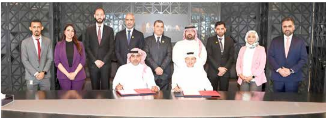
Officials following the deal signing

Key among the deliverables is the installation of a customized In-Building Solution (IBS) by Batelco, designed to strengthen wireless signal quality and cov-