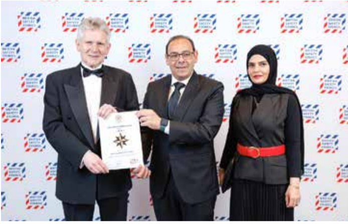
The award ceremony

Recognising Alba's exceptional Safety record over the past year, the award was presented during the BSC's International