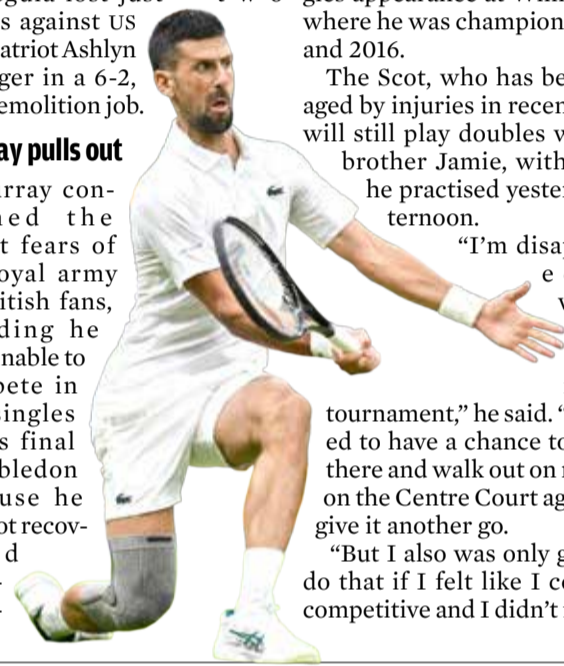
Novak Djokovic in action

Murray confirmed the worst fears of his loyal army of British fans, deciding he was unable to compete in the singles at his final Wimbledon because he has not recovered sufficiently from recent back surgery.