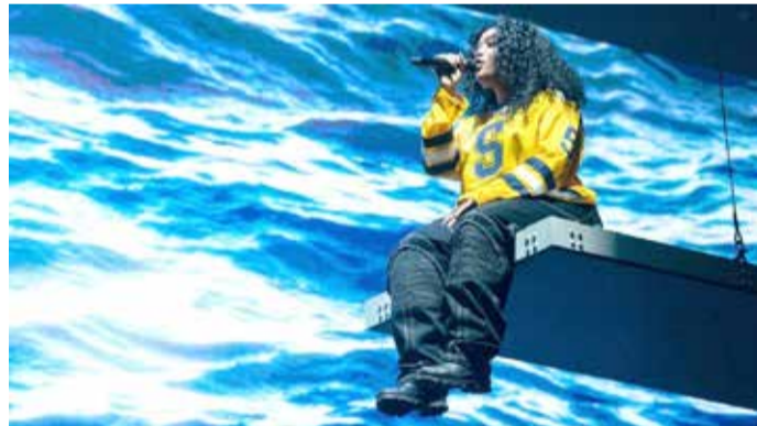
American singer SZA

The online response was marked by disappointment as many fans were unable to se-