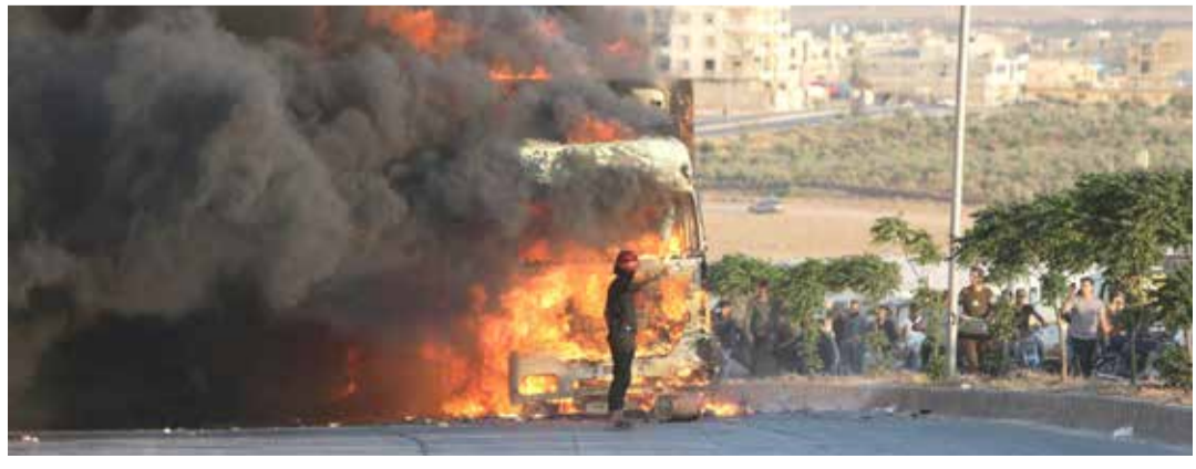
A protestor stands in front a burning Turkish truck during protests against Turkey in al-Bab, in the northern Syrian opposition held region of Aleppo.

Turkish authorities said yesterday they had detained over 470 people after anti-Syrian riots in several cities sparked by accusations that a Syrian man had harassed a child. Tensions escalated from Sunday following violence in a central Anatolian city after a mob went on the rampage, damaging businesses and properties belonging to the Syrians. "474 people were detained after the provocative actions" carried out against Syrians in