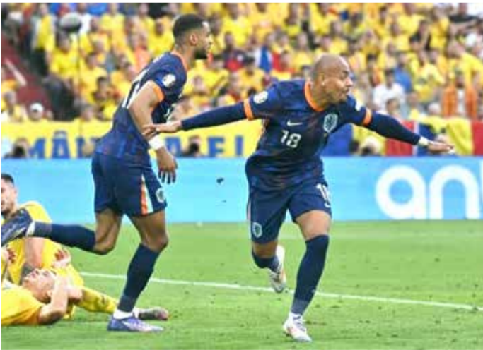
Netherlands forward Donyell Malen celebrates scoring

The Netherlands swept into their first European Championship quarter-final since 2008 as Donyell Malen scored twice in a 3-0 win over Romania in the last 16 yesterday. Cody Gakpo gave the Dutch an early lead but they were unable to convert pressure into a crucial second goal until the Liverpool forward set up Malen with seven minutes remaining in Munich. Romania were gritty but outclassed, lacking the quality to punish their opponents' profligacy before Malen added his second on the counter in stoppage-time. The victory put the Oranje on course for a quarter-final clash