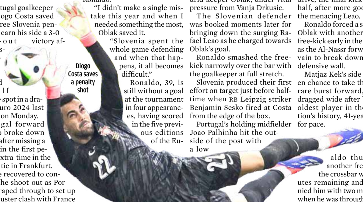
Diogo Costa saves a penalty shot