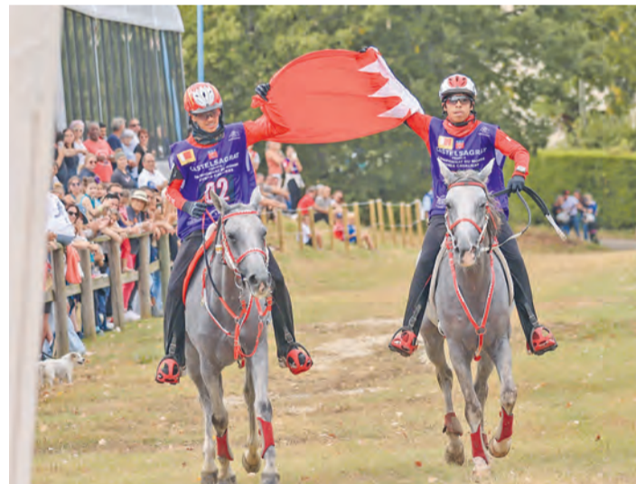
Two of the Royal Endurance Team's riders fly the Kingdom's flag as they cross the finish line

His Majesty the King's Representative for Humanitarian Work and Youth Affairs and Royal Endurance Team Captain, HH Shaikh Nasser bin Hamad Al Khalifa, congratulated His Majesty King Hamad bin Isa Al Khalifa and His Royal Highness