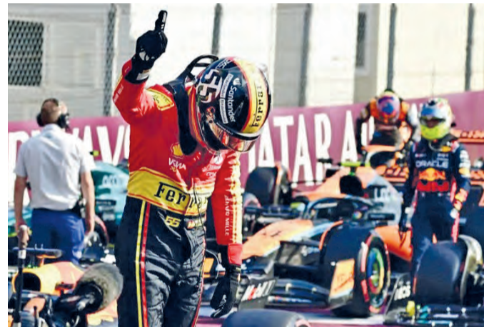
Carlos Sainz gestures after securing pole position

Carlos Sainz is gunning to end dominant Max Verstappen's record run of Formula One wins after delighting Ferrari's passionate army of home fans yesterday by claiming pole position for the Italian Grand Prix. Spaniard Sainz will start at the front of the grid for the first time this season after pipping by 0.013 seconds reigning world champion Verstappen who is hunting a historic 10th straight victory.