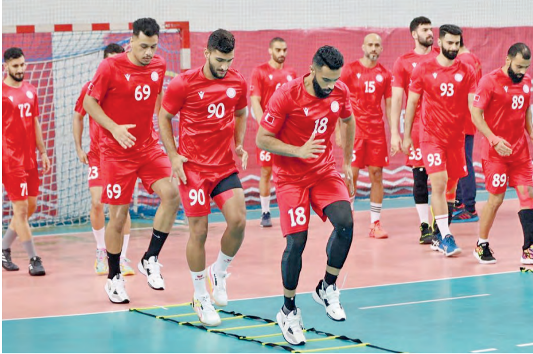
Bahrain players during a local training session