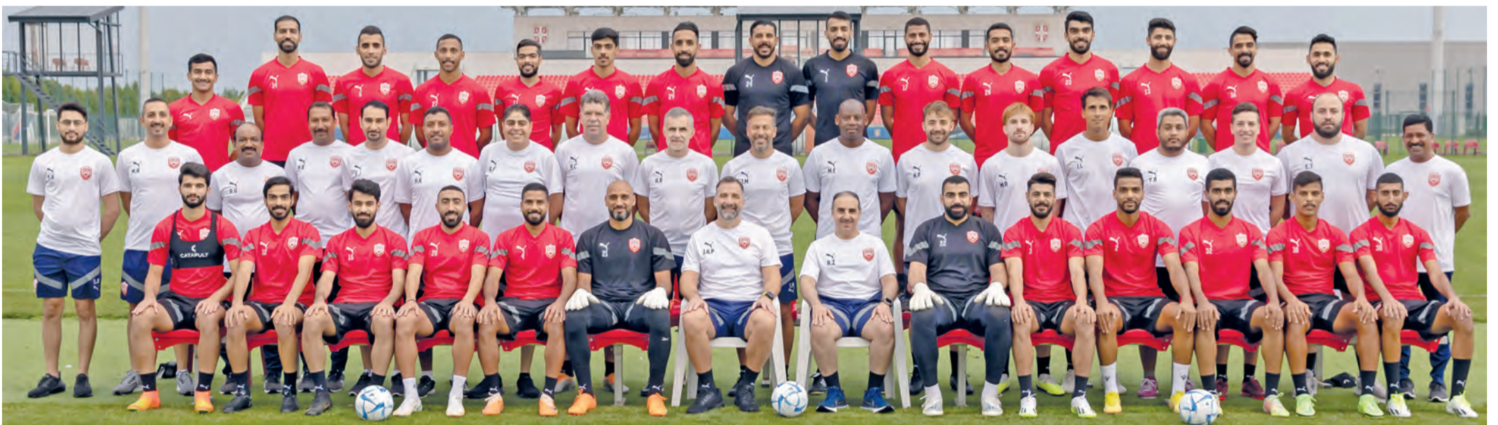
Bahrain's senior men's national football team players and staff on the final day of their overseas training camp in Serbia

Kingdom's senior men's national football team wrap up Serbia training camp, fly to Dubai for tune-up games