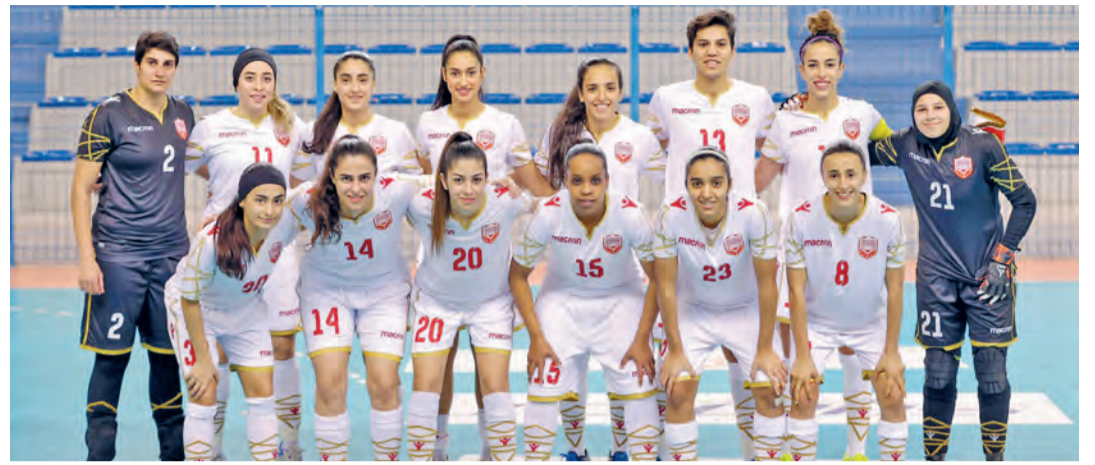
Bahrain's women's national futsal team

● Bahrainis set to compete in six-nation NSDF Women's Futsal Championship 2023