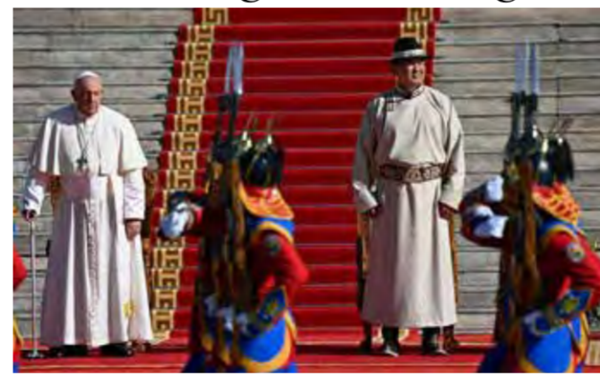
Mongolian President Ukhnaa Khurelsukh (R) receives Pope Francis during a welcome ceremony at Sukhbaatar Square in Ulaanbaatar

Pope Francis appeared to seek to reassure China yesterday, using a gathering of Catholic missionaries in Mongolia to state that governments had "nothing to fear" from the Catholic Church. The comments came during the first papal visit to the young democracy sandwiched between China and Russia, where the 86-year-old pontiff has hoped not only to encourage the tiny Catholic community but also use his presence at China's backdoor to try to improve the Vatican's relations with Beijing. "Governments and secular institutions have nothing to fear from the Church's work of evangelisation, for she has no political agenda to advance" POPE FRANCIS "mercy and truth...is meant to promote the good of all," he said. In visiting the landlocked nation of Mongolia, a former Soviet satellite state that has been a democracy since 1992, the Argentine Jesuit has had one eye on geopolitics, even as the visit fulfils his desire to reach out to remote, largely ignored areas far from Rome. Beijing's Communist Party is wary of the Catholic Church on its territory, and exercises strict control over all recognised religious institutions.