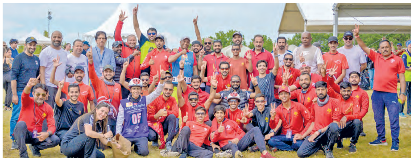
Royal Endurance Team members and officials celebrate their victory

Apart from the Kingdom of Bahrain, Saudi Arabia, the UAE, Qatar, Tunisia, Argentina, Australia, Belgium, Brazil, China, Finland, Germany, Hungary, India, Italy, Mauritania, Malaysia, Poland, the Netherlands, Norway, Indonesia, Portugal, Spain, Sweden, the USA, and France also took part in the race.