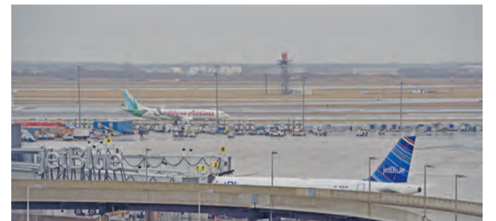
A Jet Blue aircraft is parked at a gate while other gates remain empty at Kennedy International Airport