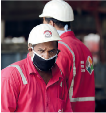
Expatriate workers at a factory in Salmabad village south of Manama

Bahrain has cemented its position yet again as the premier destination for expatriates in the Middle East with