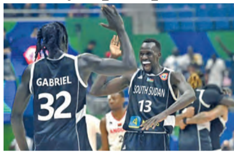
South Sudan players celebrate a point

to another since winning independence in 2011 but the team's World Cup performances have captured the public's imagination, with crowds gathering to watch on giant screens in the capital Juba.