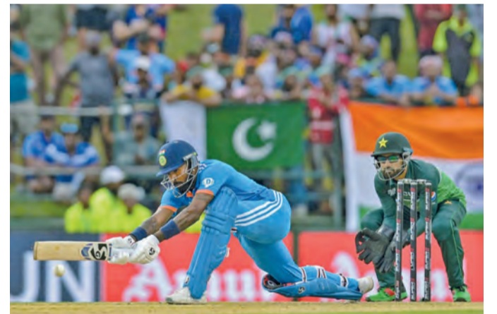
India's Hardik Pandya (L) plays a shot