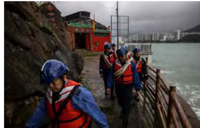
Volunteer workers evaluated the damage done to a low-lying fishing village after Typhoon Saola moved away from Hong Kong

Typhoon Saola swept across southern China yesterday after tearing down trees and smashing windows in Hong Kong, although the megacity avoided a feared direct hit from one of the region's strongest storms in decades. Tens of millions of people in the densely populated coastal areas of southern China had sheltered indoors on Friday ahead of the storm. Saola had triggered Hong Kong's highest threat level on Friday evening -- issued only 16 times since World War II -- and registered winds of around 210 kilometres per hour at its peak. It was downgraded before dawn yesterday as the