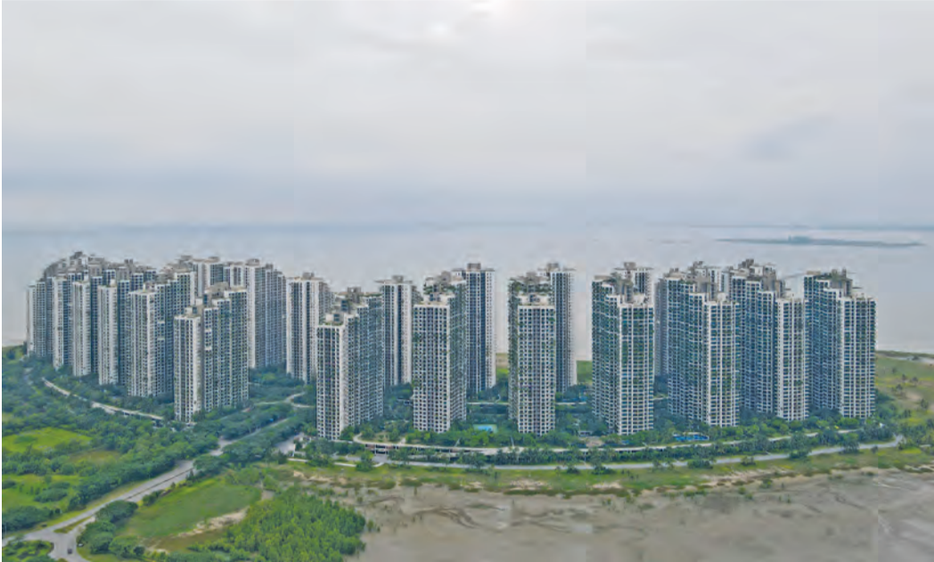
a general view of condominiums at Forest City, a development project launched under China's Belt and Road Initiative in Gelang Patah in Malaysia's Johor state

Had they voted against the extension, the company faced