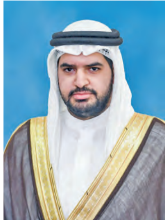
HH Shaikh Isa bin Ali bin Khalifa Al Khalifa

The nationals will be competing in 18 sports, including athletics, handball, boxing, judo, weightlifting, wrestling, jiu-jitsu, rowing, shooting, cy-