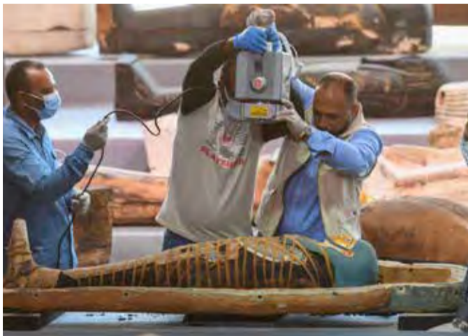
Archaeologists x-ray a mummy at the Saqqara necropolis (file photo) TDT | Manama

The perfume is a blend of beeswax, plant oil, fats, bitumen, Pinaceae resins, a balsamic substance, and dammar or Pistacia tree resin. The ingredients range from as far away as Southeast Asia. Scientists have uncovered the chemical components of a perfume used in ancient Egyptian death rituals that texts refer to as the "scent of eternity." The perfume was found in sealed canopic jars that had been used to embalm a noble woman named Senetnay around the year 1450 BCE. The researchers analysed the liquids using Gas Chromatography-Mass Spectrometry, High-Temperature Gas Chromatography-Mass Spectrometry, and Liquid Chromatography-Tandem Mass Spectrometry to separate the individual substances that made up the balms. They found that the perfume is a blend of beeswax, plant oil, fats, bitumen, Pinaceae resins, a balsamic substance, and dammar or Pistacia tree resin. The ingredients range from as far away as Southeast Asia. The researchers believe that the perfume was used to mask the smell of death and to help