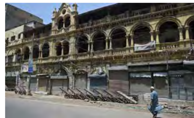
A man walks past closed shops along a street in Karachi

Thousands of Pakistan traders shuttered their shops yesterday, striking over soaring energy and fuel bills stirring widespread discontent ahead of national elections. Decades of mismanagement and instability have hobbled Pakistan's economy, and this summer Islamabad was forced into a deal with the International Monetary Fund (IMF) to avert default. However, the global lender demanded that popular sub-