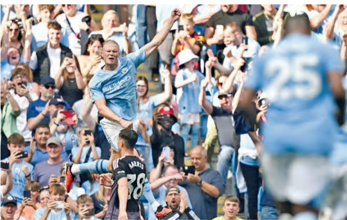
Erling Haaland celebrates after scoring

Fulham, who were missing influential midfielder Joao Palhinha after his deadline day move to Bayern Munich collapsed on Friday, responded immediately when Tim Ream