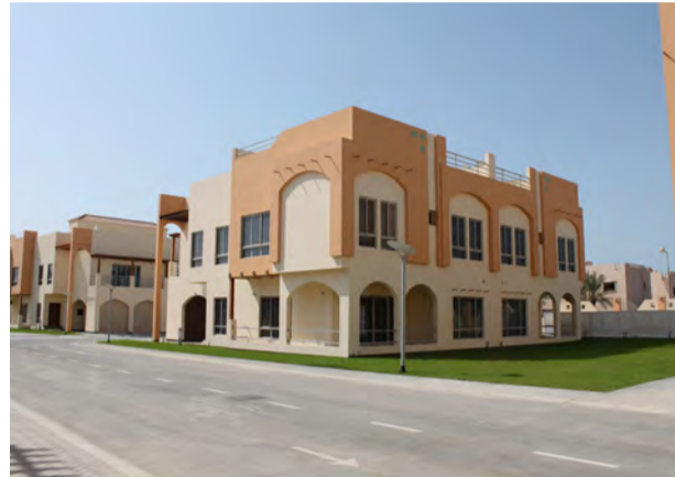
Representative picture

Infill development entails the construction of buildings and amenities on previously unused or underuti-