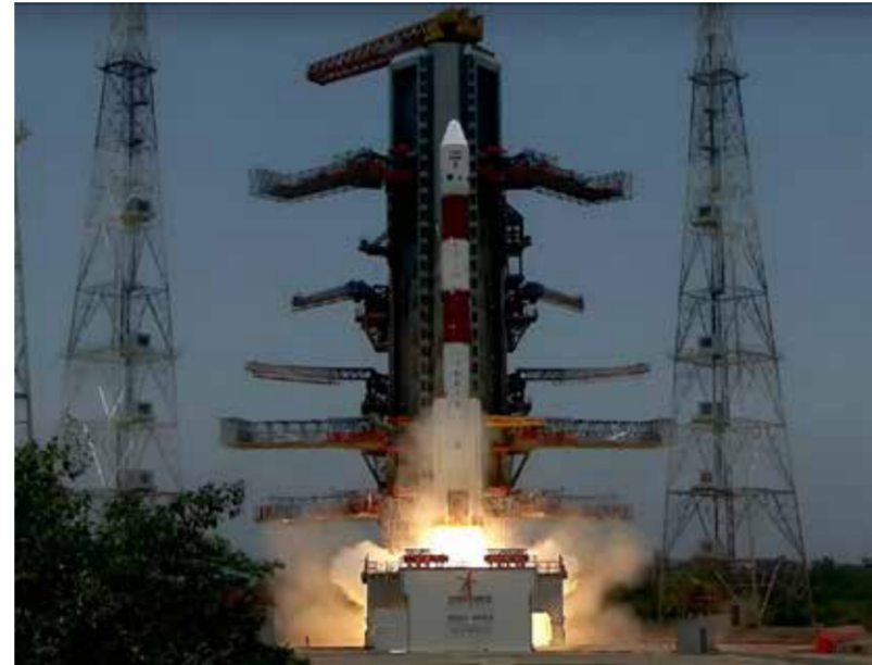
Aditya-L1 spacecraft takes off from the Satish Dhawan Space Centre in Sriharikota

The latest mission in India's ambitious space programme blasted off yesterday on a voyage towards the centre of the solar system, a week after the country's successful unmanned Moon landing. Aditya-L1 launched shortly before midday, with a live broadcast showing hundreds of spectators cheering wildly against the deafening noise of the rocket's ascent. "Launch successful, all normal," an Indian Space Research Organisation official announced from mission control as the vessel made its way to the upper reaches of the Earth's atmosphere. The mission is carrying scientific instruments to observe the Sun's outermost layers in a four-month journey. The United States and the European Space Agency (ESA) have sent numerous probes to the centre of the solar system, beginning with NASA's Pioneer programme in the 1960s.