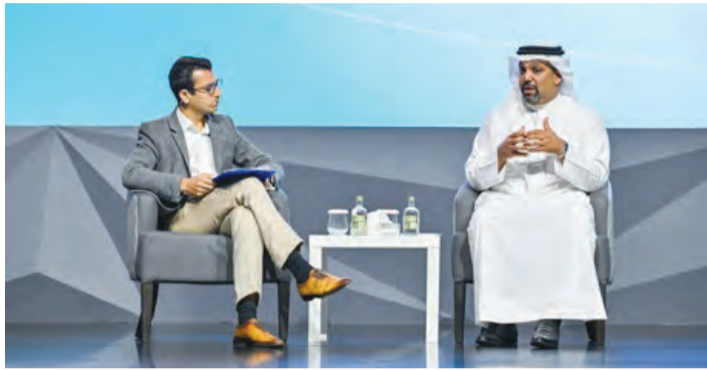
H.E. Shaikh Salman bin Khalifa Al Khalifa at the event

He underscored that Bahrain continues its efforts to create a conducive environment for fintech initiatives, highlighting the establishment of the Cen-