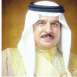
HM the King