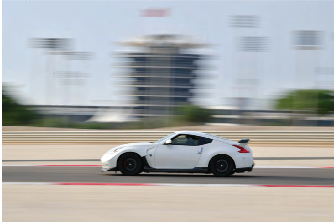
A car in action at BIC

Friday's event is scheduled for 4pm to 11pm, giving participants the chance to tackle BIC's 5.412-kilometre Grand Prix track in unique settings – as the sun goes down and in nighttime con-