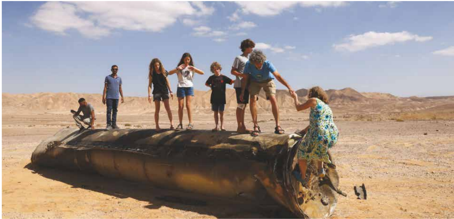
People stand on top of the remains of an Iranian missile in the Negev desert near Arad, on October 2, 2024, in the aftermath of an Iranian missile attack on Israel.

"British forces have this evening played their part in attempts to prevent further escalation in the Middle East," he said. "The UK stands fully behind Israel's right to defend its country and its people against threats." The UK is planning for a possible evacuation in case the fighting leads to the closure of Beirut's airport. Foreign Secretary David Lammy confirmed Wednesday that the first charter flight taking British nationals out of Lebanon "has now departed".