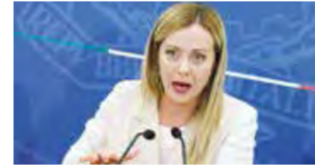
of tensions at the regional level," said the statement released by the Italian government.

Italian Prime Minister Giorgia Meloni -- whose country holds the G7 presidency this year -- called a telephone meeting of the body Wednesday to address