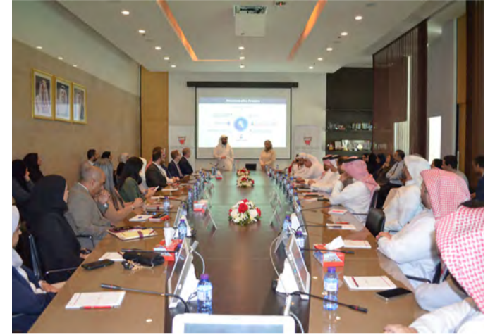
Part of the awareness session attendees