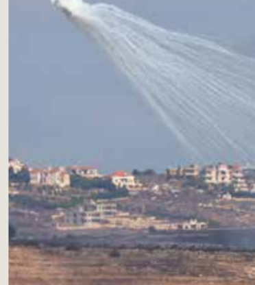
A projectile is seen in the sky after Iran fired a salvo of ballistic missiles, as seen from Tel Aviv, Israel

"Totally unacceptable": US Biden ordered the US military