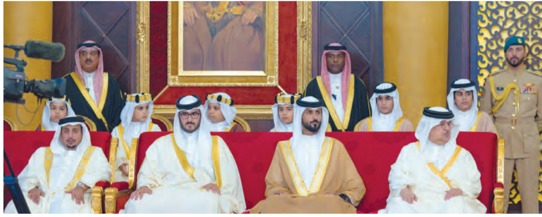
HM the King receives the royal family and senior officials

He concluded by praying for peace and security worldwide and expressed appreciation for the unity and loyalty of the Bahraini people in safeguarding the nation's stability.