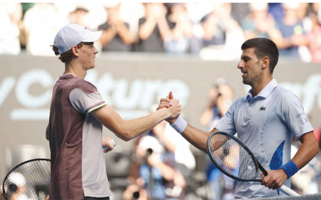
Italy's Jannik Sinner greets Serbia's Novak Djokovic (R) after a match (file photo)

“I think it’s quite obvious that we have a system that is not working well... There’s way too many inconsistencies, way too