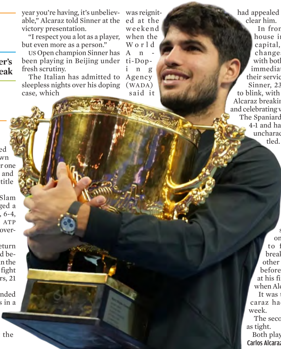
Carlos Alcaraz with his trophy

Both players saw chance Carlos Alcaraz with his trophy