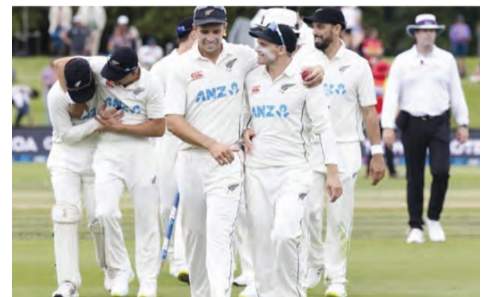
New Zealand's Tim Southee (L) and team captain Tom Latham (R) walk off the field after a match (file photo)