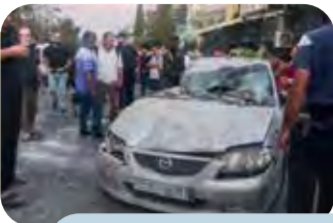
Germany flies more citizens out of Lebanon

Germany yesterday said it had organised a second military flight to evacuate its nationals from Lebanon, after Israel launched ground raids into its neighbour and Iran fired missiles at Israel. An Airbus A330 MRTT departed for Beirut to pick up 130 German nationals considered "particularly vulnerable", Germany's foreign and defence ministries said in a joint statement.