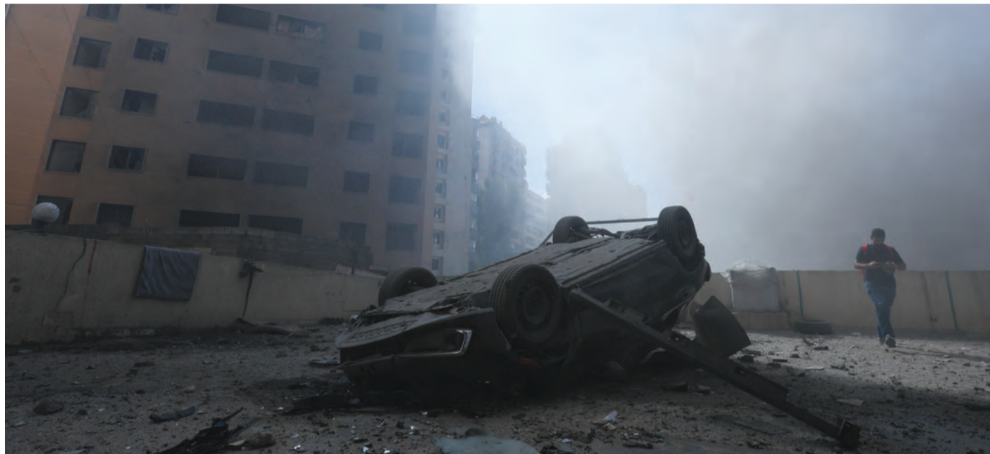
A man walks past a car left in ruins as smoke billows from the site of an Israeli airstrike on a neighborhood in Beirut's southern suburbs.

Eight Israel soldiers dead as Hezbollah claims to repel incursion