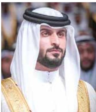
HH Shaikh Nasser