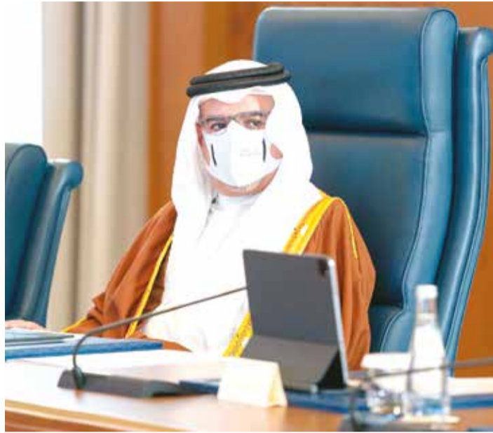
HRH Prince Salman chairs the weekly Cabinet meeting

HRH also ordered the development of sustainable drainage solutions in areas where rainwater has accumulated, in addition to ongoing work to modernise and develop storm water infrastructure. This took place following an assessment of the impact of recent rainfall. The Cabinet discussed and