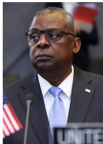
in coronavirus variant during a press

leave isolation, after confusion last week over guidance that would let people leave after five days without symptoms.