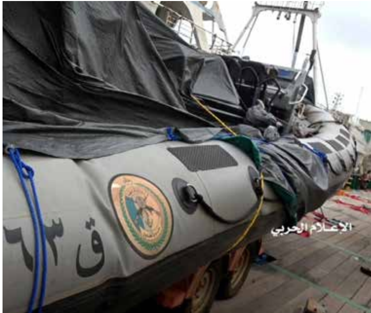
Military equipment is seen on a ship seized by Yemen's Houthi rebels

ship showing armoured vehicles, weapons and ammunition. He added the vessel had been taken to the Houthi-controlled port of Salif, north of Hodeidah. SPA said the vessel was carrying