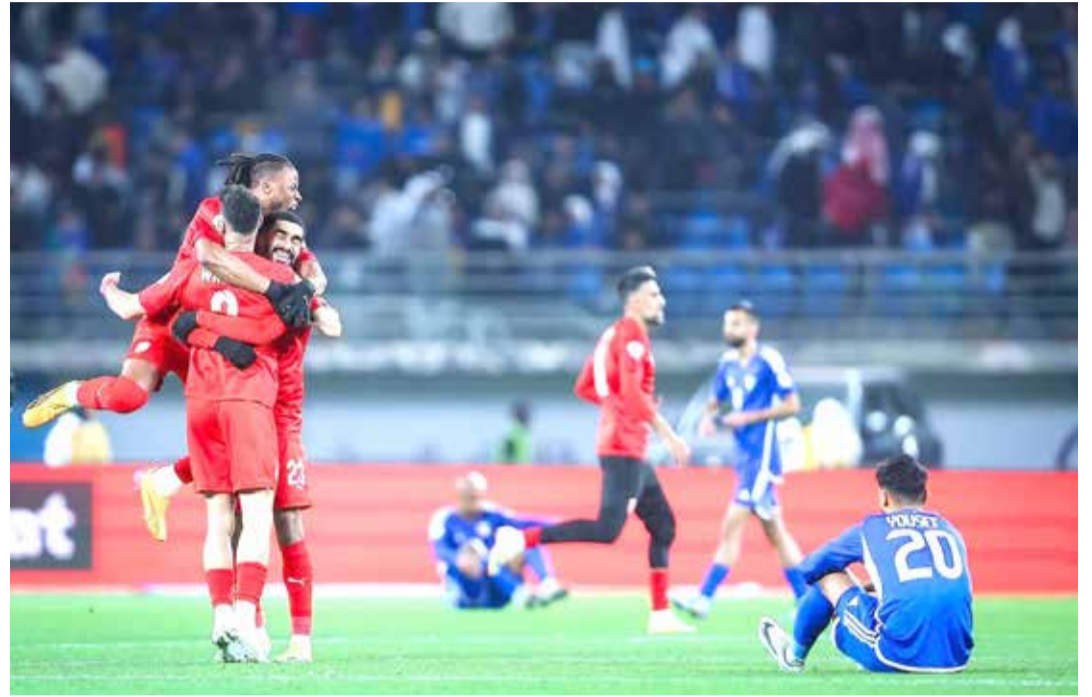
Players celebrate at the end of the semi-final match

● Oman, Bahrain meet in the final at 7 PM today