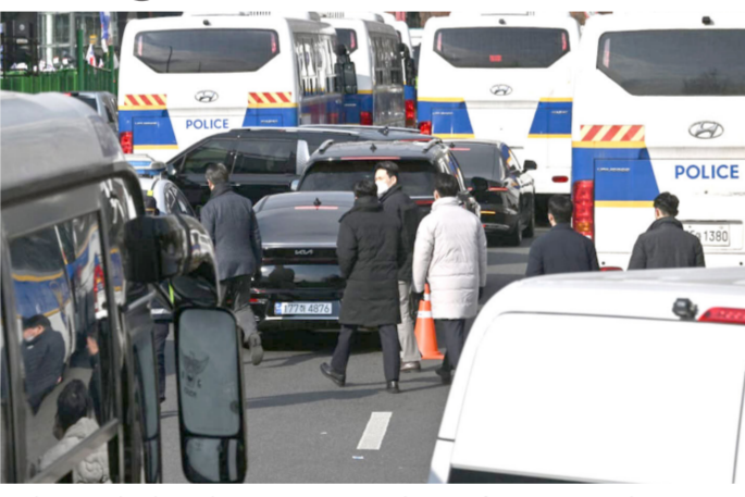
Anti-corruption investigators leave the residence of South Korea's impeached President Yoon Suk Yeol in Seoul

The president, who issued a bungled declaration on December 3 that shook the vibrant East Asian democracy and briefly lurched it back to the dark days