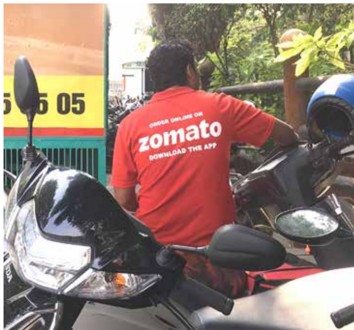
An Indian delivery man working with the food delivery app Zomato sits on his bike in a business district in Mumbai.