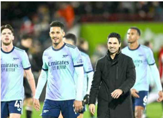
Arsenal's manager Mikel Arteta (R) celebrates with his players (file photo)

"We have to show the same level of consistency and a bit more, because the last year we have been the best team in the league, broken various records and still haven't won a major trophy, so something is missing," said the Spaniard.