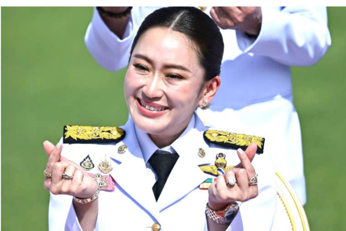
Thailand's Prime Minister Paetongtarn Shinawatra gestures during a group photo with members of the cabinet

She identified 13.8 billion baht ($400 million) in assets, a document posted on media