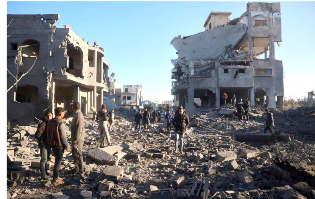
Palestinians check the destruction in the aftermath of an Israeli strike in the al-Maghazi refugee camp in the central Gaza Strip