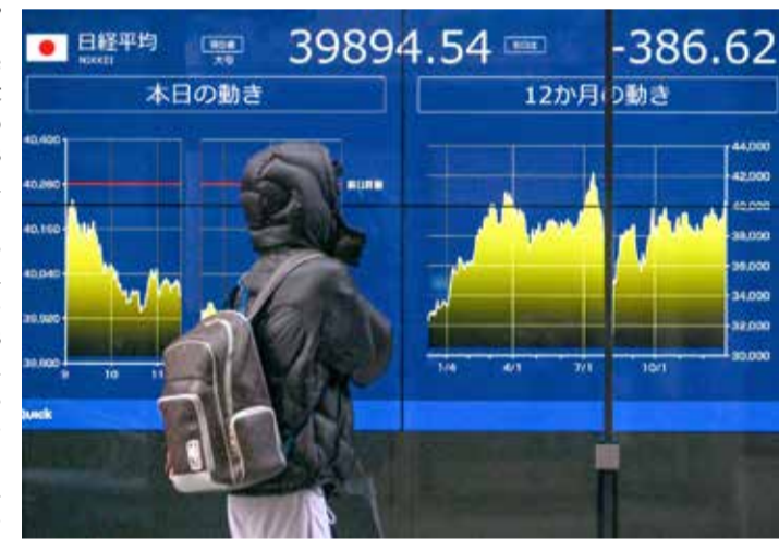
A pedestrian walks past an electronic board showing the closing numbers on the Tokyo Stock Exchange