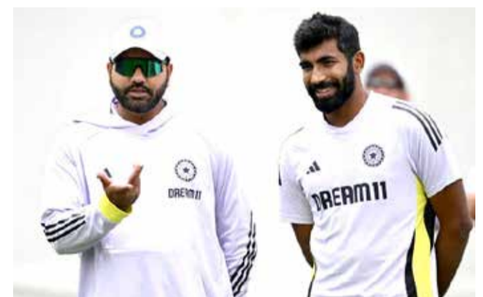
India's captain Rohit Sharma (L) chats with Jasprit Bumrah