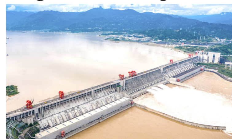
Water being released from the Three Gorges Dam, a hydropower project on the Yangtze river, in Yichang, central China's Hubei province