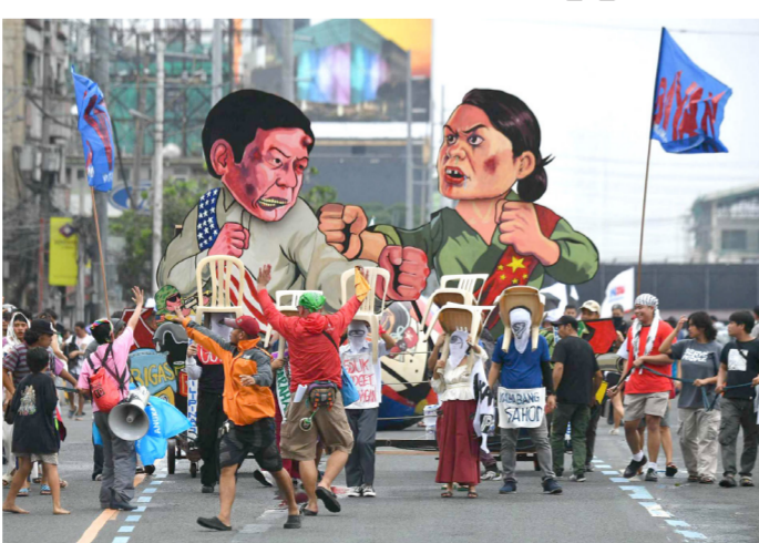
Effigies of Philippine President Ferdinand Marcos (L) and Vice President Sara Duterte are seen as protesters march to congress (file photo)