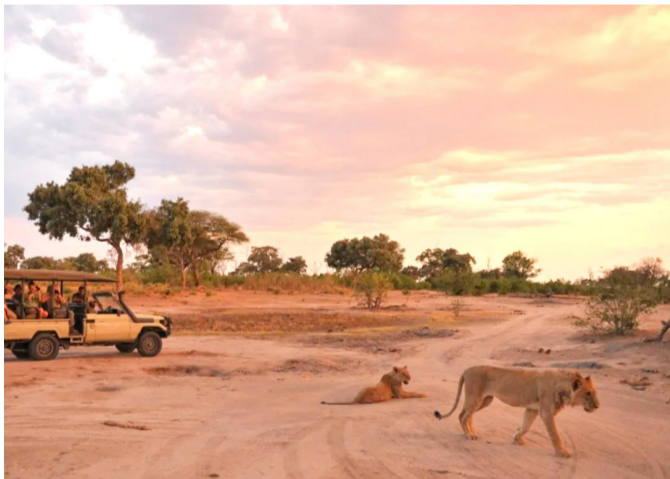
Tourists watch a lion at a park (representative image)