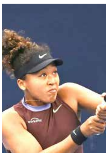
Naomi Osaka in action

servicing game over the next two sets, ending with nine aces to give her 21 for the tournament.