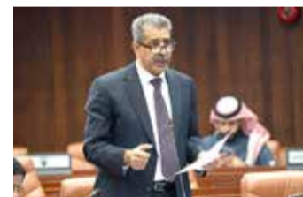
Dr Muneer Seroor, MP, committee rapporteur

The Ministry of Education backs the government's position, emphasising that Bahraini candidates are already prioritised in private schools.