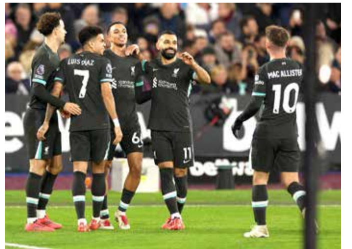
Liverpool’s players celebrates a goal (file photo)