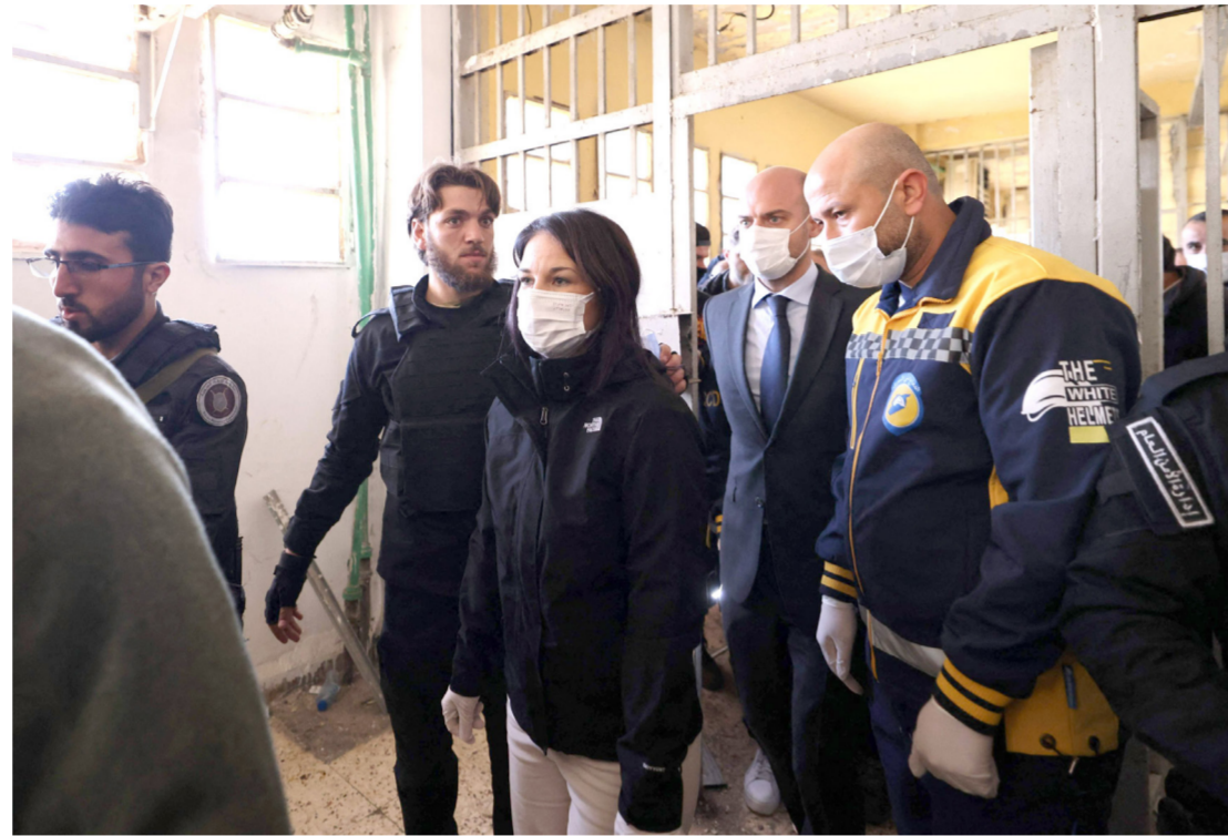
France's Foreign Minister Jean-Noel Barrot (2-R) and his German counterpart Annalena Baerbock visit the Saydnaya prison north of Damascus

The European Union backs a peaceful, inclusive transition in Syria, top French and German diplomats said yesterday as they visited Damascus to meet with new leader Ahmed al-Sharaa.