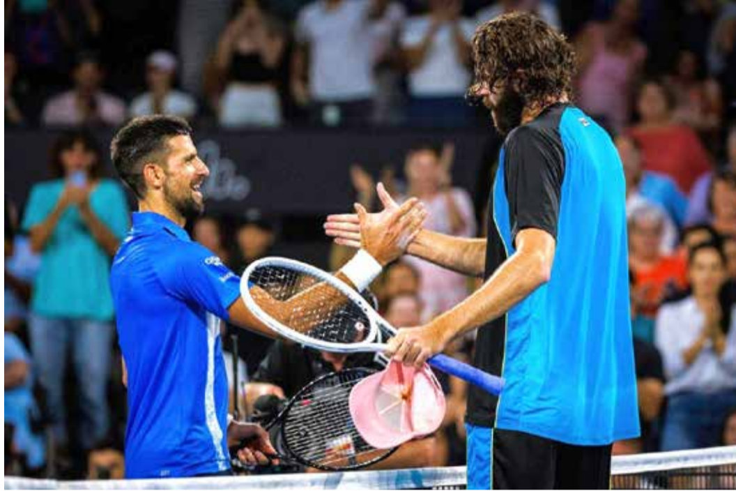
Winner Reilly Opelka of the United States (R) and Serbia's Novak Djokovic shake hands

But Opelka, 27, a former world number 17 who was out of the game for almost two years from 2022-24 following hip and wrist surgeries, dominated the Serb and wrapped up a comfortable win in an hour and 40 minutes.