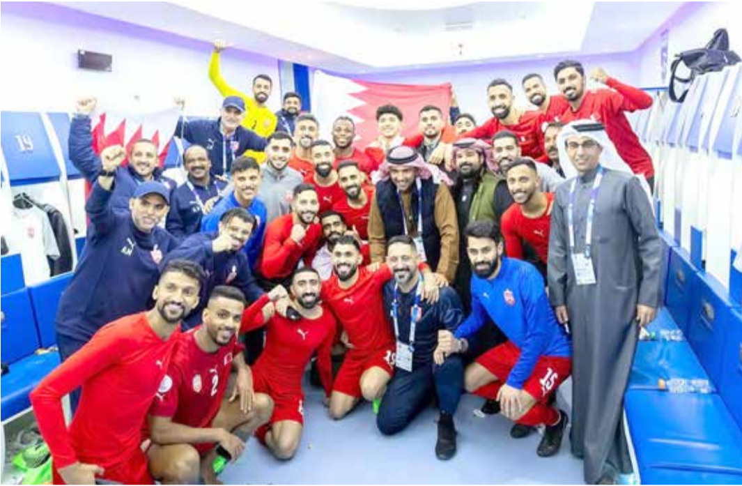
Bahrain's players celebrate in the dressing room following their semi-final win against Kuwait