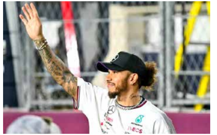
Lewis Hamilton waves to fans (file photo)