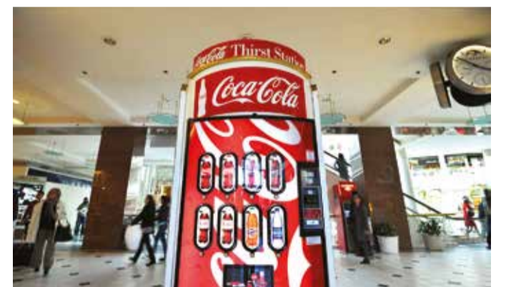
People walk past a Coca Cola vending machine at a shopping mall in Arlington, Virginia New York, United States

Coca-Cola said Friday it plans to pay a tax penalty worth $6 billion while it pursues an appeal in a long-running dispute with the Internal Revenue Service.