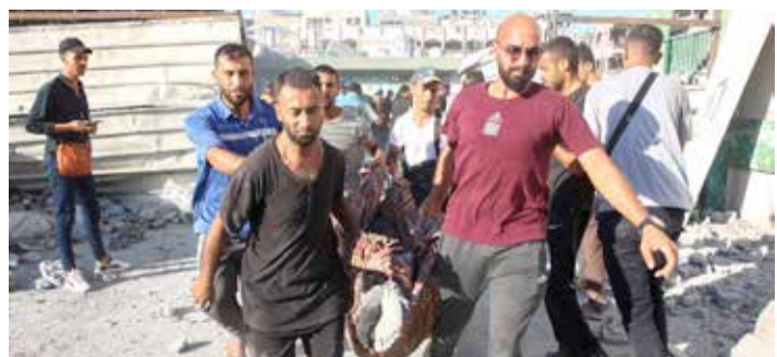
Palestinians pull a body from the rubble following Israeli bombardment which hit a school complex, including the Hamama and al-Huda schools, in the north of Gaza City.

The Israeli military confirmed the strike, saying it had hit a