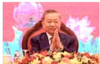
Vietnamese President To Lam blazes furnace crackdown on corruption.

Lam's ascension comes two weeks after the death of General Secretary Nguyen Phu Trong, Vietnam's most powerful leader in decades, who presided over the so-called