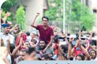
Bangladesh students step up protests to press PM's resignation

◆ Bangladeshi student leaders yesterday said they would carry on a planned nationwide civil disobedience campaign until Prime Minister Sheikh Hasina resigned following last month's deadly police crackdown on protesters. Rallies against civil service job quotas sparked days of mayhem in July that killed more than 200 people in some of the worst unrest of Hasina's 15-year tenure. Troop deployments briefly restored order but crowds returned to the streets in huge numbers this week ahead of an all-out non-cooperation movement aimed at paralysing the government planned to begin on Sunday. Students Against Discrimination, the group responsible for organising the initial protests, rebuffed an offer of talks with Hasina earlier in the day before announcing their campaign would continue until the premier and her government step down.