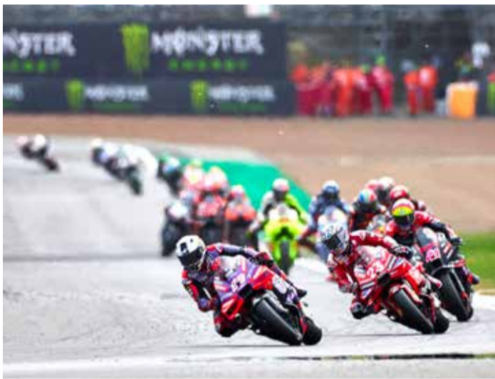
Riders compete in the MotoGP sprint race of the British Grand Prix at Silverstone circuit in Northamptonshire, central England

Bastianini struggled to stay with him for the first couple of laps but slowly reeled him in before sliding past to take the lead which he held until the end