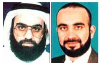
This undated FBI file image shows Khalid Shaikh Mohammed, as he appeared on the FBI's Most Wanted Terrorists website

"I have determined that, in light of the significance of the decision to enter into pre-trial agreements with the accused... responsibility for such a decision should rest with