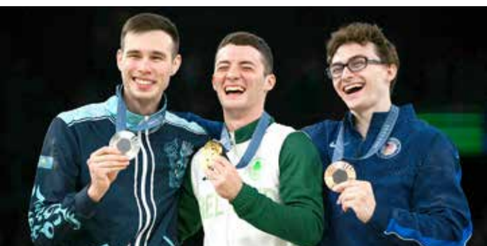
(From L) Silver medallist Kazakhstan's Nariman Kurbanov, gold medallist Ireland's Rhys McClenaghan and bronze's medallist US' Stephen Nedoroscik celebrate during the podium ceremony for the artistic gymnastics men's pommel horse final during the Paris 2024 Olympic Games at the Bercy Arena in Paris

Britain's most decorated gymnast Max Whitlock was deprived a perfect send-off to his decorated Olympic career, finishing fourth. Whitlock