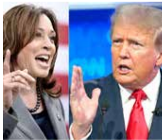
Harris and Trump

Kamala Harris's campaign branded Donald Trump "scared" Saturday after he proposed to change the presidential debate schedule ahead of a rally in Georgia where he will try to halt the vice president's surging momentum in her bid to become America's first woman president.