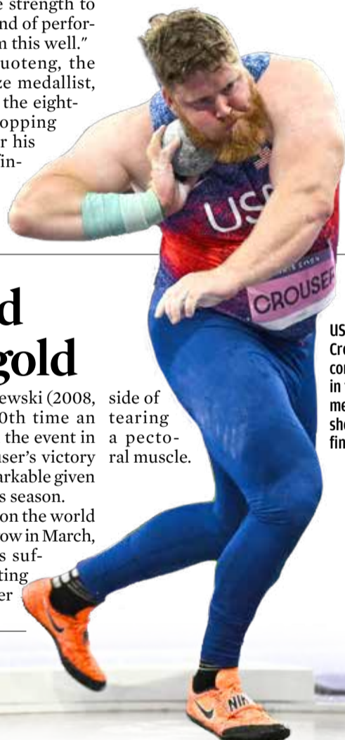
US' Ryan Crouser competes in the men's shot put final