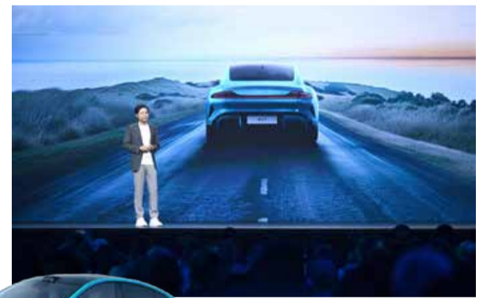
Xiaomi founder, chairman and CEO, Lei Jun speaks in front of an image of the Xiaomi SU7 car at an event where he also launched a new mobile phone in Beijing

with a 94.4 kWh battery. The base model produces 362 BHP, the Quattro 422 BHP, and the S6 up to 543 BHP with launch control. It offers a range between 610 km to 756 km and supports 270 kW fast charging, achieving 10-80% charge in 21 minutes. Set to rival the BMW i5, the A6 e-tron will be priced from around 75,000 euros and will be available internationally in the coming months.