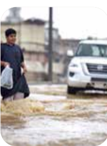
Saudi flash flood kills one

◆ A flash flood from the mountains of southwestern Saudi Arabia swept away part of a bridge in Jizan province, killing one person yesterday, state media reported. State television news channel Al-Ekhbariya aired images of two vehicles caught up in the floodwaters, one of them crushed by a collapsed bridge support. It said several people were also injured in the bridge collapse at an important crossroads inland from the Red Sea port city of Jizan. The National Centre for Meteorology warned Saturday that more heavy rainfall was still to come in Jizan province, with thunderstorms forecast in the mountains. Jizan province has starkly different climates. The narrow coastal plain along the Red Sea experiences some of the highest temperatures in Saudi Arabia, but the mountains inland, which rise to 3,000 metres (10,000 feet), are much cooler, with significant rainfall even in summer.