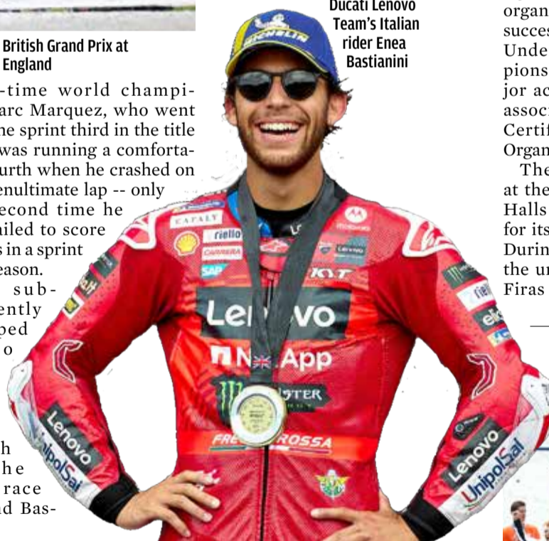
Ducati Lenovo Team's Italian rider Enea Bastianini

for his first win of any kind since taking the Malaysian MotoGP last November.