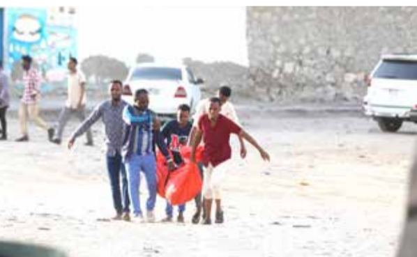
the body of a woman killed during an attack in Mogadishu