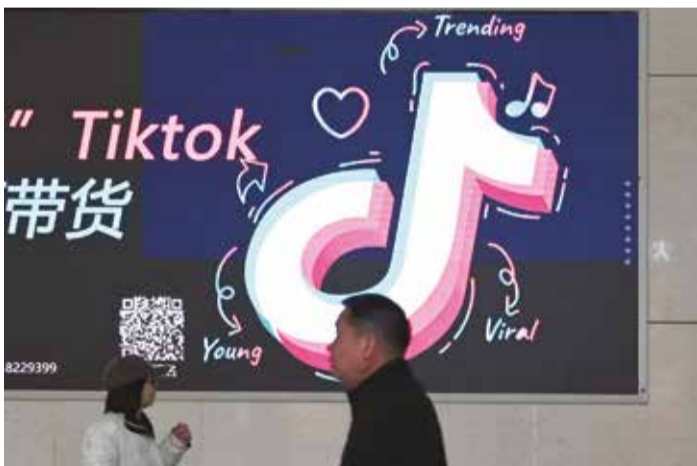
People walk past an advertisement featuring the TikTok logo at a train station in Zhengzhou, in China's central Henan province

TikTok and its parent company ByteDance often "failed