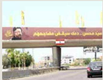
Yellow Hezbollah party flags are erected along with a banner showing assassinated Hezbollah top commander Fuad Shukur, placed along a walk way across the Sidon-to-Tyre highway, in southern Lebanon

ign ministry has in- staff to leave Beirut to Cyprus, and the nistry is planning a relocation of its em- eign Minister Tobias old Swedish Radio. sion had been taken r the month of August extended depending rity situation." nistry is monitoring ts closely," he said. g to the foreign min- ny as 10,000 Swedish ay have travelled to