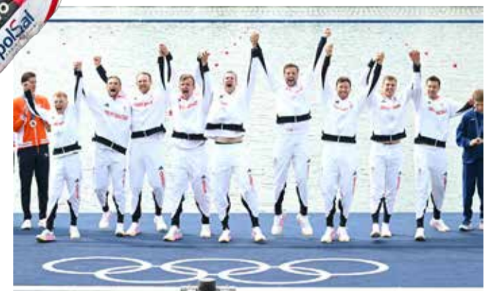
Great Britain's gold medallists Vaires-sur-Marne, France

Britain's men's eight confirmed the nation's return as an Olympic rowing superpower by winning the regatta's blue riband event on Saturday but the Netherlands topped the medals table.