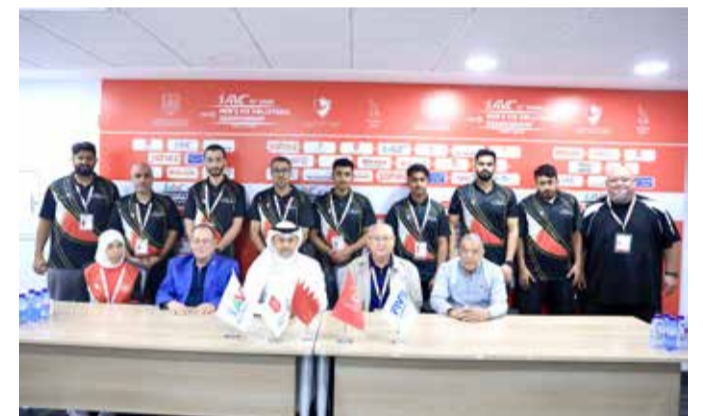
Officials during a press conference