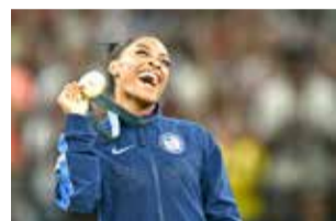
Gold medalist US' Simone Biles