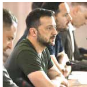
Ukrainian President Volodymyr Zelenskyy