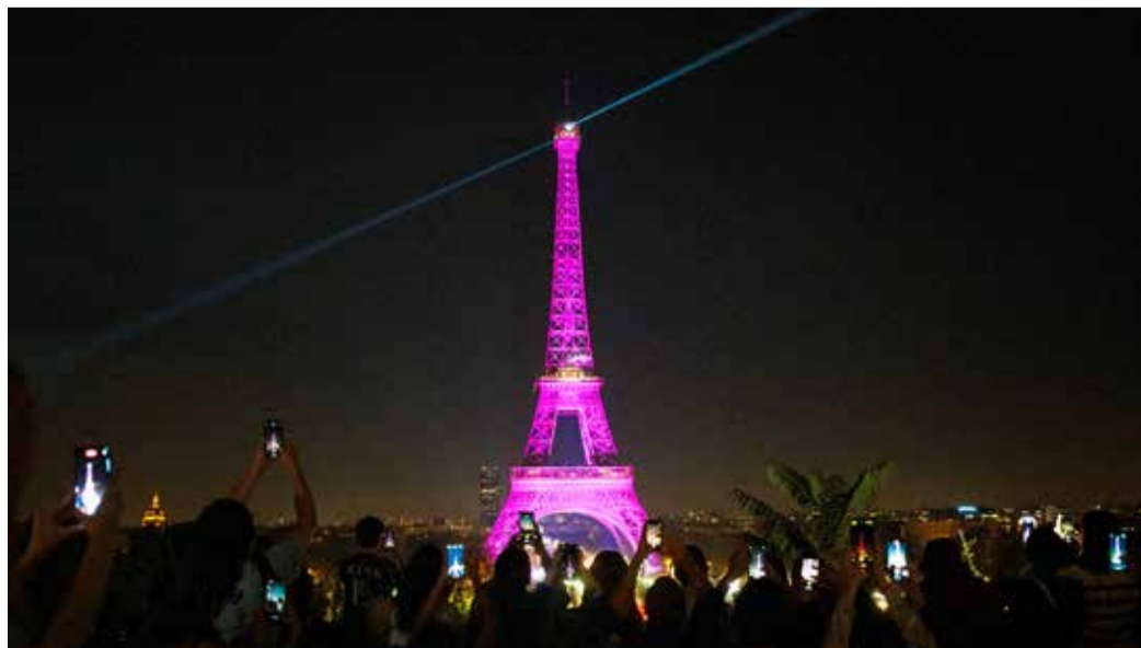
This picture taken from the Trocadero square shows the Eiffel Tower illuminated in pink in Paris on October 1, 2023, to mark the launch of Pink October, or Breast Cancer Awareness Month.