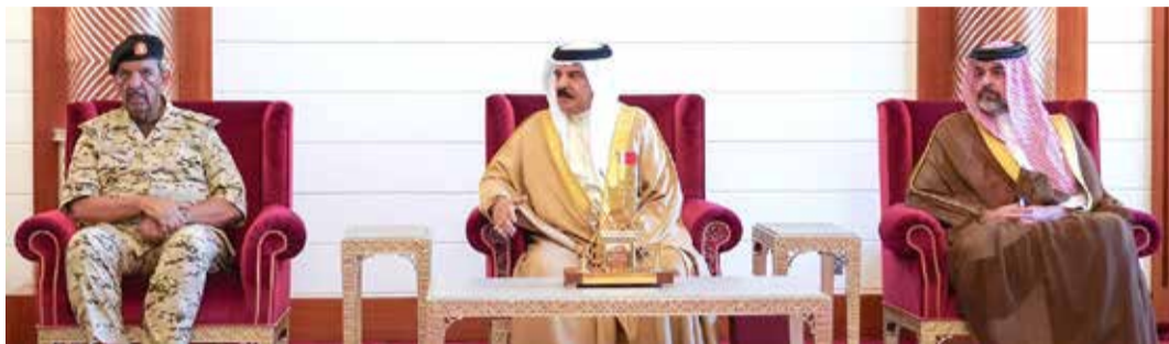
HM the King receives the families of the BDF's fallen servicemen