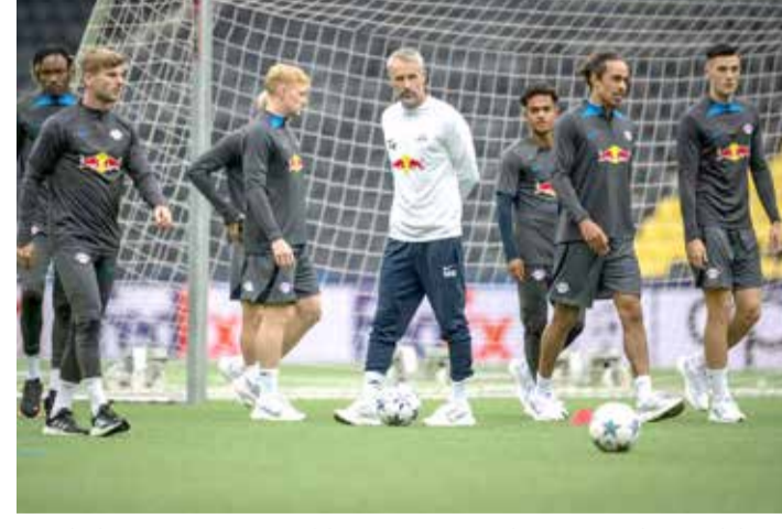
RB Leipzig's coach Marco Rose (C) looks on next to his players during a training (file photo)

AFP | Berlin RB Leipzig coach Marco Rose said last season's 7-0 thrashing by Manchester City was "history" as the two sides prepare to meet again in the Champions League in Germany on Wednesday. City's rampant victory in their home leg of the last 16 tie, with Erling Haaland scoring five goals in 60 minutes, was one of the English side's key victories on the way to winning the Champions League for the first time last season. "It wasn't part of the preparation for the game, because it's history," Rose said in Leipzig yesterday. "Everything came together for them in that match and of