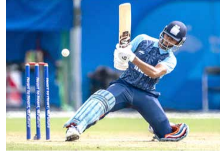
India's Yashasvi Jaiswal plays a shot

AFP | Hangzhou Explosive opener Yashasvi Jaiswal smashed seven sixes in a sublime maiden T20 century as India's men opened their first Asian Games campaign with a 23-run defeat of gutsy Nepal yesterday. Pakistan also reached the semi-finals, crushing Hong Kong by 68 runs with experienced all-rounder Khushdil Shah taking 3-13. With superstars such as Rohit Sharma and Virat Kohli at home for the one-day World Cup beginning on Thursday, India, the world's top-ranked Twenty20 team, have a second-string squad in Hangzhou. But it is still formidable, packed with promising youngsters who have excelled in the Indian Premier League and a host of players with international experience. After winning the toss and opting to bat, Jaiswal's masterful 100, from 49 balls, plus late fireworks from Rinku Singh (37 not out) and Shivam Dube (25 not out) helped them to 202-4. Nepal had bludgeoned a record 314-3 against Mongolia in the qualifying rounds, but they could only manage 179-9 in reply, with Avesh Khan and Ravi Bishnoi taking three wickets each. "They are a good side so we're not surprised at how they came at us," said India skipper Rituraj Gaikwad. "It wasn't our best day but we still managed to get a win."