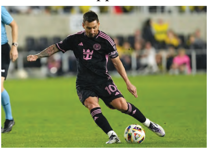
Lionel Messi #10 of Inter Miami CF takes a free kick