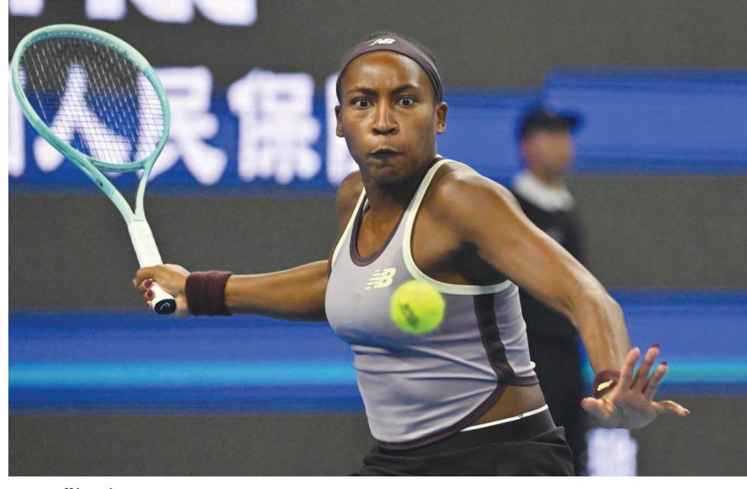
Coco Gauff in action

cently parted ways with coach a 3-0 lead in the deciding set on two Badosa disappointed the quarter-finalist who has been stretching more than 600 days, defeat of Zhang.