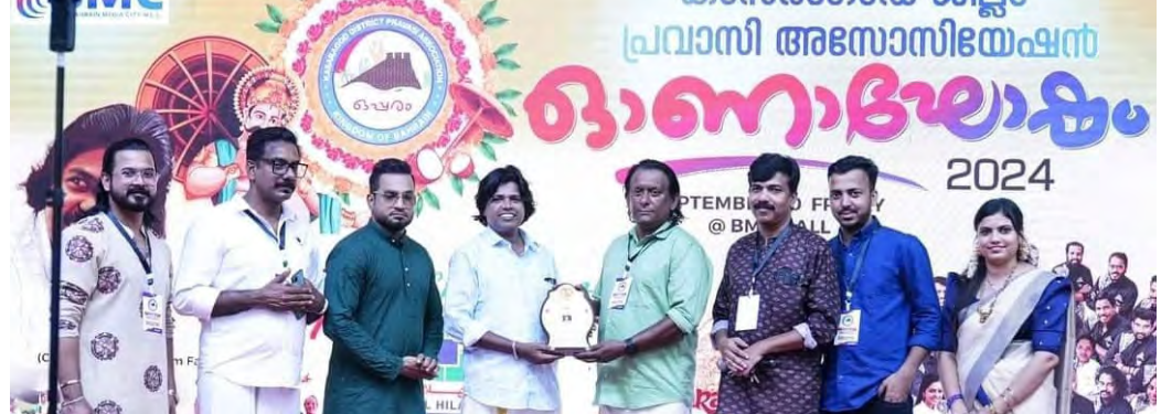
Popular film and television star Unni Raja graces the occasion