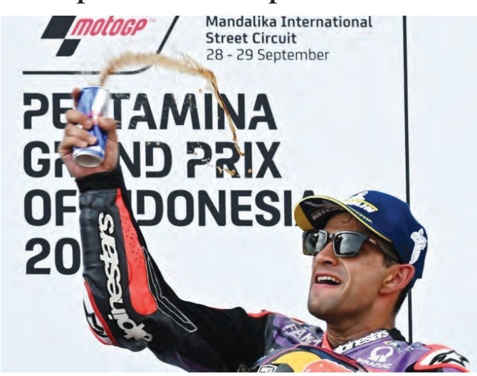
Spain's Jorge Martin celebrates winning Indonesia MotoGP (file photo)