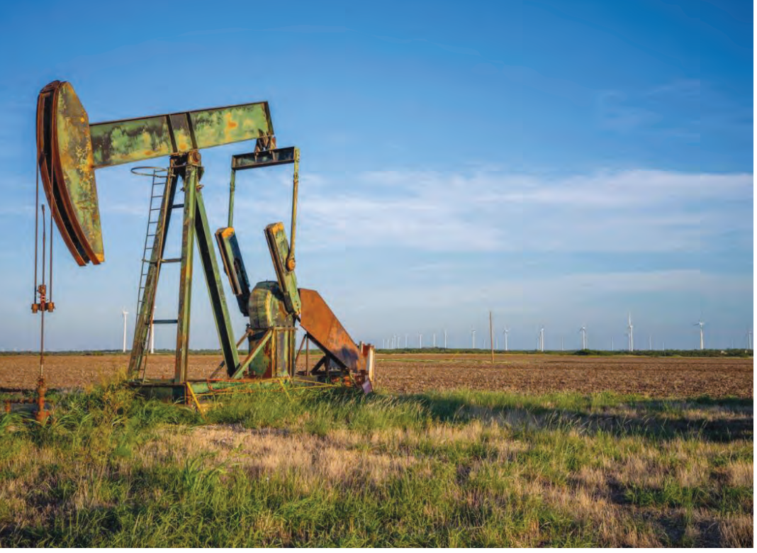
An oil pump jack is shown in a field in Nolan, Texas

York but the tech-heavy Nasdag on investors, with a key employwas up while the London, Paris ment report coming Friday.