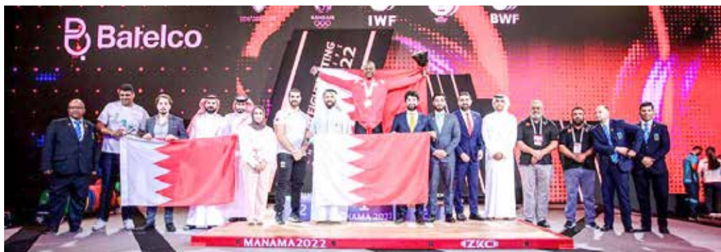
Officials at the event

place in a specially designated area adjacent to the Bahrain National Theater, offering an ideal setting for athletes and spectators alike.