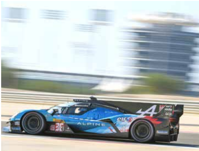
A car in action on track at BIC