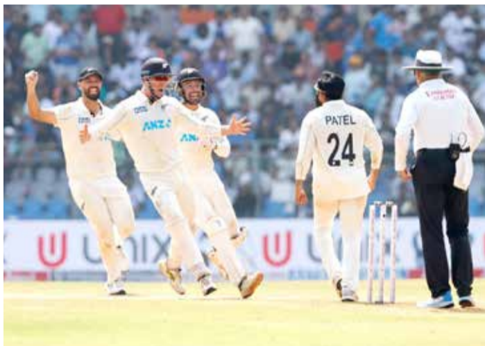
New Zealand's players celebrate at the end of the match