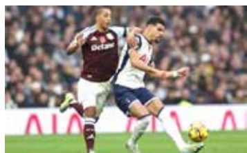
Tottenham's Dominic Solanke in action

James Maddison added gloss by firing home a free kick deep into stoppage time.