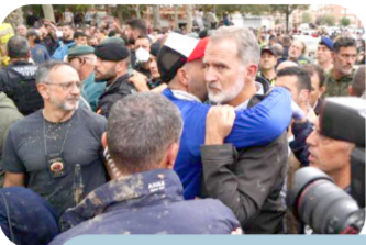
Crowd huris mud, insults at Spanish royals, PM on visit to flood zone

◆ Furious locals pelted Spain's royals and premier yesterday with mud and cries of "murderers!", forcing officials to cut short their visit to the town worst hit by the floods which have killed more than 200. The angry crowd in the town of Palporta focused most of its wrath on Prime Minister Pedro Sanchez and the head of the Valencia region, both of whom were whisked away by security. King Felipe VI and Queen Letizia were hit in the face and clothes with mud as they tried to calm the angry crowd, AFP journalists saw. Broadcast on Spanish television, the extraordinary scenes underscored the depth of the anger in the country over the response to the nation's worst such disaster in decades, with the toll ever rising and hopes for finding survivors ebbing five days on. The king and queen arrived just after midday at a crisis centre in Palporta, ground zero for a disaster Sanchez called the second deadliest flood in Europe this century.