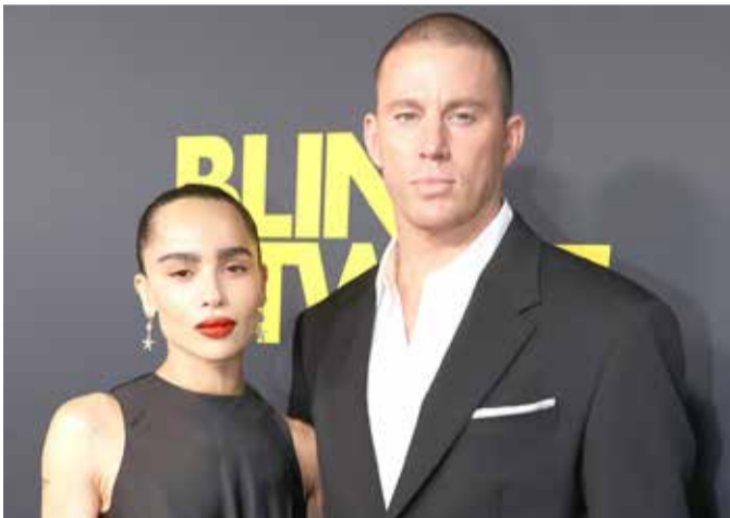
Zoë Kravitz and Channing Tatum | Los Angeles

Zoë Kravitz and Channing Tatum have “been in touch” since their break up.