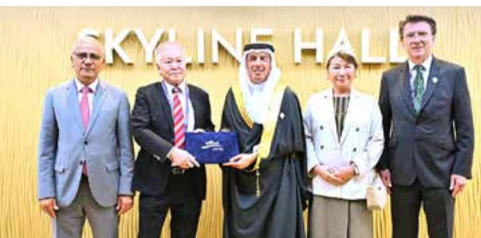
Alba and Daiki Aluminium enter into cooperation agreement