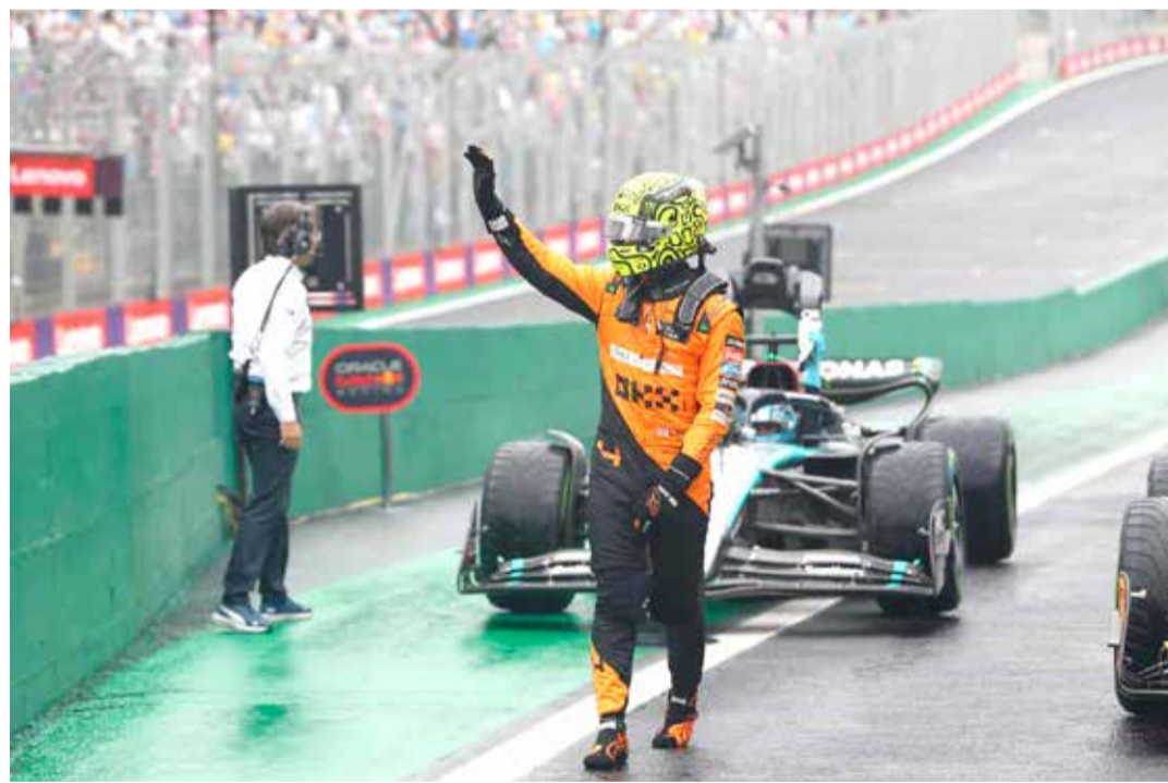
McLaren's British driver Lando Norris celebrates taking pole position

Verstappen failed to make the cut from the second qualifying session, when it was halted by Aston Martin's Lance Stroll