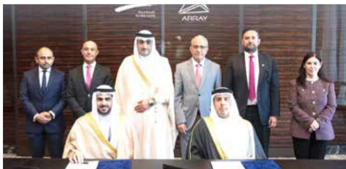
Alba and ARRAY Innovation sign strategic partnership