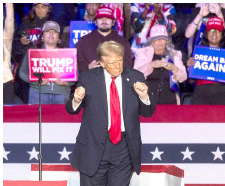
Donald Trump dances at the end of a campaign rally at First Horizon Coliseum in Greensboro, North Carolina

Harris -- desperate to shore up the Great Lakes states seen as essential to any Democratic ticket -- was to spend the day in Michigan, beginning in Detroit before a stop in Pontiac and an evening rally at Michigan State University. Trump's Sunday timetables take place in areas with large Hispanic populations but Pennsylvania is the swing state with the most Puerto Ricans, a community particularly angered by the bigotry at Trump's rally. But with reproductive rights emerging as a top voter concern, her campaign has taken some comfort from the large proportion of women turning out among the