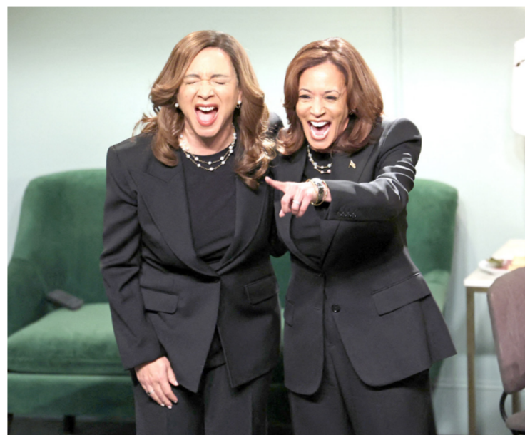
Kamala Harris (R) and US actress Maya Rudolph

Trump flipped the state, a former Democratic stronghold, on his way to defeating Hillary Clinton in 2016. Joe Biden returned it to the Democratic column in 2020, buoyed by unionized workers and a large Black community. But this time, Harris risks losing the support of a 200,000-strong Arab-American community that has denounced Biden's handling of the Israel-Hamas war in Gaza. Pollsters have noted an erosion in Black support for the Democratic ticket and Harris's aides acknowledge that they still have work to do to turn out enough African American men to match Biden's winning coalition in 2020. But with reproductive rights emerging as a top voter concern, her campaign has taken some comfort from the large proportion of women turning out among the