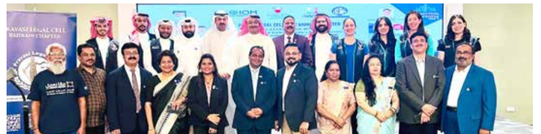
PLC Bahrain Chapter officials and members, along with LMRA and IOM representatives and participants