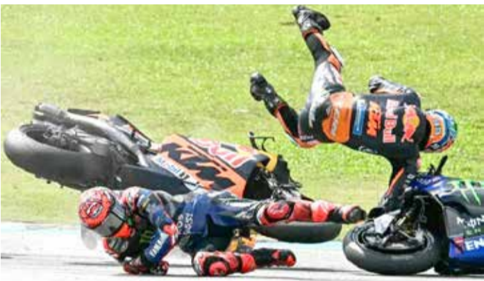
Monster Energy Yamaha MotoGP's French rider Fabio Quartararo (L) and Red Bull KTM Factory's South African rider Brad Binder (R) fall after a collision

Enea Bastianini was a distant third to complete the podium behind the dominant front two, who battled wheel-to-wheel for