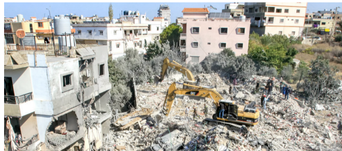
An excavator clears rubble and debris at the site of an overnight Israeli air strike on town of Sarafand, between Sidon and Tyre in southern Lebanon

AFP | Beirut, Lebanon "The Israeli enemy's raid on Haret Saida resulted in an initial death toll of three people killed and nine others injured," Lebanon's health ministry said, referring to a densely populated area near Sidon. Lebanon's health ministry said three people near the southern city of Sidon on Sunday as more bombs fell in the country's east after Israel warned it would again hit Hezbollah targets there.