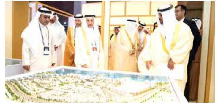
Deputy Prime Minister and Minister of Finance and National Economy attended

The Kingdom of Bahrain, under the leadership of His Majesty King Hamad bin Isa Al Khalifa, remains committed to consolidating its position as a hub for attracting global investments, His Royal Highness Prince Salman bin Hamad Al Khalifa, the Crown Prince and Prime Minister, said yesterday. Meeting senior participants at the second edition of the Gateway Gulf Investment Forum 2024, His Royal Highness noted the Kingdom's commitment to economic diversification through close cooperation and