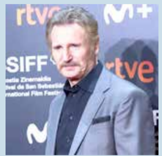
Liam Neeson | Los Angeles

Liam Neeson is “past all that” when it comes to dating.