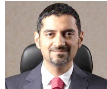
H.E. Wael bin Nasser Al Mubarak

Mara'ee reflects the interest of the Kingdom in preserving livestock and consolidating food security, commensurate with the plans and programmes implemented by the government, led by His Royal Highness Prince Salman bin Hamad Al Khalifa, the Crown Prince and Prime Minister, to enhance sustainable investment in this vital sector.