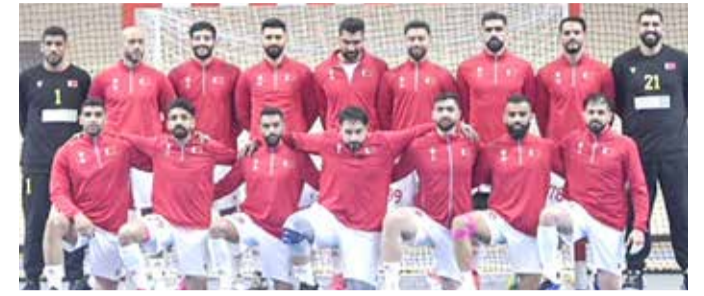
Bahrain national handball team