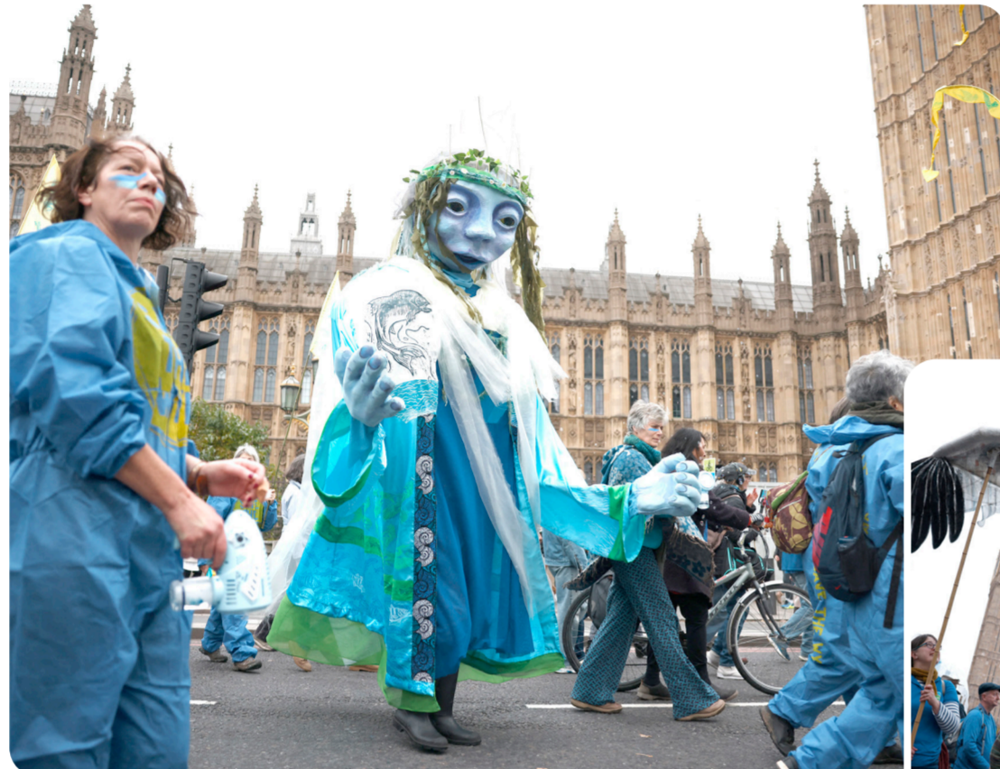
"March for Clean Water" in London

The new Labour government last month set out legislation that will give regulators powers to