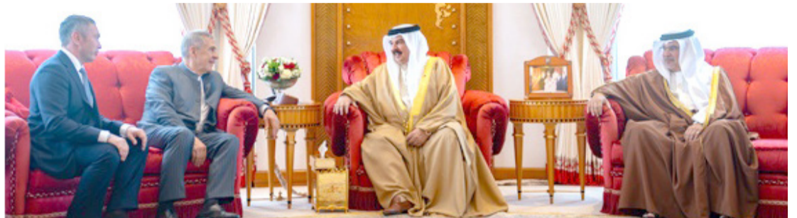
His Majesty King Hamad bin Isa Al Khalifa received His Excellency President Rustam Minnikhanov of Tatarstan and Head of the Strategic Vision Group, at Sakhir Palace. His Royal Highness Prince Salman bin Hamad Al Khalifa, the Crown Prince and Prime Minister, was in attendance. President Minnikhanov is visiting the Kingdom to participate in the 19th Annual Islamic Banking Conference, organised by the Accounting and Auditing Organisation for Islamic Financial Institutions (AAOIFI) and the Islamic Development Bank (ISDB). HM the King welcomed President Minnikhanov and his participation in this important conference. His Majesty extended best wishes to all attendees in their efforts to advance Islamic banking. He emphasised the vital role of Islamic banks and financial institutions in supporting economic and social development across Islamic nations. The meeting discussed the close bilateral relations between Bahrain and Tatarstan and opportunities to expand cooperation across various domains.