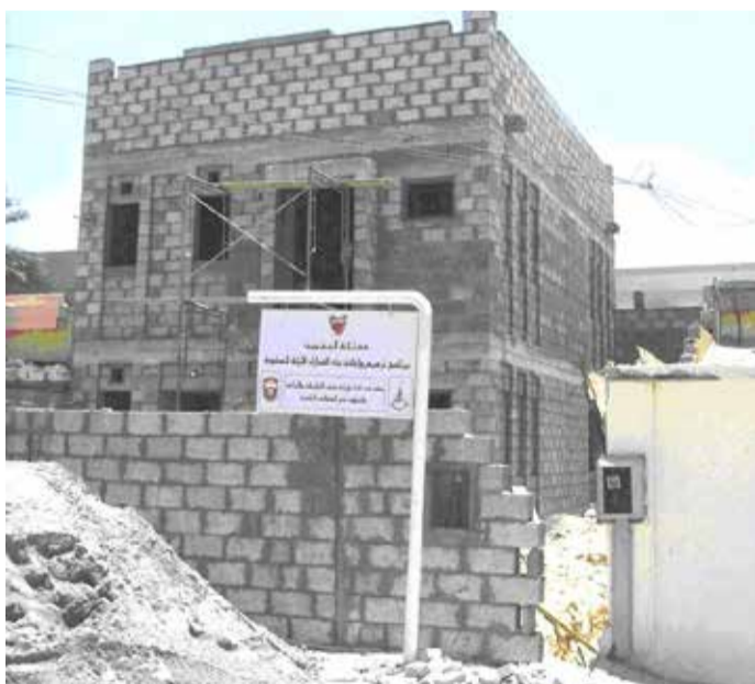
Funding support is needed for suitable housing for Bahraini families

Ebrahim noted that existing social welfare programmes for home repairs often have limited budgets and are subject to