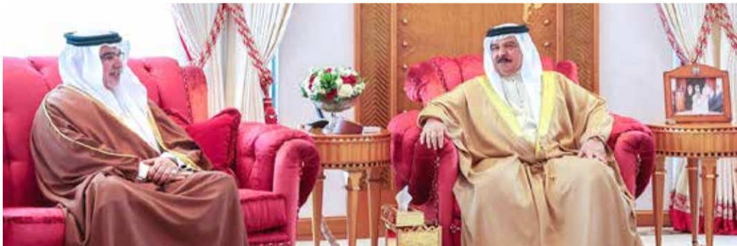
HM the King receives HRH the Crown Prince and Prime Minister

The national plans included the recently launched National Tree Week, which garnered broad engagement across official, community, and public