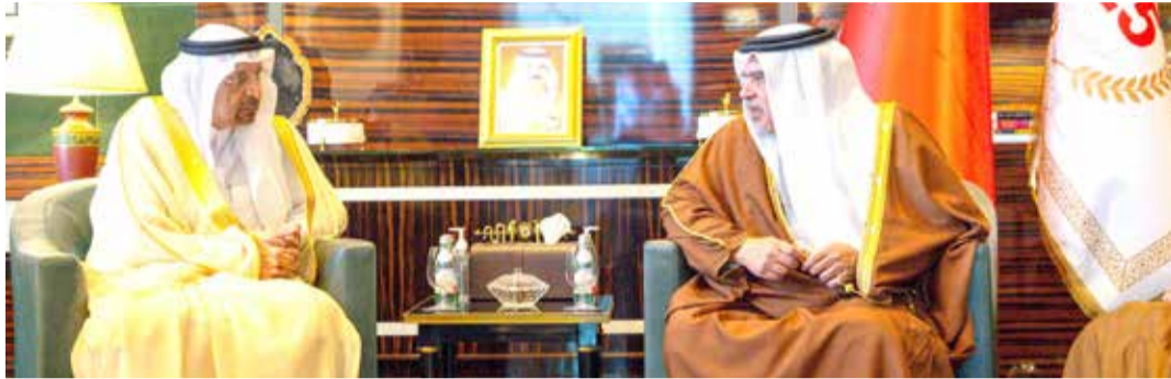
HRH the Crown Prince and Prime Minister meets several senior participants at the event