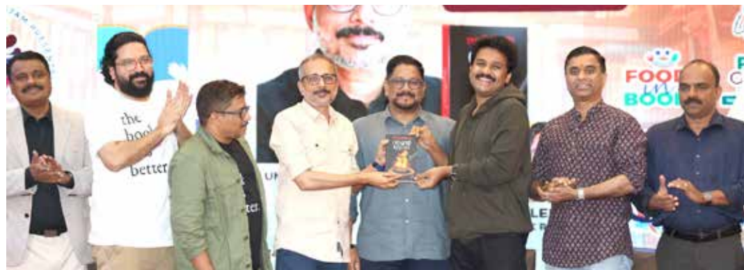
Presentation of the book