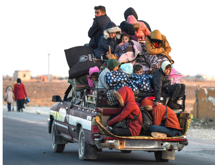
Displaced Syrian Kurds ride vehicles loaded with belongings on the Aleppo-Raqqa highway

Before the war, it cost around 100 shekels. Inside Gaza where more than