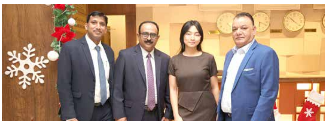
Pars International Hotel hosted its annual Christmas tree lighting ceremony on Monday, marking the start of the holiday season with joy and warmth.