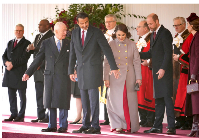
Britain's King Charles III (3L), stads with Qatar's Emir Sheikh Tamim bin Hamad al-Thani (C) and his wife Sheikha Jawaher bint Hamad bin Suhaim al-Thani (5R), along with Britain's Prince William, Prince of Wales (3R) and Britain's Catherine, Princess of Wales (4R) during a Ceremonial Welcome at Horse Guards Parade in London