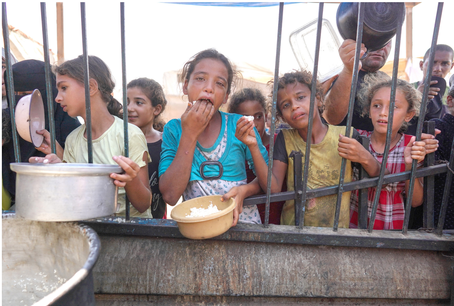
Palestinians receive cooked food rations as part of a volunteer initiative in a makeshift displacement camp in Mawasi Khan Yunis in the besieged Gaza Strip