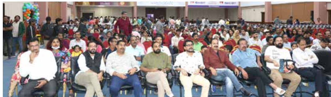
Audience at the event

erations. Commending 'RANGOON SRAAPPU', he remarked that the novel delves into the intricacies of human relationships and societal dynamics, resonating with readers on multiple levels. He advocated for creative