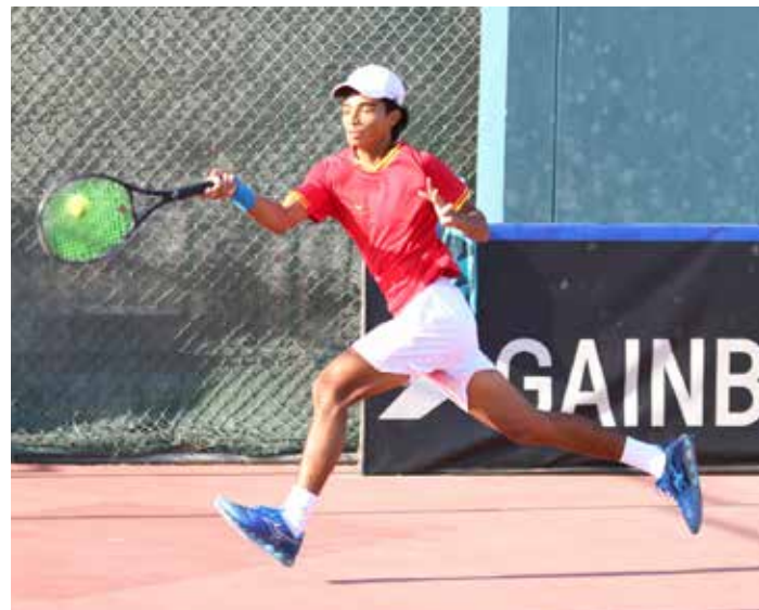
Action from a match