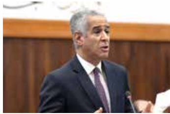
“These homes are waiting for someone to rescue them. In the Capital Governorate alone, over 1,200 houses are on the brink of collapse. Claiming that there's no money is no excuse.” - ABDULNABI SALMAN, FIRST DEPUTY SPEAKER