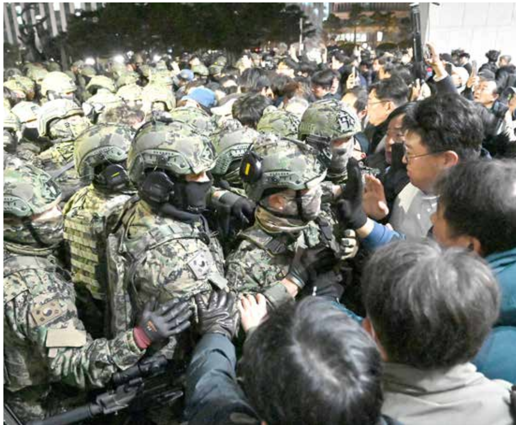
Soldiers try to enter the National Assembly building in Seoul

Yoon's stunning announcement -- South Korea's first dec-