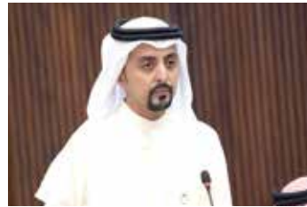
MP Dr Ali Al Nuaimi “The Bahrain Authority for Culture and Antiquities has frozen old properties, calling them heritage homes, but they've become ruins inhabited only by bachelors.”

Thousands of crumbling homes across Bahrain, including more than 1,200 in the Capital Governorate alone, remain in disrepair as MPs grapple with a government housing project abandoned in 2009.