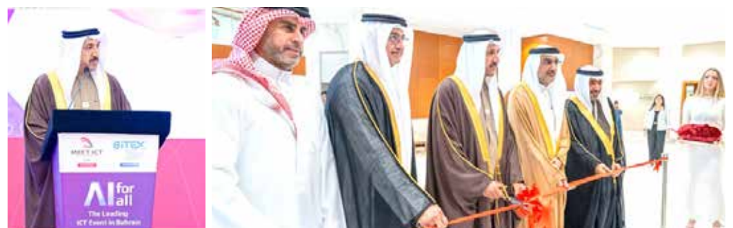
His Excellency Dr. Shaikh Abdullah bin Ahmed Al Khalifa, Minister of Transportation and Telecommunications, inaugurated the 12th Middle East Technology Information Conference (MEET ICT) and Bahrain International Technology Exhibition (BITEX) under the theme "AI for All" on December 3-5. The minister highlighted Bahrain's development in digital transformation, AI integration, and innovation under the vision of His Majesty King Hamad bin Isa Al Khalifa and the government's initiatives led by His Royal Highness Prince Salman bin Hamad Al Khalifa, the Crown Prince and Prime Minister. Dr. Shaikh Abdullah bin Ahmed noted Bahrain's top global rankings in internet penetration, 5G coverage, and cybersecurity, emphasizing the Kingdom's commitment to leveraging AI and digital technologies to drive economic growth and sustainable development. The minister praised national initiatives such as the Nasser Artificial Intelligence Research and Development Centre, Khalid bin Hamad Competition for Innovation in Artificial Intelligence, and Tamkeen's AI Academy, which support human capital development and technological progress.