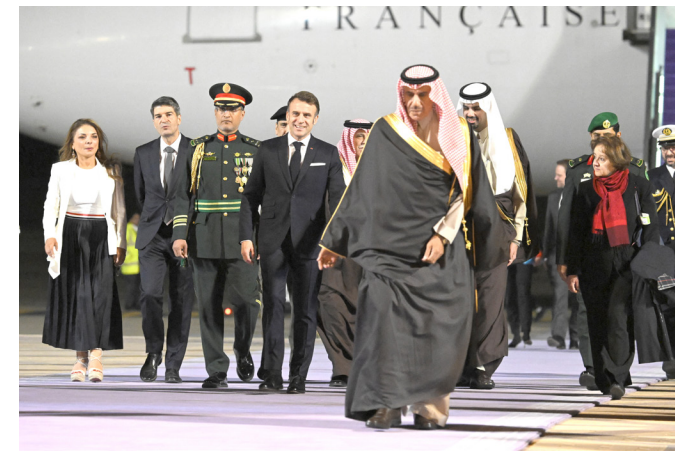
French President Emmanuel Macron disembarks his aeroplane after arriving in the Saudi capital Riyadh for an official visit