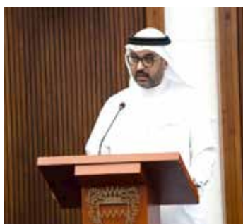
MP Ahmed Al Salloom