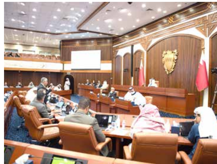
The Council of Representatives' session in progress

measures are essential to protect employers from potential breaches of trust and disruption in their operations.