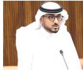
MP Abdulwahid Qarata