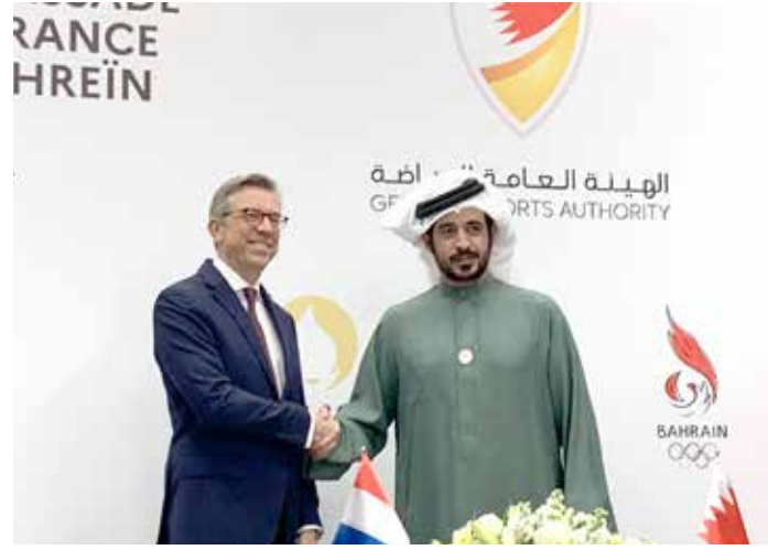
HH Shaikh Khalid bin Hamad Al Khalifa and French Ambassador Éric Giraud-Telme with athletes

Bahrain was recognized for its stellar performance at the Paris Games, where the Kingdom ranked first among Arab nations, securing four medals, including two gold. Medalists such as Winfred Yavi, Akhmed Tazhudinov, and Gor Minasyan were in attendance, with Salwa Eid Naser receiving an honorable mention.