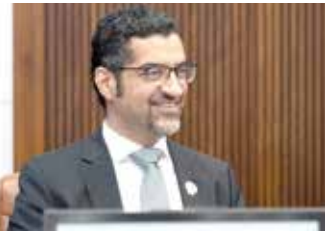
“We started with 800 housing units, and when the project was moved to the Ministry of Municipalities Affairs, we added 2,700 more.” - H.E. WAEL AL MUBARAK, MINISTER OF MUNICIPALITIES AFFAIRS AND AGRICULTURE