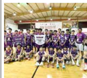
Bahrain's Filipino team