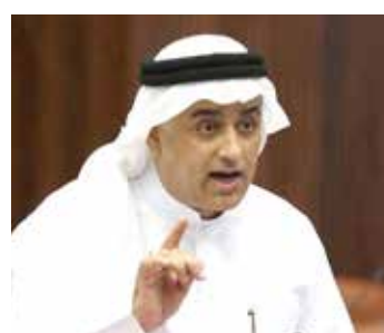
MP Mamdooh Al Saleh

proach ensures accountability and maximises the impact of the investment, fostering a culture of continuous improvement within the youth centres.