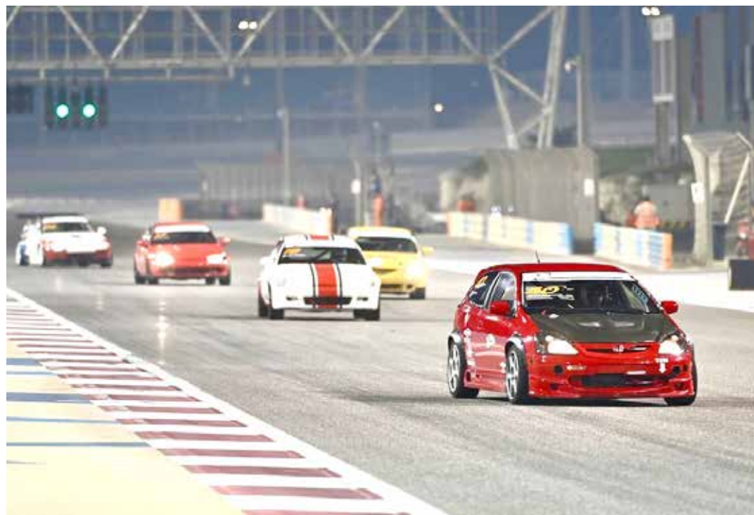
Action from a previous race at BIC

All are welcome to attend Friday's events. Tickets cost just BD2 for adults and BD1 for children. Fans will get to witness some of the best Bahrain-based