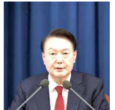
South Korean President Yoon Suk Yeol

Opposition MPs last week approved a significantly downsized budget plan through a parlia-